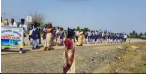
LAHUNIPARA HIGH SCHOOL.