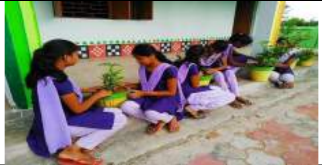
GAPABANDHU GOVT.HS HAREKRUSHNAPUR