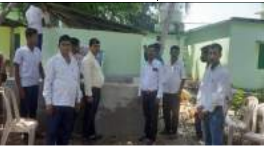
ATAL BEHARI GOVT.NODAL HIGH SCHOOL