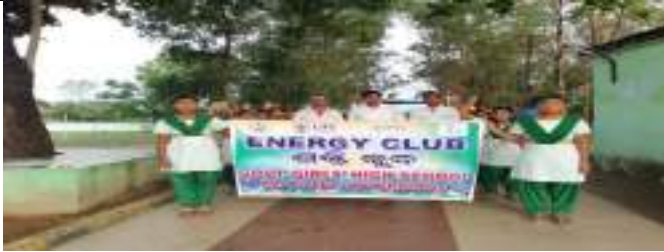
GOVT GIRLS HIGH SCHOOL, KAPTIPADA