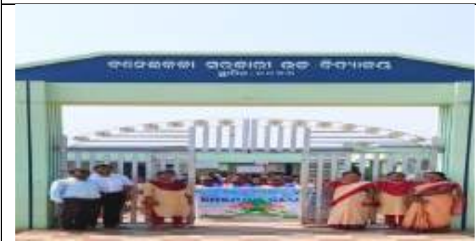
BANEIKALA GOVT HIGH SCHOOL