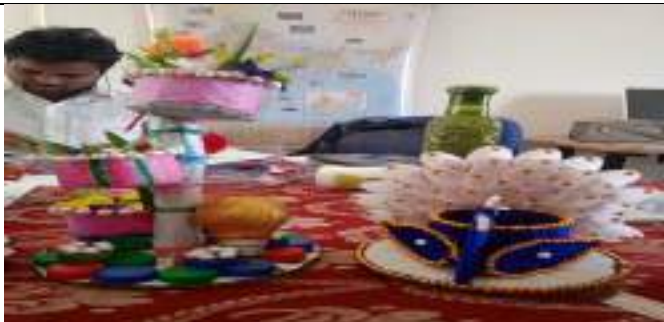
USHARAYMULTI PURPOSE GIRLS HIGH SCHOOL