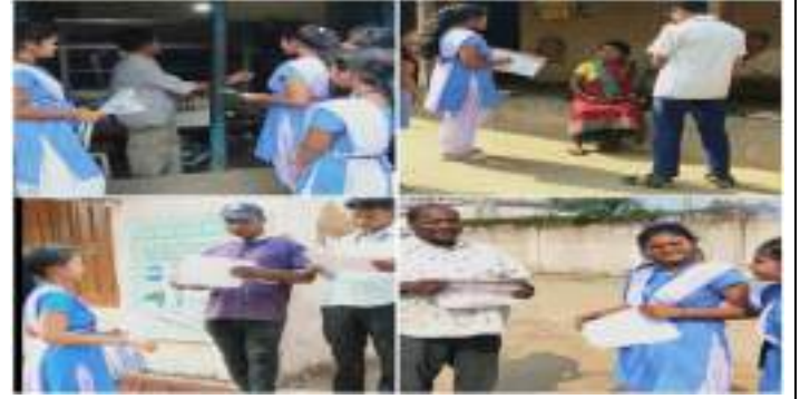
GOVT HIGH SCHOOL, ASANA