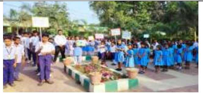
KUARMUNDA HIGH SCHOOL