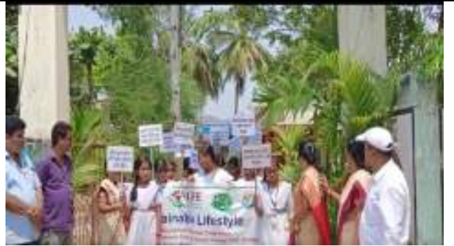
GHATIPARI HIGH SCHOOL, BALLIPADA