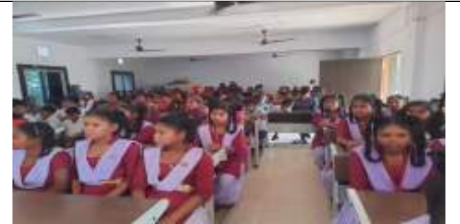
GOVT.GIRLS HS, LEPHRIPARA