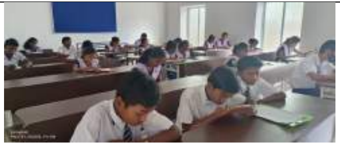
SHIRSAGOVT HIGH SCHOOL