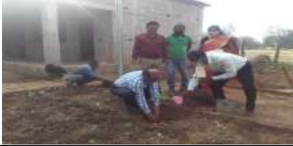
GOVT. LALBAHADUR HIGH SCHOOL, PAPADAHANDI