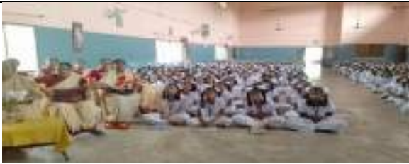
ST.MARRY GIRLS HIGH SCHOOL,SUNDARGARH