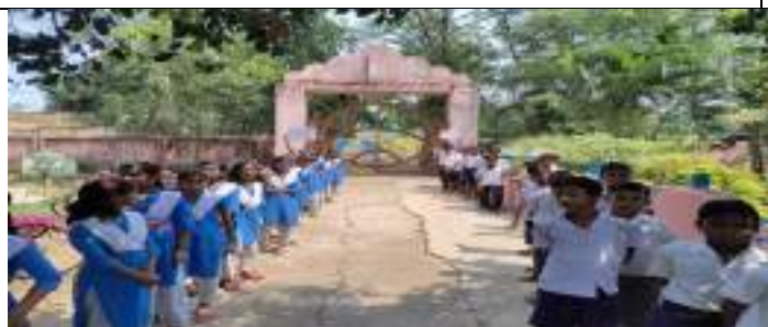
UDAYABATA HIGH SCHOOL, PATUNIA