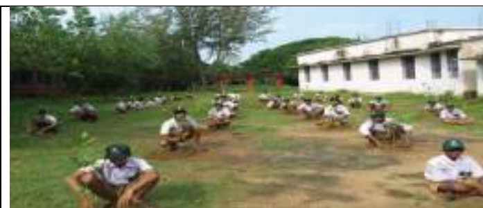
GOVT NODAL HIGH SCHOOL, C.S.PUR