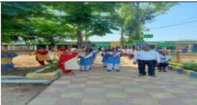
KARANJIA GOVT HIGH SCHOOL