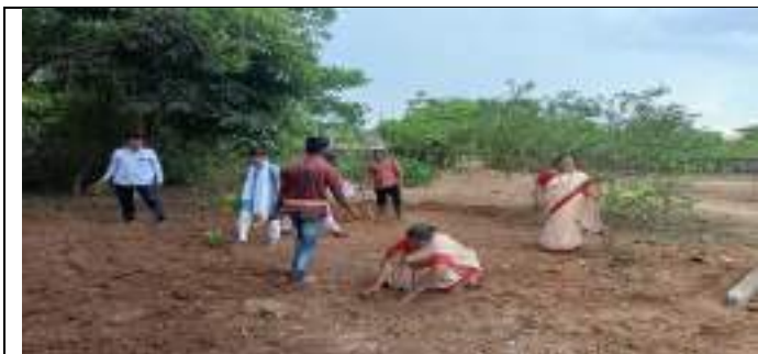
NEHRU GOVT. HIGH SCHOOL