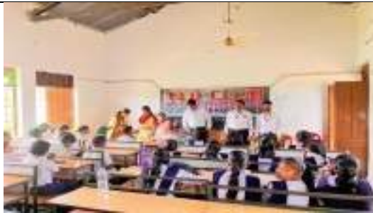
SS GOVT. HIGH SCHOOL, UMERKOTE