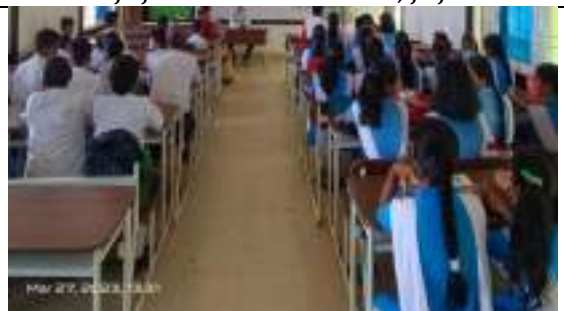
CHROME NAGAR BIDYAPITHA