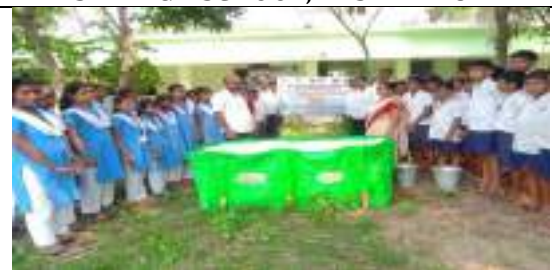
GOVT. HIGH SCHOOL, AVANA