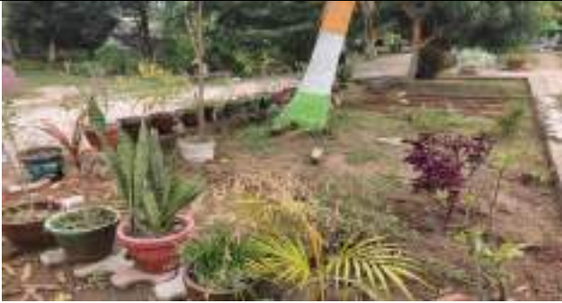
NANDANKANAN GOVT HIGH SCHOOL