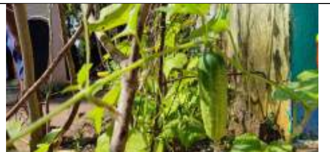
KALINGA HIGH SCHOOL, BADA KUMARI