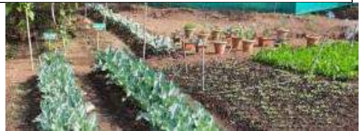
CAPITAL HIGH SCHOOL, UNIT-II, BHUBANESWAR