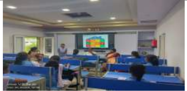
B.S HIGH SCHOOL, SUNDARGARH