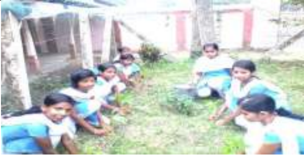
GOVT.GIRLS HIGH SCHOOL, UNIT-1, BBSR