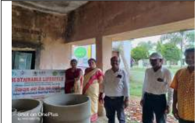
AKHANDALAMANI NODAL HIGH SCHOOL