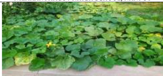
GOVT.HIGH SCHOOL, SAHEEDNAGAR