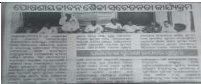
ISHANESWAR HIGH SCHOOL, RAJENDRAPUR, JAJPUR