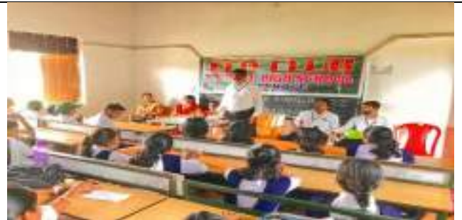
SS GOVT. HIGH SCHOOL, UMERKOTE