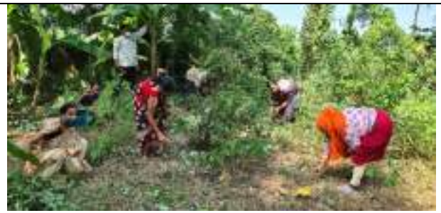
GOVT. (SSD) GIRLS HIGH SCHOOL, DABUGAM