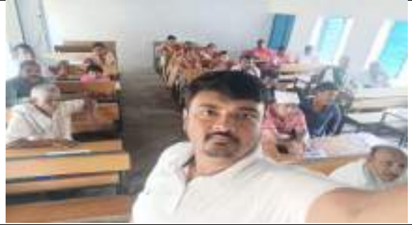
RASALPUR GOVT HIGH SCHOOL