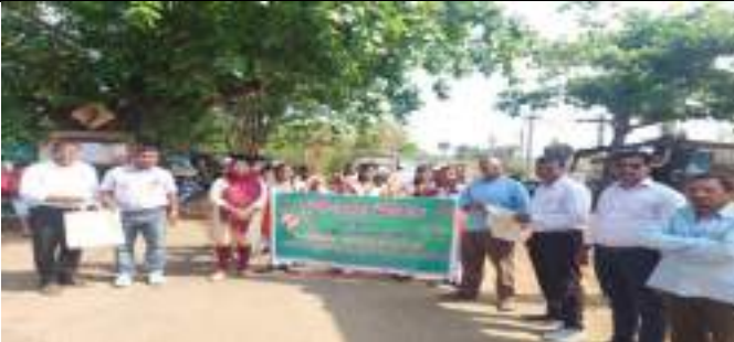
ARYA. KANYA. GURUKUL, TANARADA