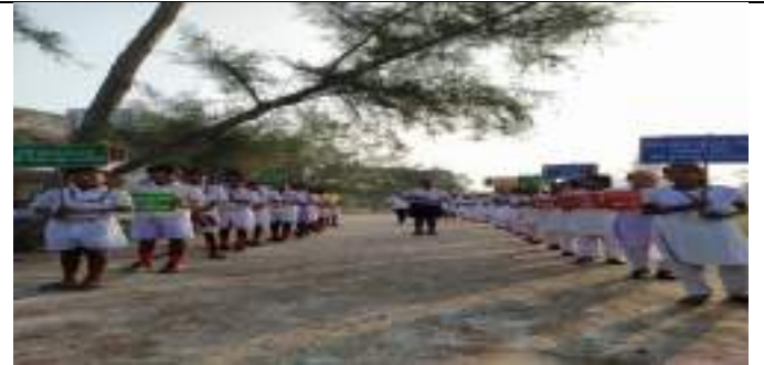
SANANOI GOVT. HIGH SCHOOL, JASHIPUR