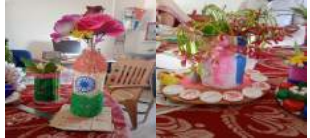
MAHATMA GANDHI HIGH SCHOOL