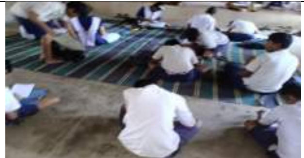
CHHATENPALI GP HIGH SCHOOL