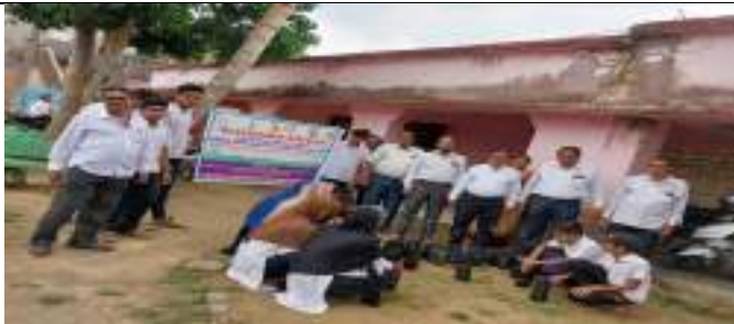
NAIGUAN DAUDPUR H.S, KOILI BLOCL (3)