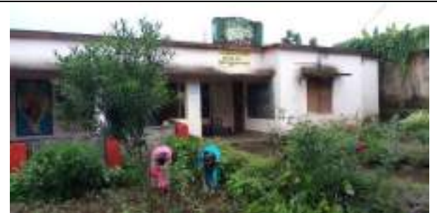
GOVT. U.G HIGH SCHOOL, SEMALA