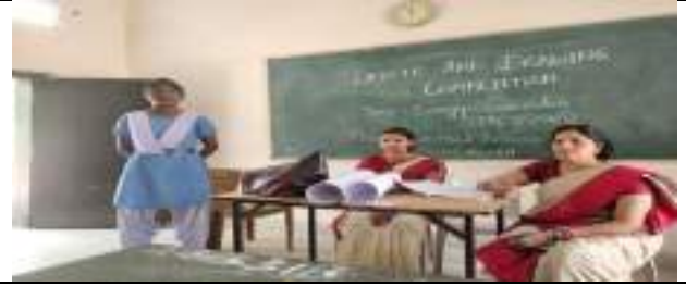
ST DAV GOVT. HIGH SCHOOL, VEDVYAS