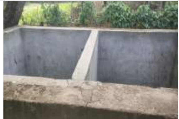
BHAGABAN CHANDRA HIGH SCHOOL, KAINAGARI