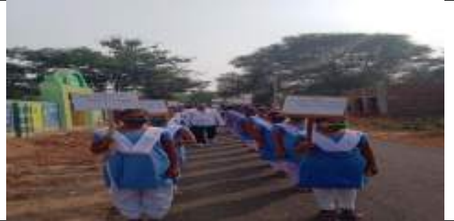
PANCHAYAT HIGH SCHOOL, KENVETA