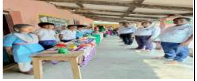
MAABUDHIJAGULAI U.P(ME) SCHOOL, RASUNA