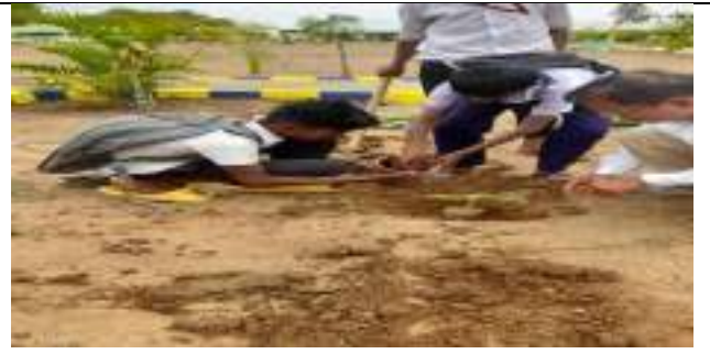
GOVT. NODAL HS, JAMRUNDA