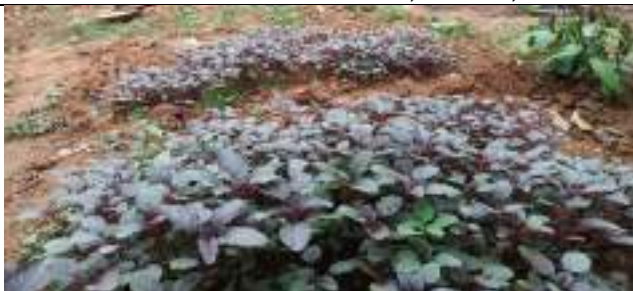
VIVEKANANDA SHIKSHA KENDRA,BDA COLONY. C.S.PUR