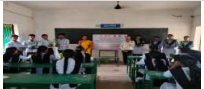
RAMACHANDRA KALPANA H.S. SCHOOL, PRAKRUTI VIHAR