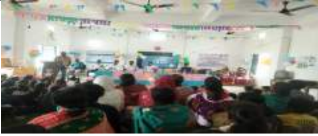
TARKERA HIGH TARKERA