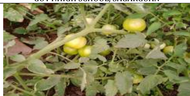
LAXMIDHAR GOVT. HIGH SCHOOL