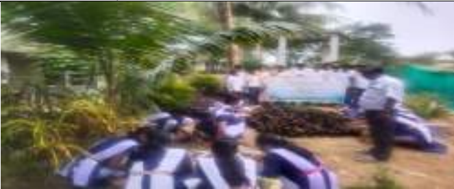
PANCHAYAT HIGH SCHOOLKANTAPARI, N.KOILI