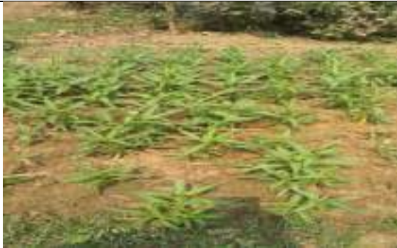
DIVYA HRIDAY GIRLS HS, TENTULIKHUNTI