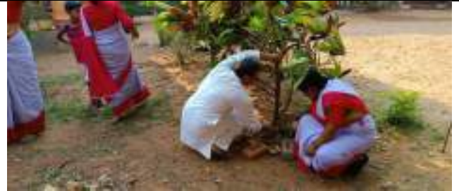
SARASWATI SISHU MANDIR, NUAGADA