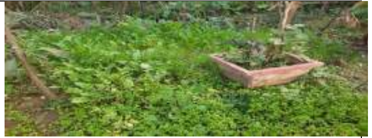
KUSHAVADRA GOVT. HIGH SCHOOL, BHAKARSAHI