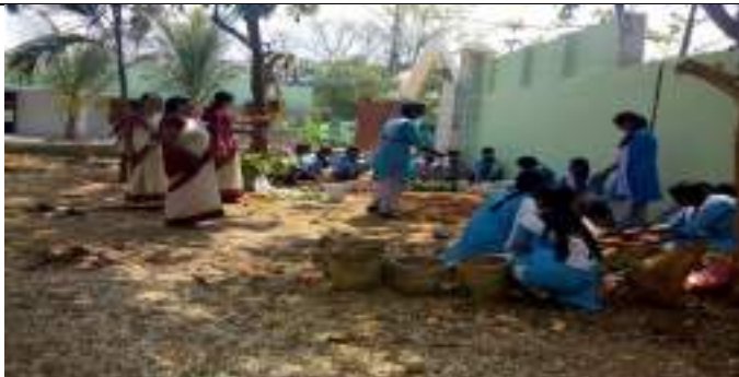
SACHALA DEVI GIRL'S HIGH SCHOOL, BRAHMAPURA