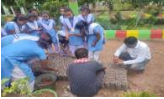
MGP H.S POLSAGORA