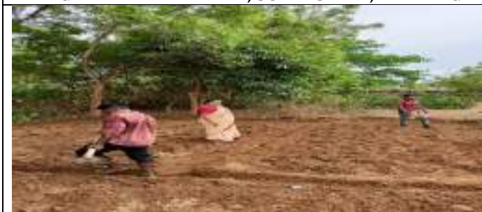
ODISHA POLICE HIGH SCHOOL