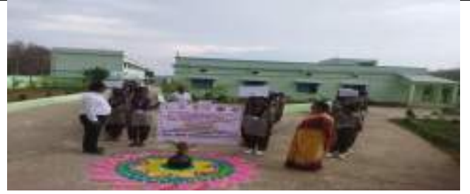
TARKERA HIGH TARKERA