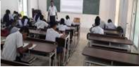
GOVT. HIGH SCHOOL, KINJIRMA