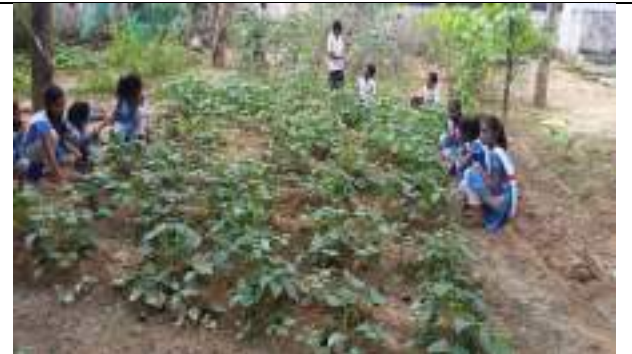
GOVT. HIGH SCHOOL, KOSAGUMUDA