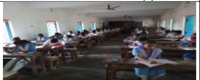
GOVT PS HARIPUR RASULPUR JAJPUR