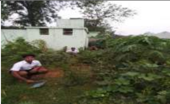
SANGRAMI RABISINGH HS, SILATI