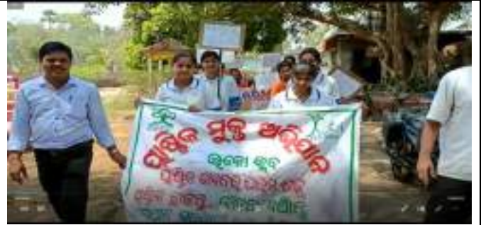
MADHUPURGOVT HIGH SCHOOL, KANIKAPADA