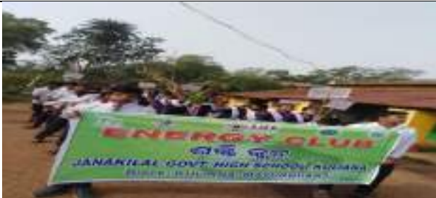
JANAKILAL GOVT HIGH SCHOOL KULIANA