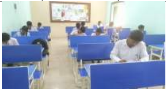
BALUKESWAR HIGH SCHOOL, OLAMBA