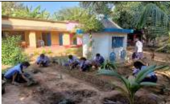
GOVT. HIGH SCHOOL, JAGANNATHPUR