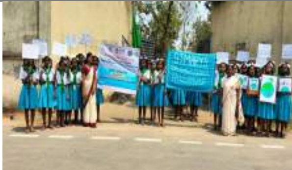
ST. MARY'S GIRLS HIGH SCHOOL, RAJGANGPUR