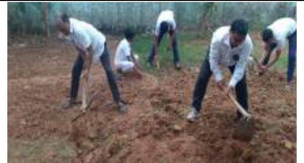
GOVT. UGHS TELANADIGAM, JHARIGAM