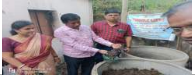
GOVT HIGH SCHOOL TILLO