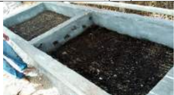
SIMANTA SHIKSHYA NIKETAN BALASORE