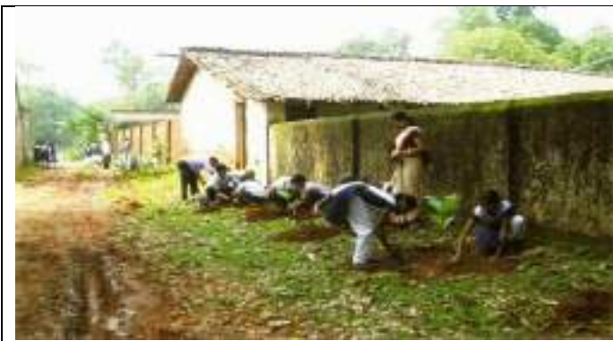
GOVT HIGH SCHOOL , JAGANATH PRASAD, ANDHARUA