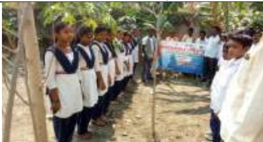
BANADURGA HIGH SCHOOL, DEOBANDHA