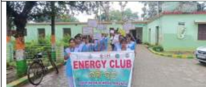
GOVT. HIGH SCHOOL, KHUNTA