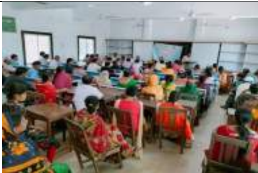
GOVT. GIRLS HIGH SCHOOL, BHADRAK