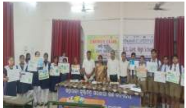
M.K.C GOVT HIGH SCHOOL, BARIPADA