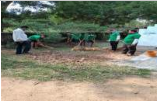
GOVT. U.G HIGH SCHOOL, MAJHIDHANUA