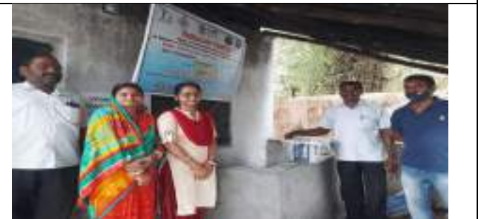
S.N HS BHIMPUR