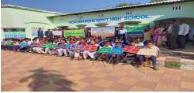
GOPABANDHU GOVT HIGH SCHOOL