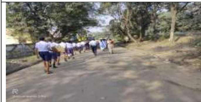
KOSTHA GOVT HIGH SCHOOL