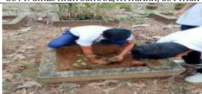
TULASIPUR HIGH SCHOOL