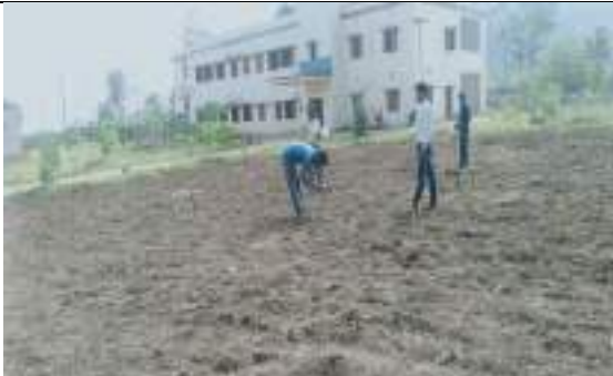
GOVT SSD GIRLS HIGH SCHOOL DALABEDA