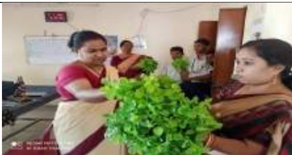
SATYABHAMAPUR NODAL HIGH SCHOOL