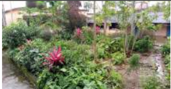
GOVT. U.G HIGH SCHOOL, SEMALA