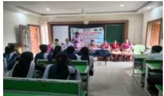
DC HIGH SCHOOL ORASAH