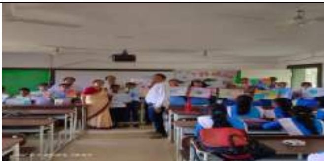
RAMBAG GOVT HIGH SCHOOL, DASARATHAPUR