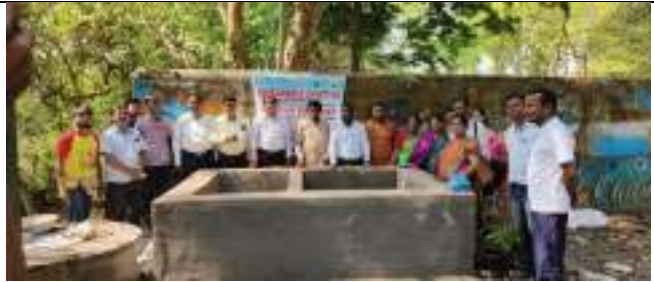
PANCHAYAT GOVT HIGH SCHOOL, BETADA