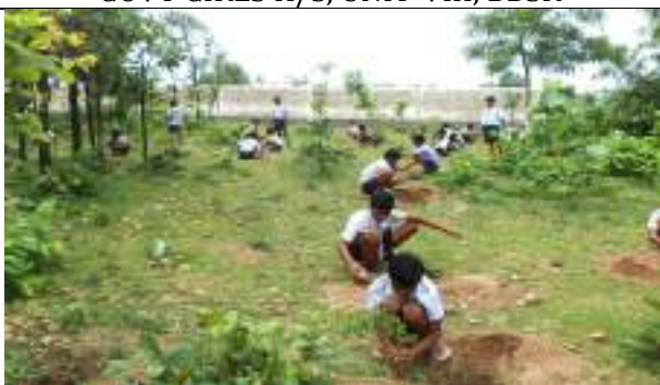
BALARAMDEV BIDYAPITHA, TANGI