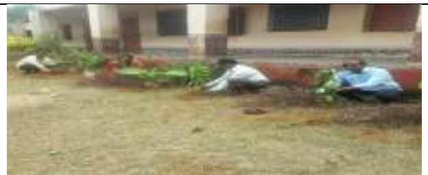
BUTUPALI U.P.S (BUTUPALI UGME)