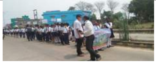
GOVT. HIGHSCHOOL, JARDA