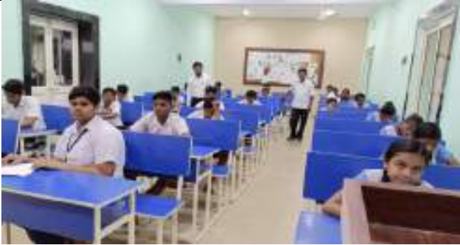
BUDHAGIRI BIDYAPITHA BAGUDA