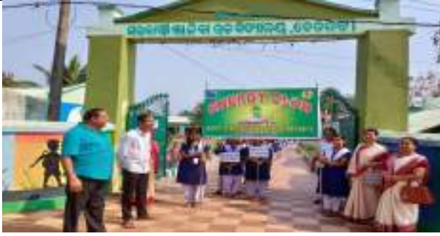
GOVT.GIRL HIGH SCHOOL, BETANOTI