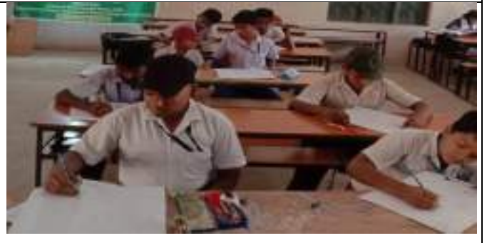
RAJAPUR HIGH SCHOOL