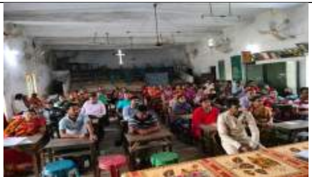
MISSION GIRLS HIGH SCHOOL