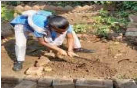
KUNDHI PADAR G.P.S.