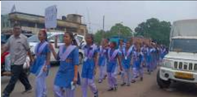
BUDHARAJGOVT HIGH SCHOOL, DANAGADI