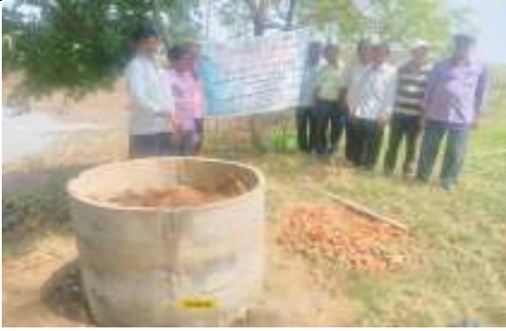
TRUST HIGH SCHOOL