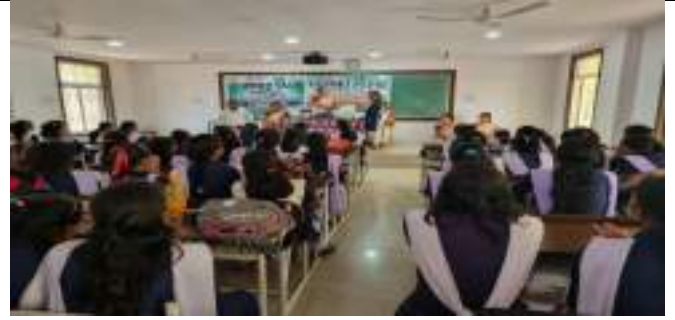
GOVT GIRLS HIGH SCHOOL, UDALA