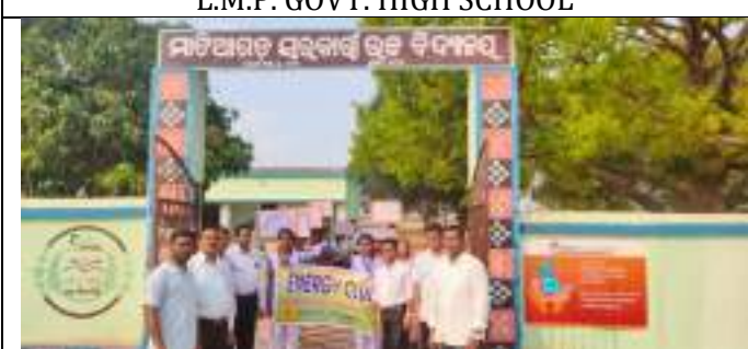
MATIAGARH GOVT. HIGH SCHOOL MATIAGARH