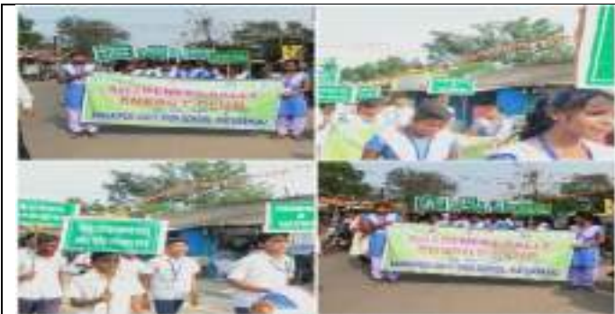
BANGRIPOSI GOVT HIGH SCHOOL