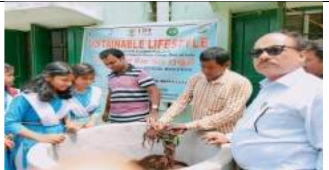
GOVT. GIRLS HIGH SCHOOL, BHADRAK