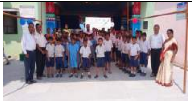
S.L.N.M.MPL. HIGH SCHOOL, COURTPETA