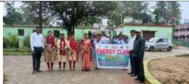
GOVT. HIGH SCHOOL, KHUNTA