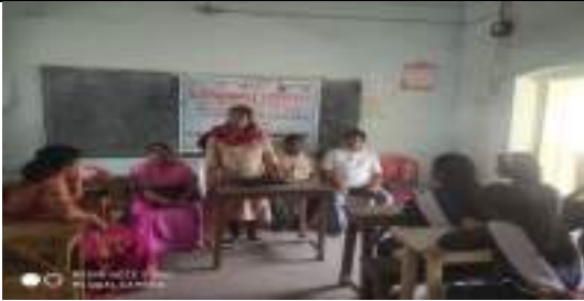
RCBL HIGH SCHOOL, CHARAMPA