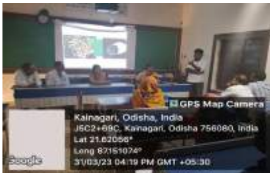
BHAGABAN CHANDRA HIGH SCHOOL, KAINAGARI