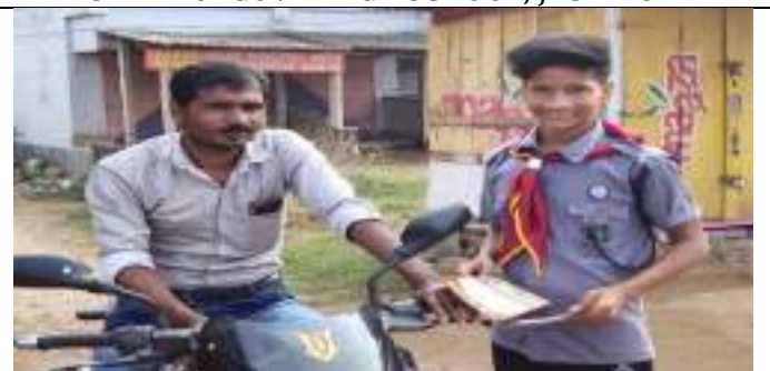
B.N. GOVT HIGH SCHOOL, JAMUKESWAR