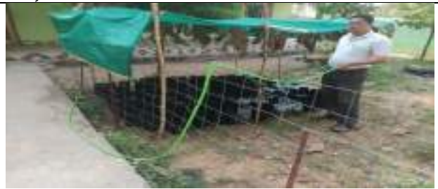
GOVT.HIGH SCHOOL RAMAGARH