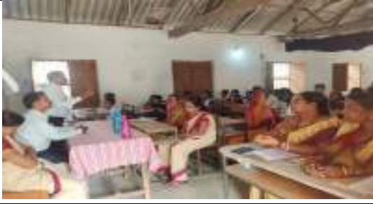
R.C. HIGH SCHOOL, DADARPUR