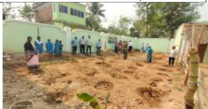
CHATURBHUJ HIGH SCHOOL, SAMPUR