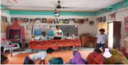
SIDHESWAR UP SCHOOL, UCCHADIHA