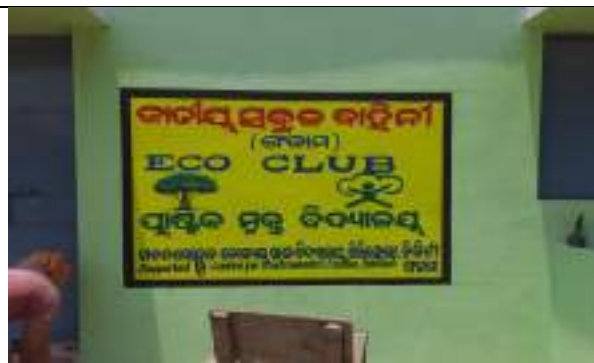
MADAN MOHAN NODAL HIGH SCHOOL, GIRISOLA