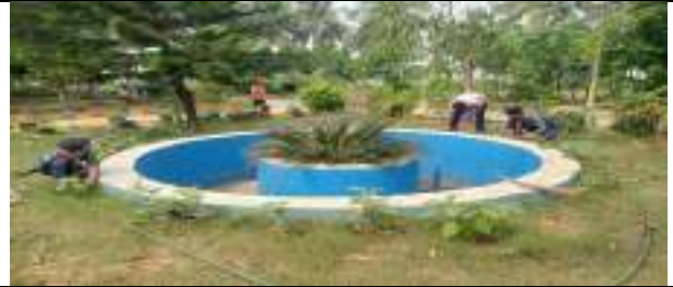
B.B.N. HIGH SCHOOL, SARASARA