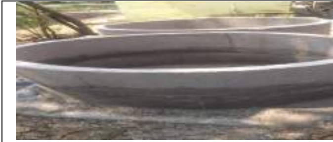
J.K.K.S. GOVT HIGH SCHOOL PADMAPUR