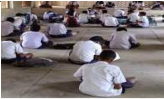
GOVT. HIGH SCHOOL, BISRA