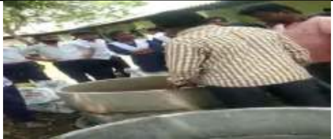
RCBL HIGH SCHOOL, CHARAMPA