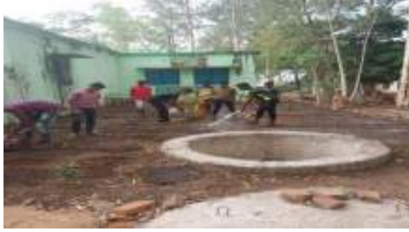
SAHID LAXMAN NAYAK HIGH SCHOOL DHODRA