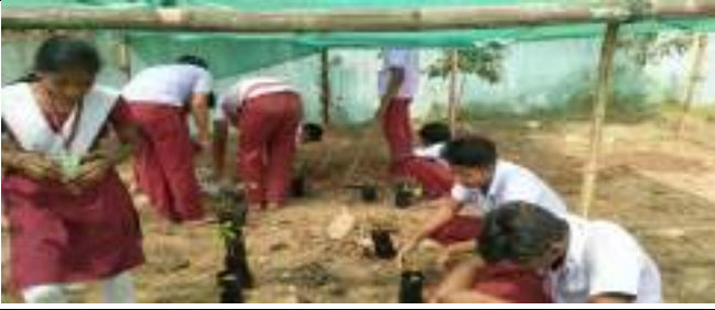
SUBUDHESWAR MILITA BIDYAPITHA, BANRA