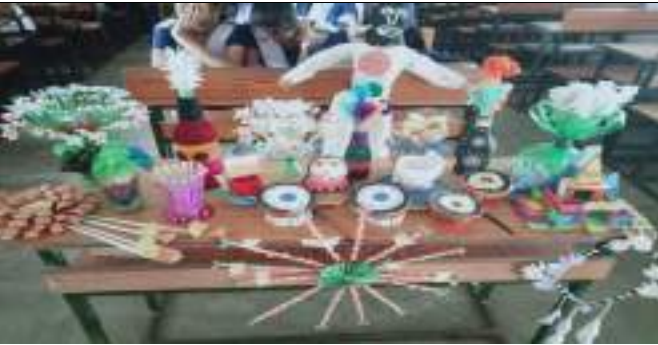
BIDHAN CHANDRA GOVT.HIGH SCHOOL, BALIAPALA