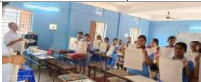
C. S. A. GIRLS HIGH SCHOOL, B. D. PUR