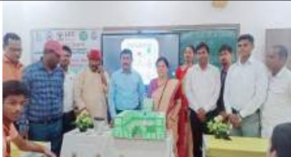
NAC. GOVT. COE HIGH SCHOOL, SEC-6, ROURKELA