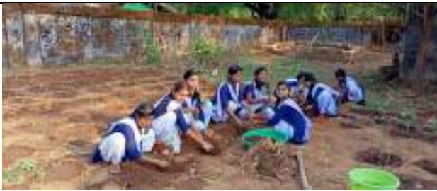
CAPITAL GIRLS H/S ,UNIT-II, BBSR