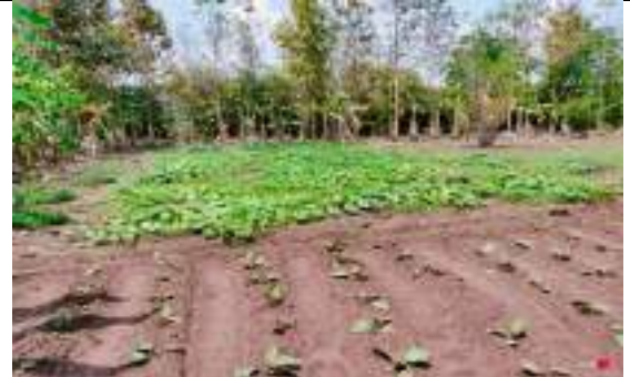
SRI AUROBINDO INTEGRAL EDUCATION CENTRE KHATIGUDA