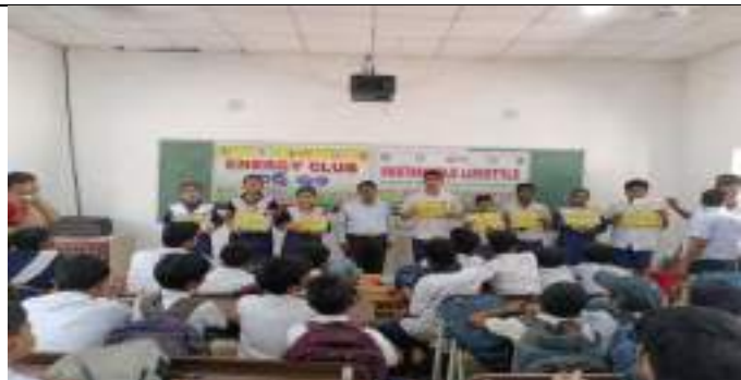
M.P.C. HIGH SCHOOL, BETNOTI