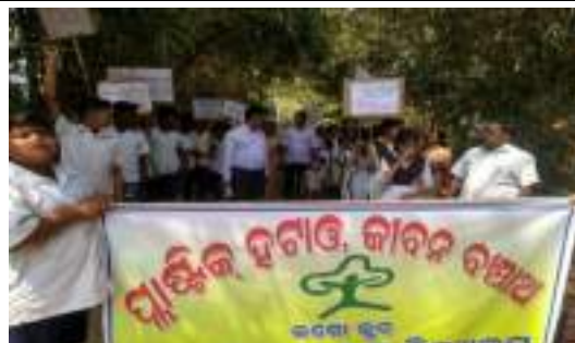
PADMANAV NODAL HIGH SCHOOL, GOLKUND