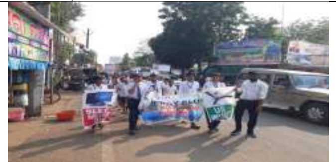
UDALA HIGH SCHOOL