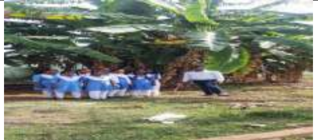
NODAL GOVT. BAPUJI HIGH SCHOOL, TENTULIKHUNTI