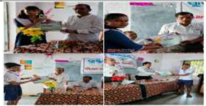
BIDHAN CHANDRA GOVT.HIGH SCHOOL, BALIAPALA