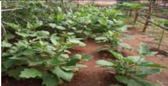
NODAL GOVT.PS HS, TARAGAM