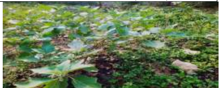
VIVEKANANDA SHIKSHA KENDRA,BDA COLONY. C.S.PUR