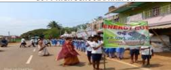
L.M.P. GOVT. HIGH SCHOOL