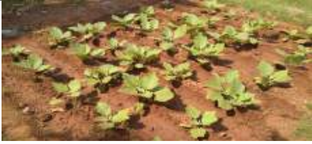
MAHARANA BIRABARA GOVT H/S, CHANDAKA