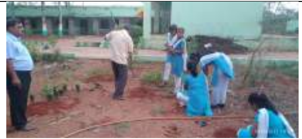
KUNDHI PADAR G.P.S.