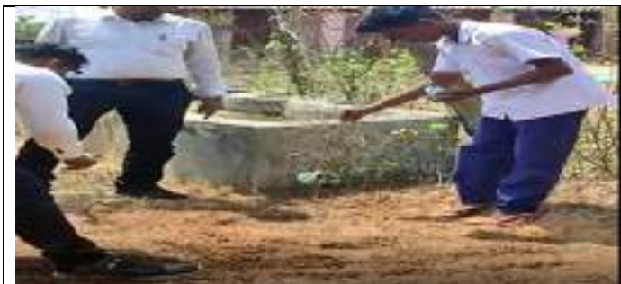
RAVENSHAW COLLEGIATE SCHOOL, CUTTACK