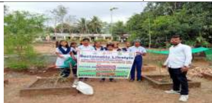
SARANDABIDYAPITHA, SUBARNAPUR, BANKI