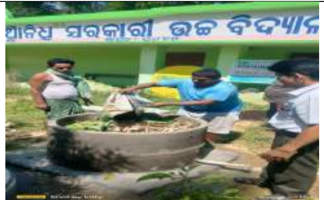
BN Govt High School, Jaypur