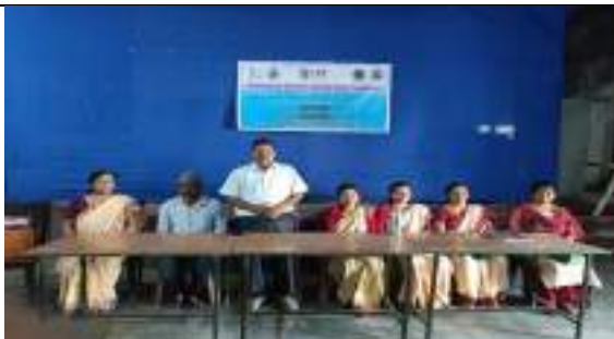
MISSION GIRLS HIGH SCHOOL