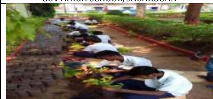
LAXMIDHAR GOVT. HIGH SCHOOL