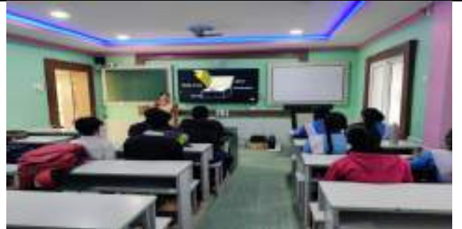
GOVT. HIGH SCHOOL, UDIT NAGAR