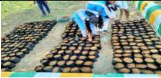
KANTAMAL GOVT HIGH SCHOOL KANTAMAL