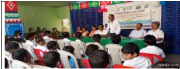
S.L.N.M.MPL. HIGH SCHOOL, COURTPETA