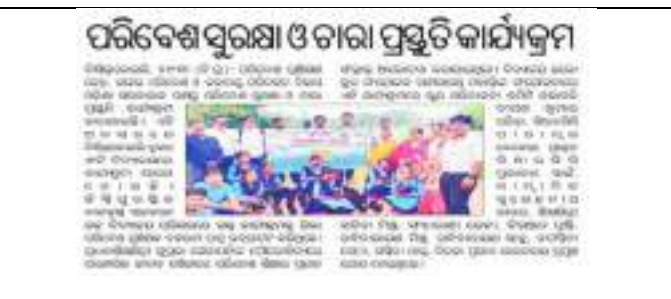
BALAKRUSHNAGOV'T HIGH SCHOOL, JIGNIPUR