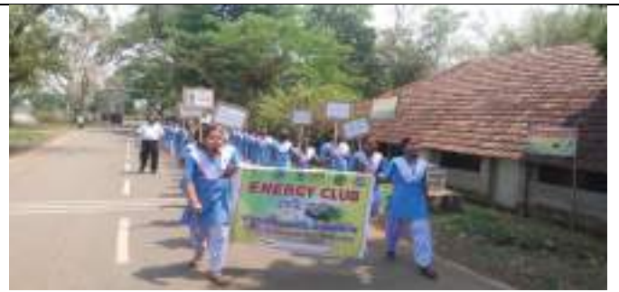
GOVT HIGH SCHOOL, RANGAMATIA