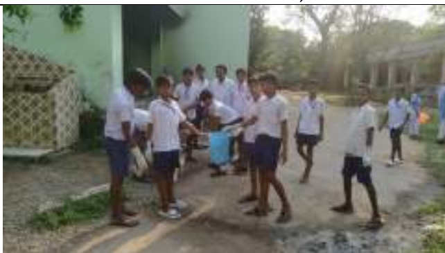
ONSLow GOVT. HIGH SCHOOL