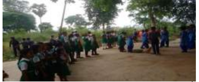
AJANBANA SOVANIYA SIKSHYASHRAM