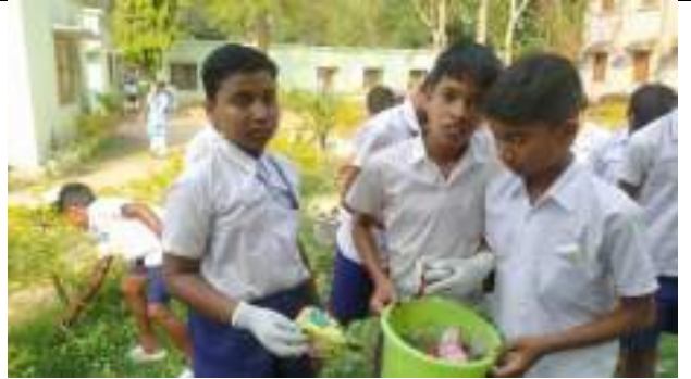
BUDHAGIRI BIDYAPITHA BAGUDA