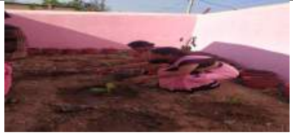
GOVT. SSD GIRLS HS JODINGA