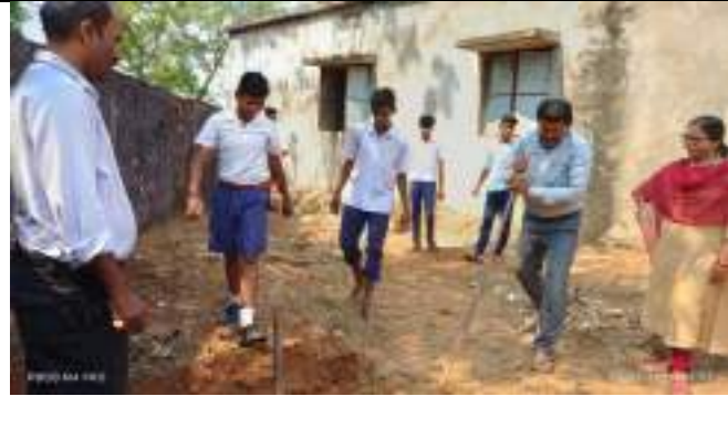
MUNDALI NODAL HIGH SCHOOL