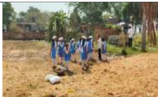
SAHID GIRLS HIGH SCHOOL, KALAMATIA