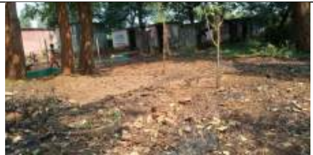
GOVT. ME SCHOOL, DABUGAM