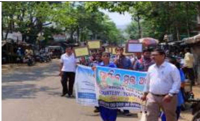
SARAT CHANDRA PANDA SMARAKI UTCHHA BIDYALAYA