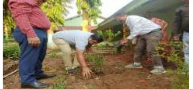
RCD NODAL GOVT HIGH SCHOOL NABARANGPUR