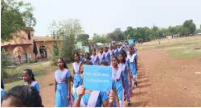
GOVT HIGH SCHOOL, ASANA