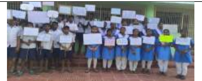
SONAPARBAT GOVT. HIGHSCHOOL