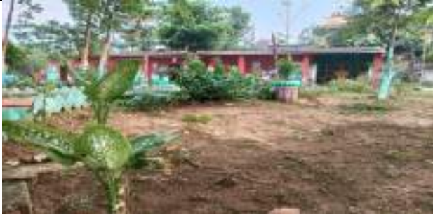
GOVT HIGH SCHOOL POWER HOUSE COLONY UNIT-8