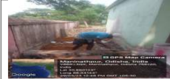
N.K.P GOVT HIGH SCHOOL - MANINATHPUR