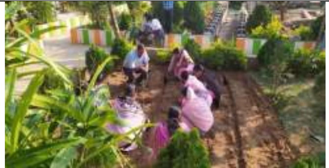
BANAMALIPUR UGME SCHOOL