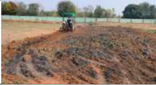
GOVT. U.G HIGH SCHOOL BANKULI