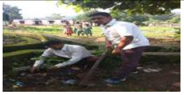
GOVT EX-BOARD UPS RAIGHAR