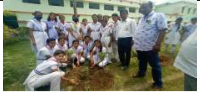
SUNDHI PADAR RKUB