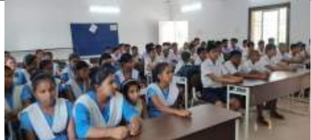
GOVT. JANATA HIGH SCHOOL, BANKI