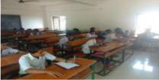
MAHATMA GANDHI HIGH SCHOOL