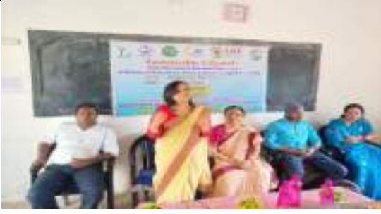
RASALPUR GOVT HIGH SCHOOL