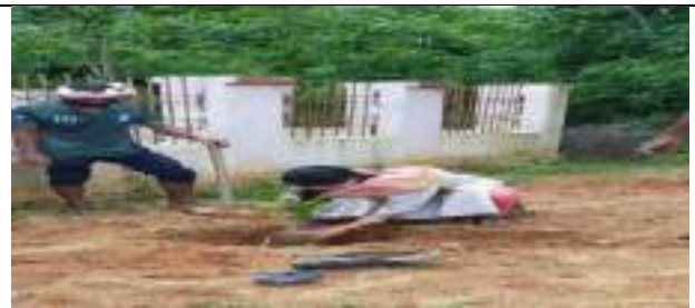
ST. XAVIER P.S