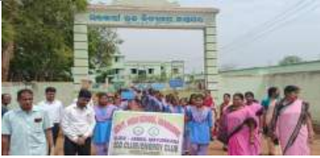
GOVT.HIGH SCHOOL, KANDSORE