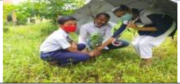
MARJAKUD U.P.S (UGME SCHOOL)