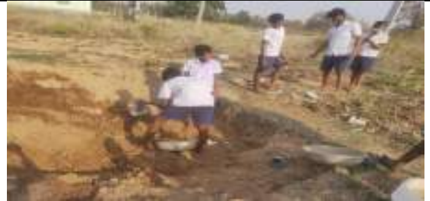
JANATA GOVT HIGH SCHOOL AMBAGAON