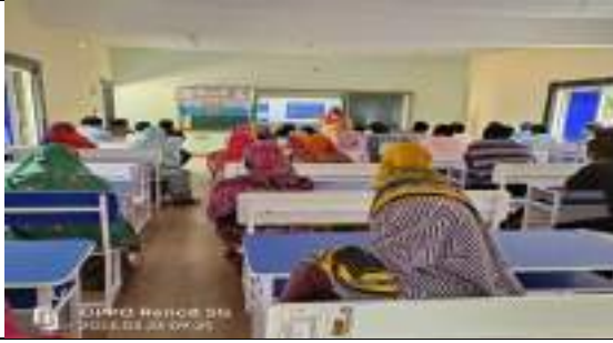
RN ACADEMY, SARASWATIPUR