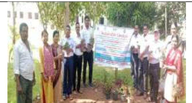
B.N BIDYAPITHA, ATHGARH