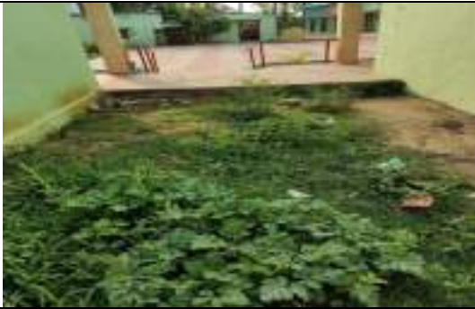
GOVT. NODAL PANCHAYAT HIGH SCHOOL, JHARIGAM