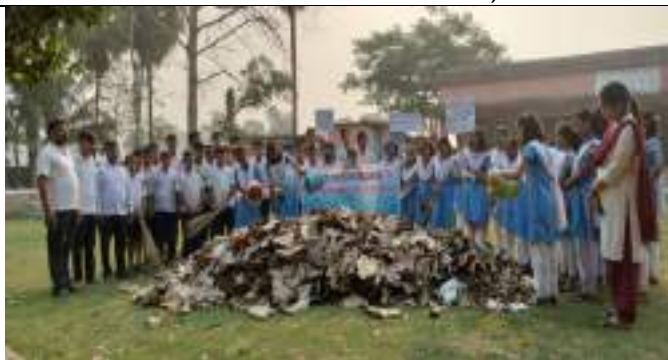
MADHUPURGARH GOVT HIGH SCHOOL