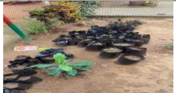
VIVEKANANDA VIDYAPITHA, BAHUGRAM