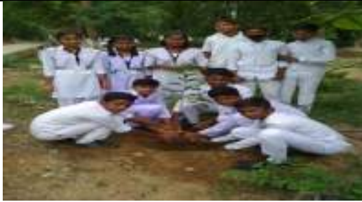
SUNDHI PADAR RKUB