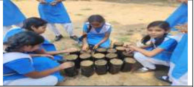
MANAMUNDA GOVT HIGH SCHOOL