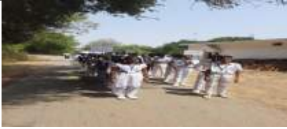
PURKAPALI PANCHAYAT HIGH SCHOOL BIRTOLA