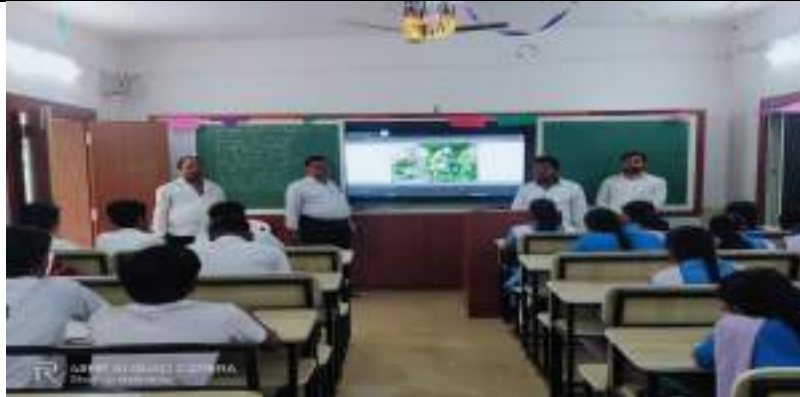
PATITAPABAN GOVT. HIGH SCHOOL GAMBHARIMUNDA