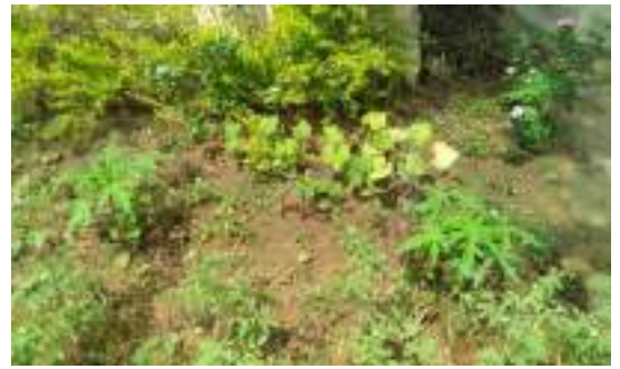
GOVT. NODAL PANCHAYAT HIGH SCHOOL, JHARIGAM