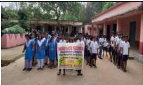
MANAGOBINDA GOVT. U.P. SCHOOL