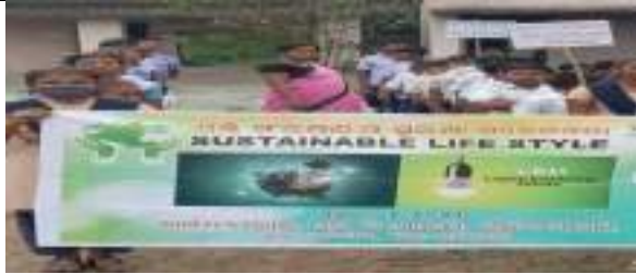
GARJAN BAHAL HIGHSCHOOL