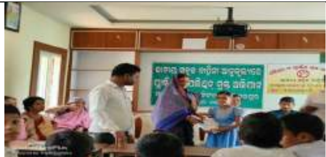
USHARAYMULTI PURPOSE GIRLS HIGH SCHOOL