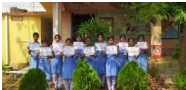
NEHRU GOVT. HIGH SCHOOL