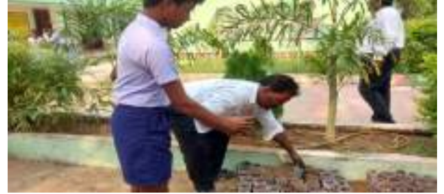
GOVT. NODAL HIGH SCHOOL, BAUNSUNI