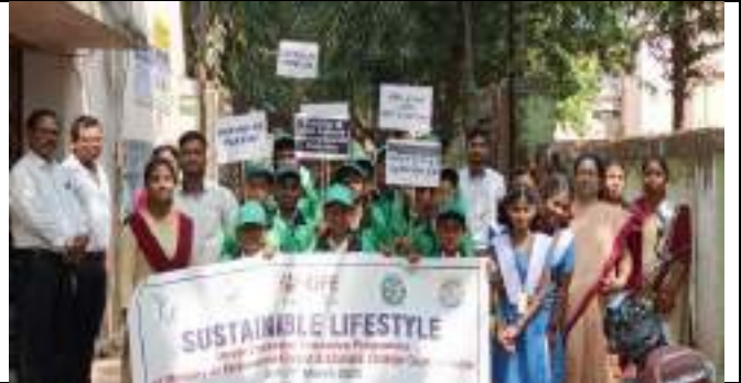
G.B HIGH SCHOOL, POLASARA