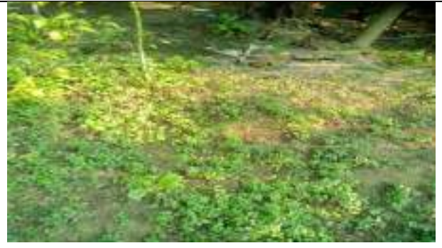
SANGRAMI RABISINGH HS, SILATI