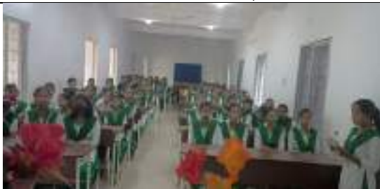
GOVT. HIGH SCHOOL BIRINGATOLI