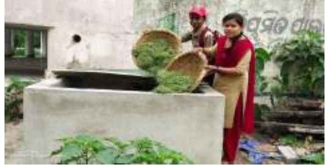
GOVT HIGH SCHOOL, MAHARAJPUR