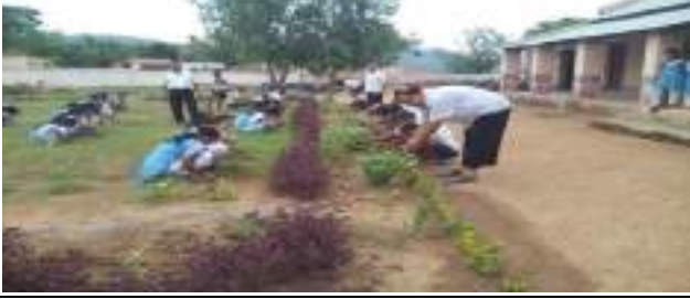
KUSHAVADRA GOVT. HIGH SCHOOL, BHAKARSAHI