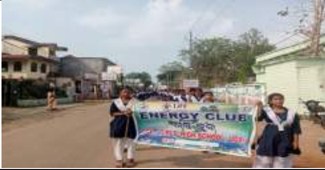
GOVT GIRLS HIGH SCHOOL, UDALA