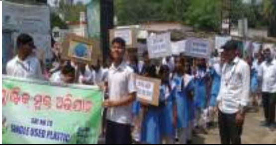
HATIOTA NODAL HIGH SCHOOL