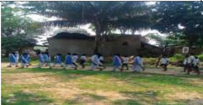
AHIYAS HIGH SCHOOL