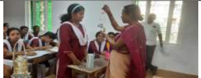
KRUPASINDHU HIGH SCHOOL