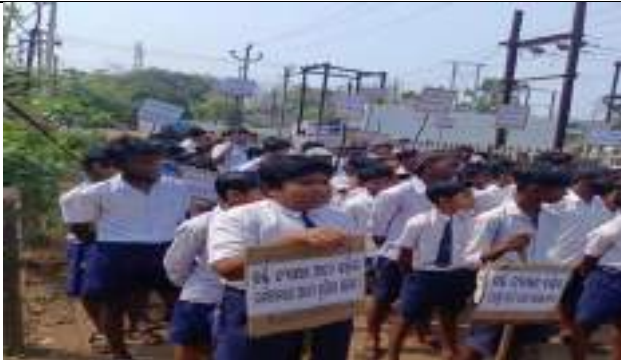
SANANOI GOVT. HIGH SCHOOL, JASHIPUR