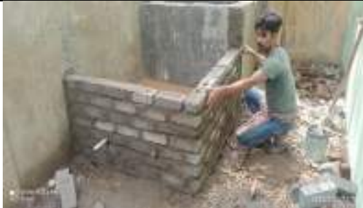
K.C HIGH SCHOOL CO EDN, UTTARBAHINI