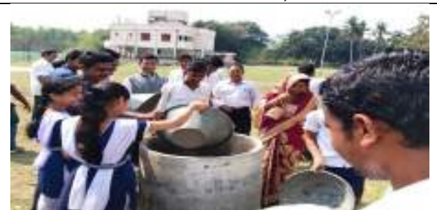
PANCHAYAT GOVT.NODAL HIGH SCHOOL, GUAGADIA