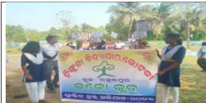
HINGULA VIDYAPITHA, BHOTAKA