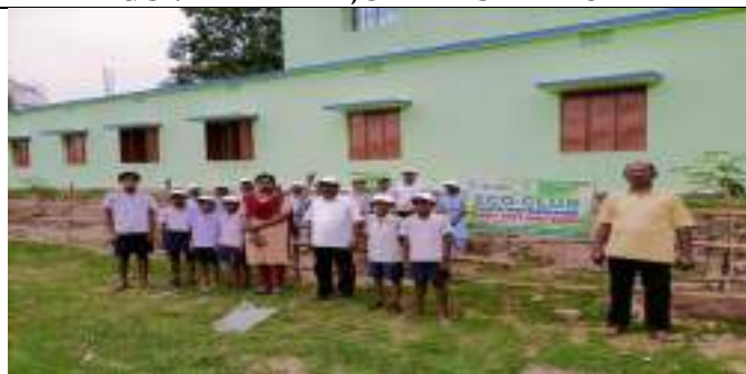
HALADIAGOV'T HIGH SCHOOL, MAHANGA