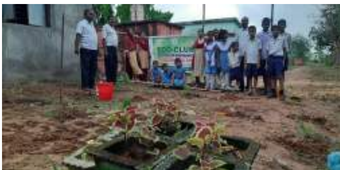
MUNDALI NODAL HIGH SCHOOL