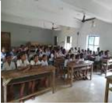
SRI AUROBINDINDO INTEGRAL EDUCATION CENTRE, TAHARPUR