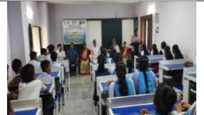
BAPUJI NODAL HIGH SCHOOL