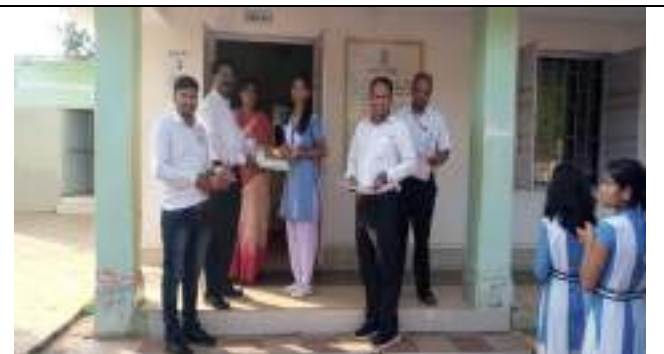
KARANJIA GOVT HIGH SCHOOL