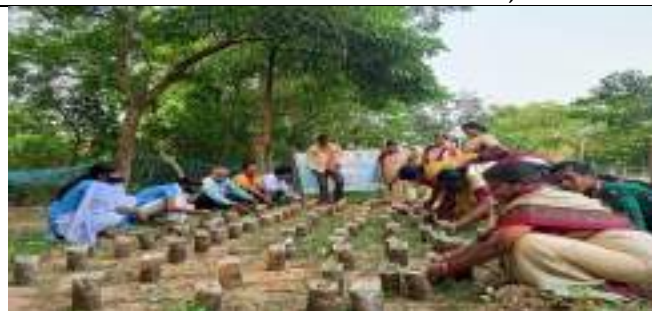
JAYADEV GIRLS HIGH SCHOOL