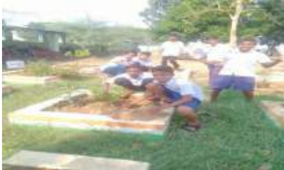
U.G GOVT. NODAL HS, TELIBANDHA