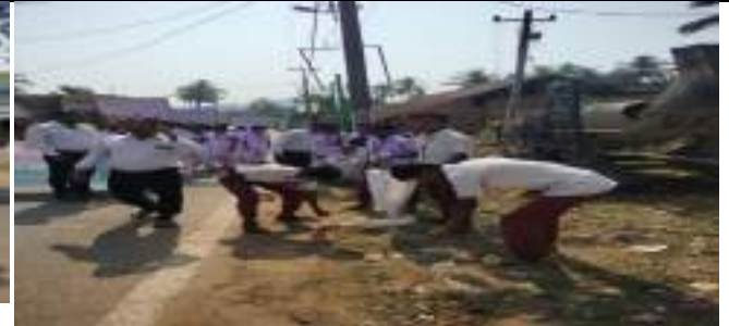
SHYAMASUNDAR GOVT HIGH SCHOOL, MIRRAPUR