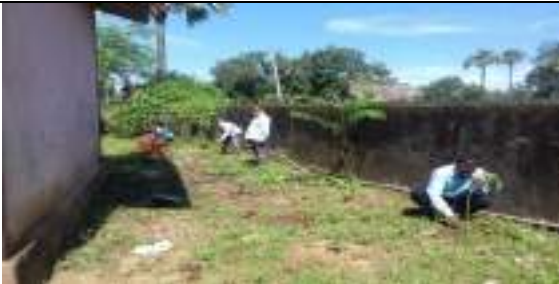
GOVT (N) PANABEDA HIGH SCHOOL, CHANDAHANDI