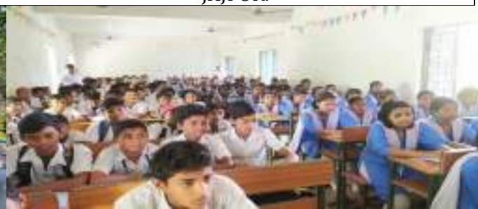
UDAYABATA HIGH SCHOOL, PATUNIA