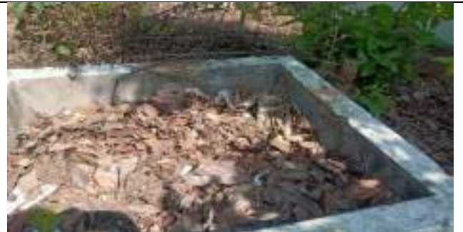
BAMKURA NODAL HIGH SCHOOL, DHUSURI