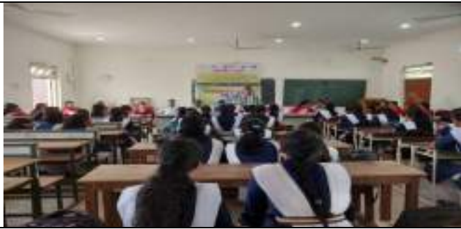
M.P.K. GOVT GIRL HIGH SCHOOL