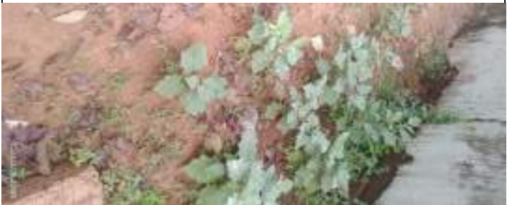
LALBAHADUR GOVT HIGH SCHOOL, PHULNAKHARA