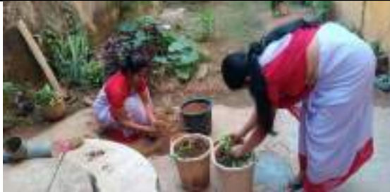
SARASWATI SISHU MANDIR, NUAGADA