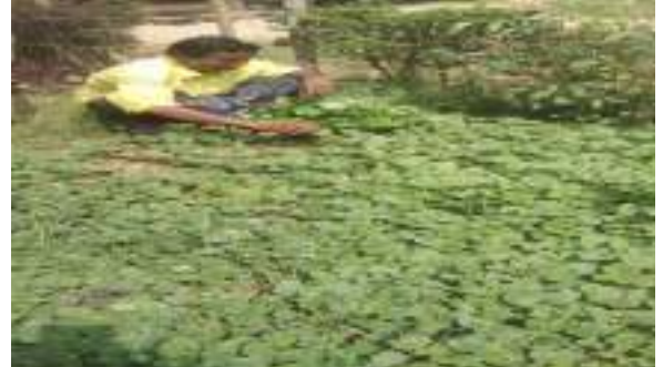
SRI AURIBINDO PURNANGO SHIKYAKENDRA