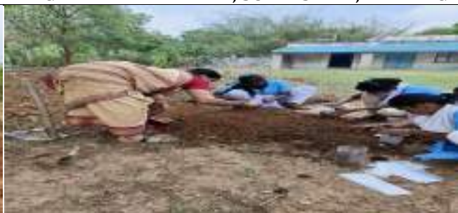
ODISHA POLICE HIGH SCHOOL