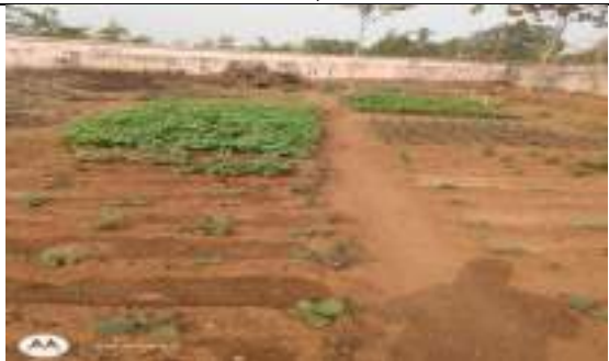
GOVT. UGHS SV VIDYAMANDIR