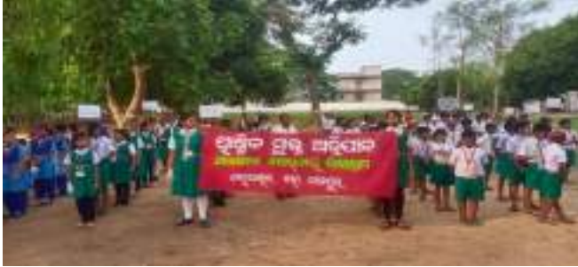
AJANBANA SOVANIYA SIKSHYASHRAM