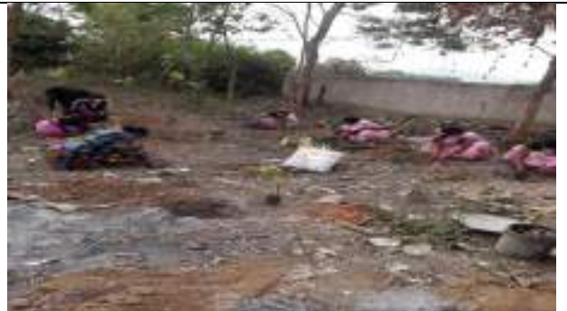
GOVT. UGHS, BORIGAM