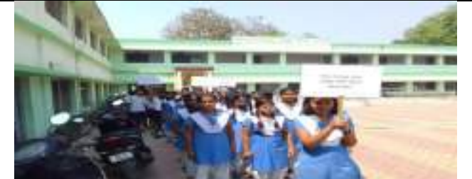
KUMJHARIA GOVT. UG HIGHSCHOOL