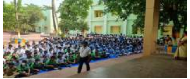
SM HIGH SCHOOL, KHALLIKOTE