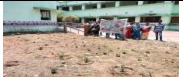
GOVT. GIRLS HIGH SCHOOL UMERKOTE