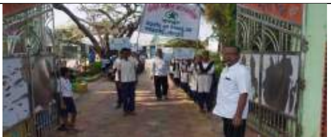
MAHABEER HIGH SCHOOL, DALA, BYASANAGAR