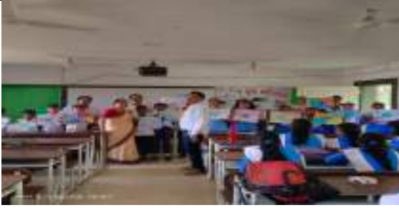
HARI HARA HIGH SCHOOL, ASKA