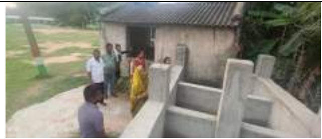
UNION GOVT. HS DUBLAGADI