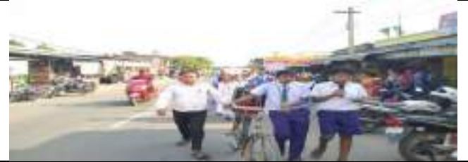
UPENDRA GOVT HS SUBDEGA