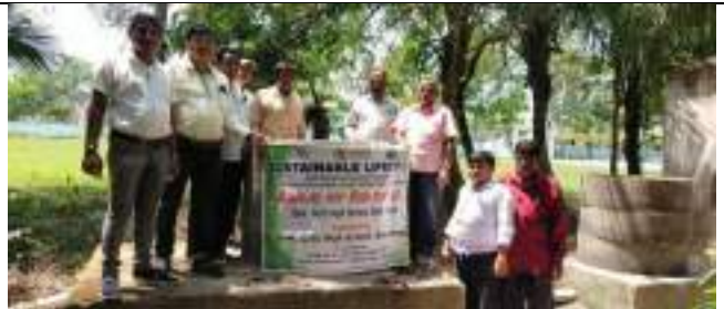
GOVERNMENT GIRLS HIGH SCHOOL, BASUDEVPUR