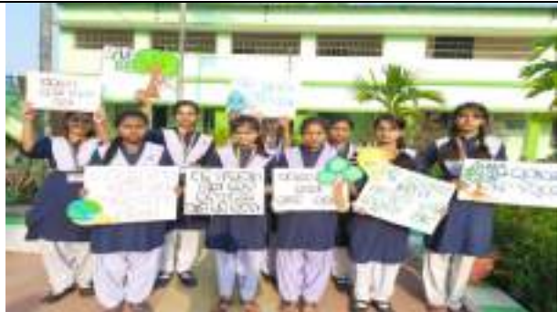
KCP PANCHAYAT HIGH SCHOOL, GIRINGKELA