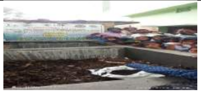
K.C HIGH SCHOOL CO EDN, UTTARBAHINI