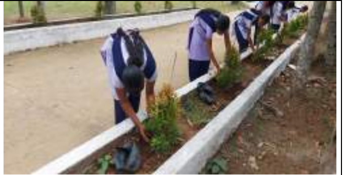
JAWAHAR NODAL H/S