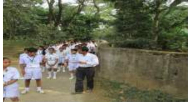
SRI AUROBINDINDO INTEGRAL EDUCATION CENTRE, TAHARPUR