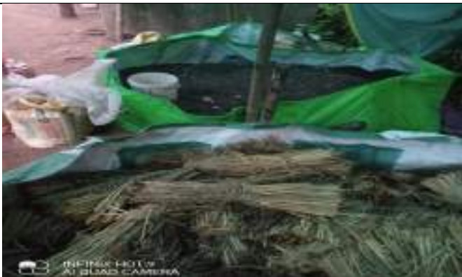
DAHAMUNDA GOVT HIGH SCHOOL