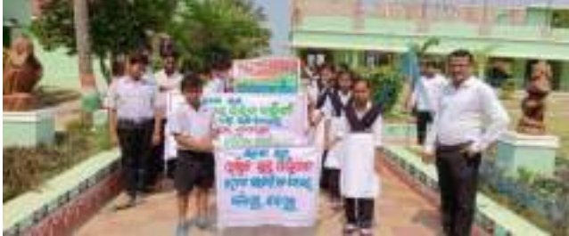
MAHATAB GOVT HIGH SCHOOL, MANGALPUR