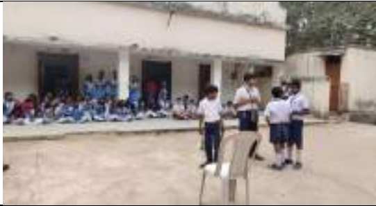
PANCHAYAT HIGH SCHOOL, EKMA