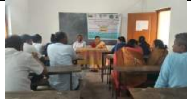
SARADA PRASAD UCHHA BALIKA BIDYAPITHA