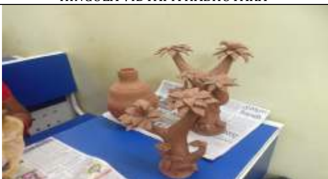
GOVT GIRL HIGH SCHOOL JAJPUR