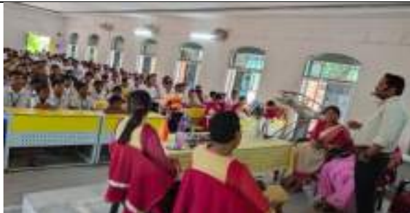
RDD GOVT. HIGH SCHOOL, BONAIGARH