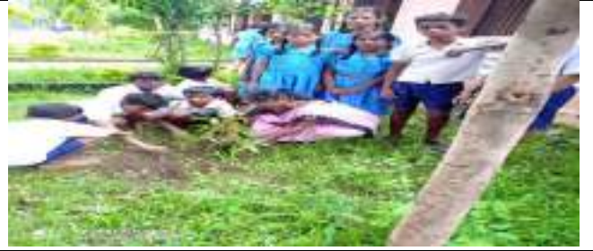
KAMAL PUR GUPS