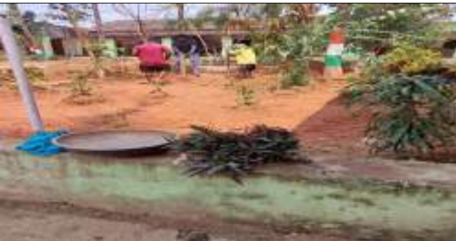
KUSPANGI HIGH SCHOOL