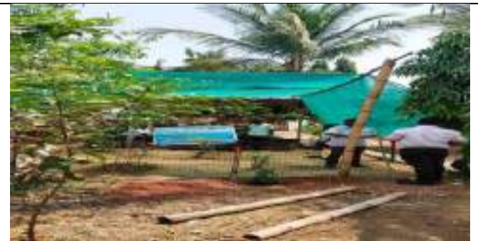
KUSPANGI HIGH SCHOOL