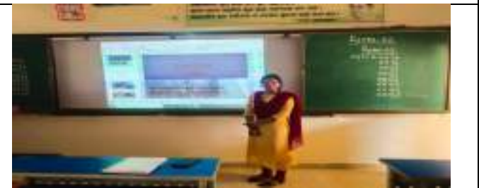
BISHNUPRIYA GOVT. HIGH SCHOOL, KENDUKHUNTA