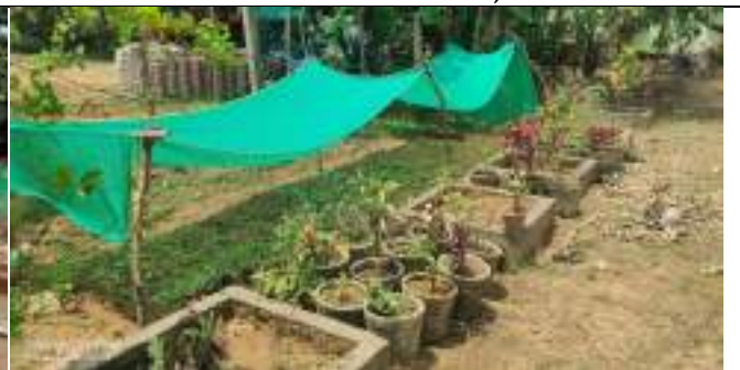
SARANDABIDYAPITHA, SUBARNAPUR, BANKI