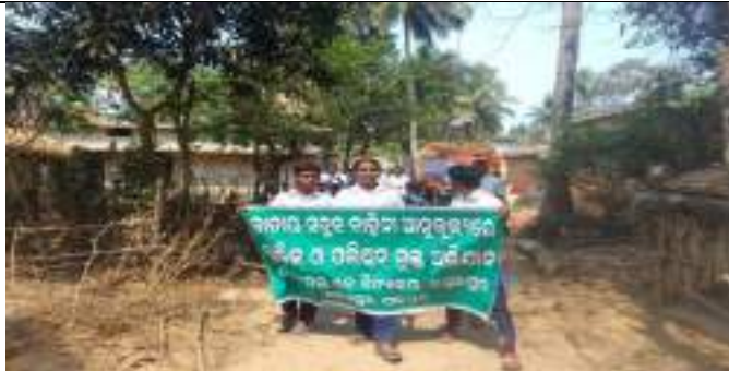
SHYAMSUNDAR GOVT HIGH SCHOOL, ISWARPUR