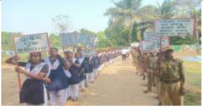
S.S. HIGH SCHOL, BADA CHADHEIAPADH