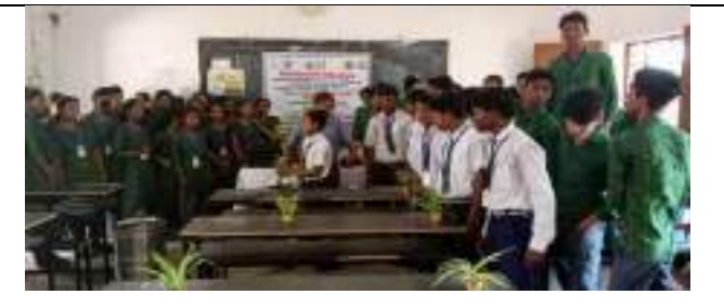
BISWANAHAKANI HIGH SCHOOL, CUTTACK