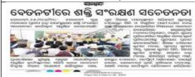
M.P.C. HIGH SCHOOL, BETNOTI