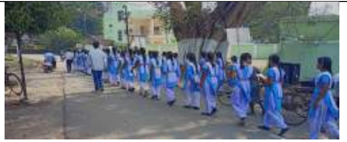
RARUAN NEW GOVT HIGH SCHOOL