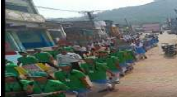
TURUBUDI HIGH SCHOOL, TURUBUDI