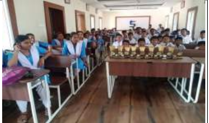
NATIONAL HIGH SCHOOL, DURA