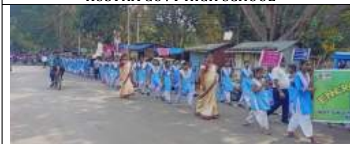
GOVT GIRL HIGH SCHOOL, KARANJIA