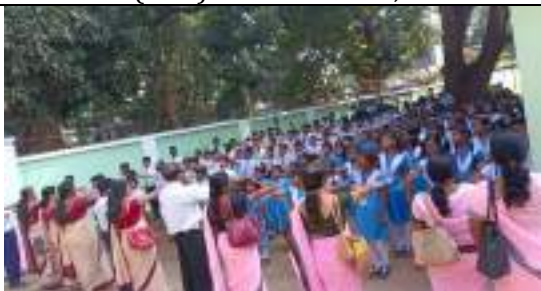
NEW ORISSA HIGH SCHOOL, GAIBIRA