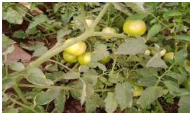
GOVT HIGH SCHOOL , JAGANATH PRASAD, ANDHARUA