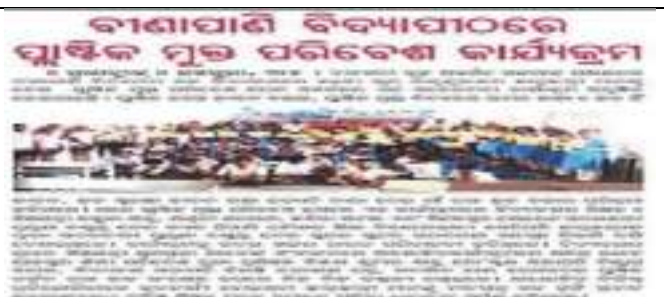
BINAPANI GOVT HIGH SCHOOL, NILAMANIDEIPUR