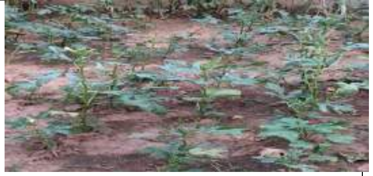
PATITAPABAN GOVT. HIGH SCHOOL GAMBHARIMUNDA