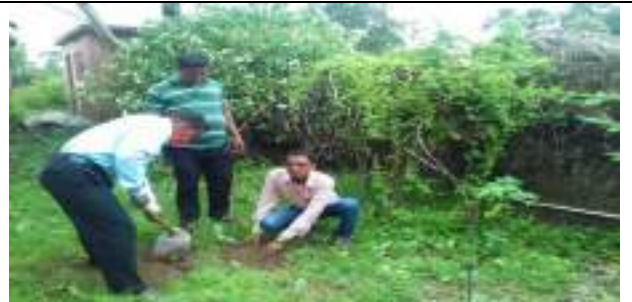
GOVT (N) PANABEDA HIGH SCHOOL, CHANDAHANDI