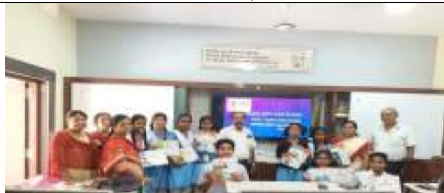
BRUNDABANGOVTH HIGH SCHOOL, HINJILICUT