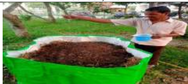
GOVT. HIGH SCHOOL, AVANA