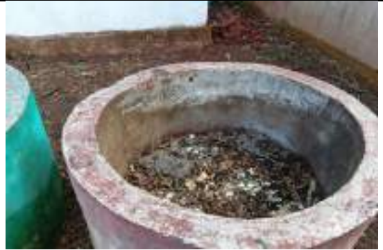
ISWARPUR HIGH SCHOOL