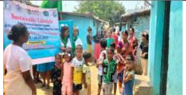
ST. MARY'S GIRLS HIGH SCHOOL, RAJGANGPUR