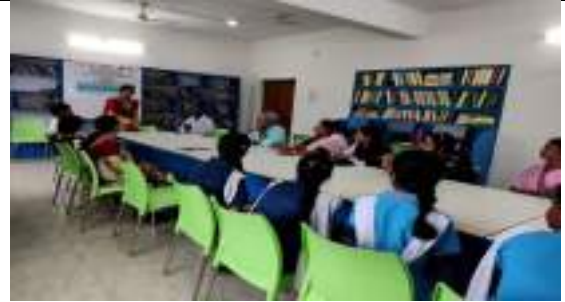
SASANBAD UP GRADED HIGH SCHOOL, MANGALPUR