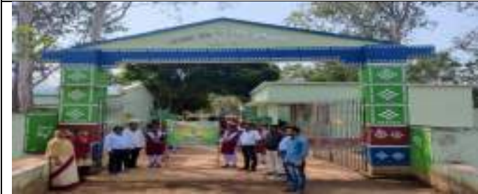
GOVT HIGH SCHOOL SULIAPADA