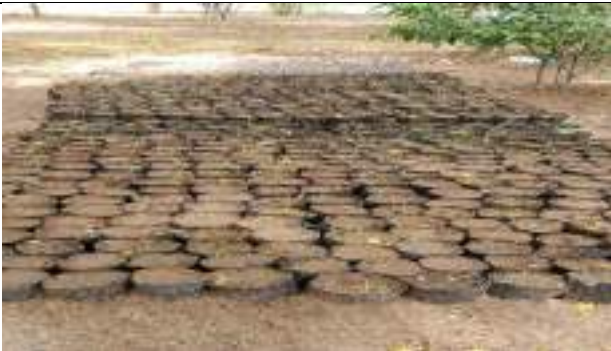
RADHAKRUSHNA UCHHA BIDYAPITHA SUNDHIPADAR