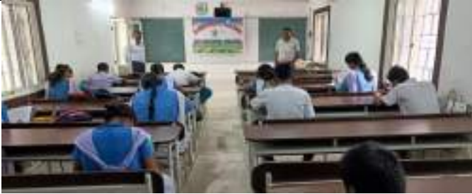
GOVT HIGH SCHOOL, DHANGHERA