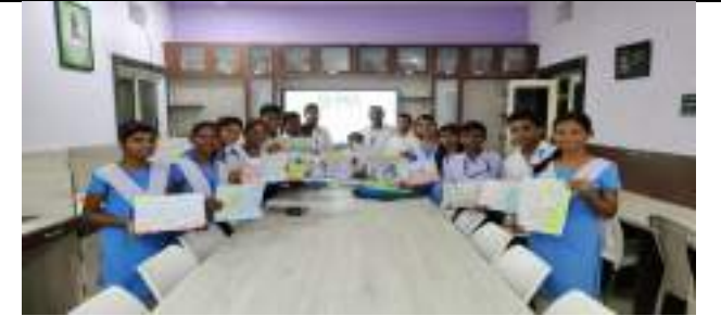
TPS GOVT. HIGHSCHOOL, BANDHAPALI