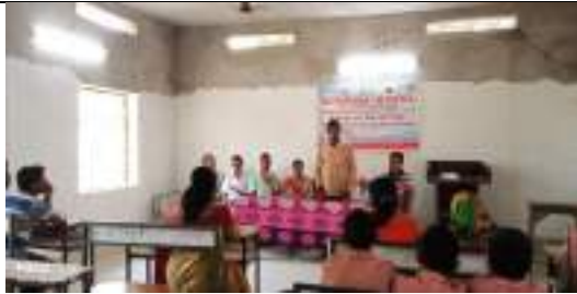
KRUPASINDHU GOVT HIGH SCHOOL ADALPANK