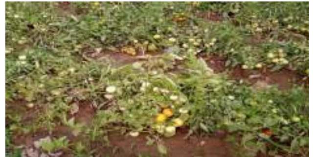
LINGARAJ HIGH SCHOOL, DANGARPADA