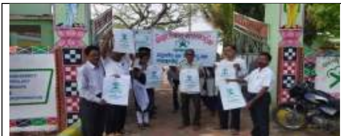
MAHABEER HIGH SCHOOL, DALA, BYASANAGAR