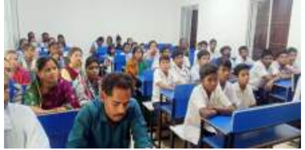
DINABANDHU GOVT. HIGH SCHOOL, BERHAMPUR