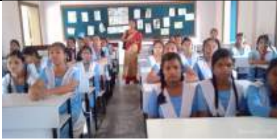
RAJKABI RADHAMOHAN BIDYAPITHA