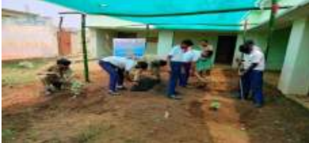
GODISAHI GOVT. HIGH SCHOOL