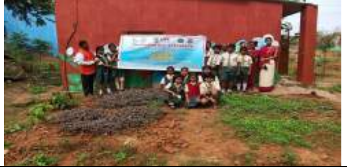
PRATAP SASAN GOVT HIGH SCHOOL, BALAKATI