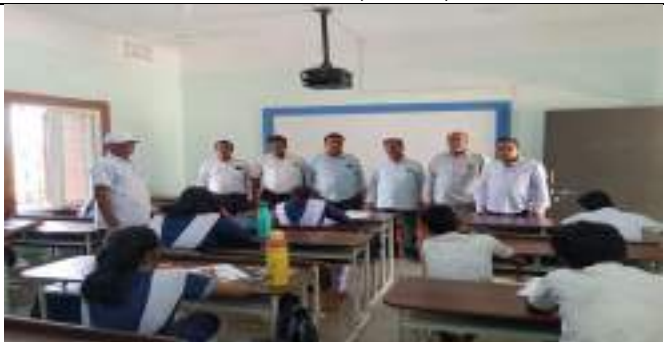
RAGHUNATH HIGH SCHOOL