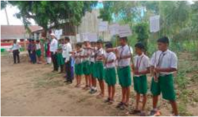
SIR AURONINDO PURNANGA SIKSHYA KENDRA