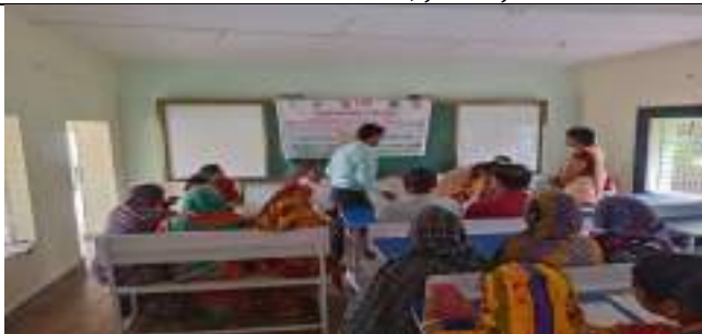
SIMANTA SHIKSHYA NIKETAN BALASORE