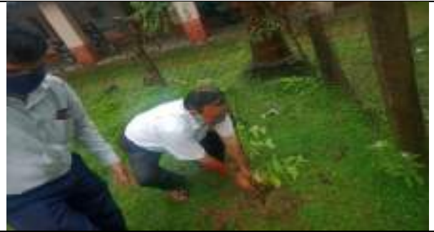
GOVT U.P SCHOOL, AMTHAPADA