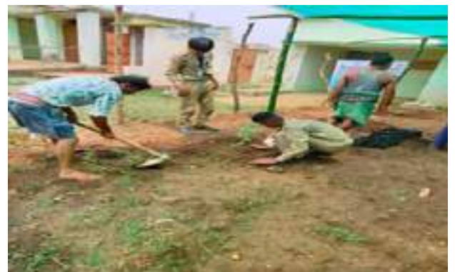
GOVT. HIGH SCHOOL, NURTANG