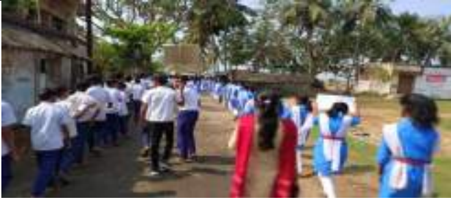
GANESWARPUR PROJECT UP SCHOOL