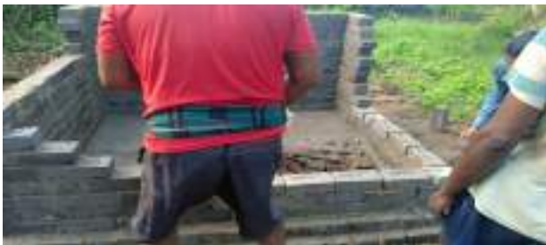
KIRTTI CHANDRA GOVT HIGH SCHOOL, NARAYANPUR