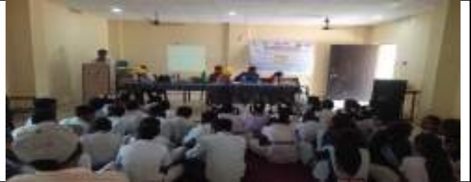
PURKAPALI PANCHAYAT HIGH SCHOOL BIRTOLA