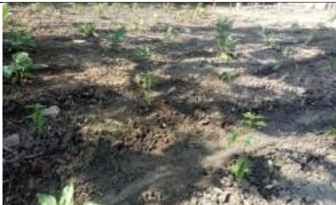
BANADURGA HIGH SCHOOL, DEOBANDHA