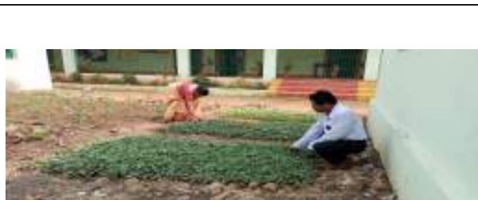
GOVT .HIGH SCHOOL, KUSHAMATI, CHHANAGHARA