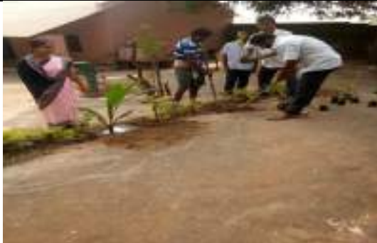
SANGRAMPUR H.S, SAHAJPAL