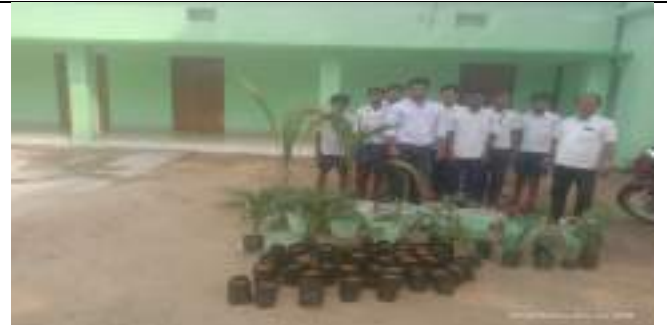
GOVT UGHS BADAKAMBILO (1)