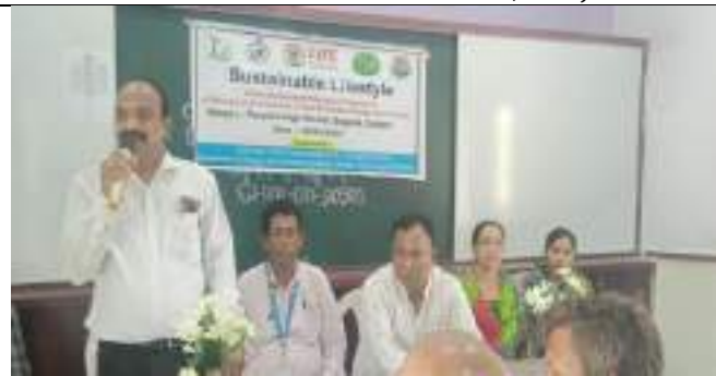
PEOPLE'S HIGH SCHOOL, BAGUDA