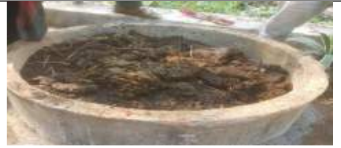
J.K.K.S. GOVT HIGH SCHOOL PADMAPUR