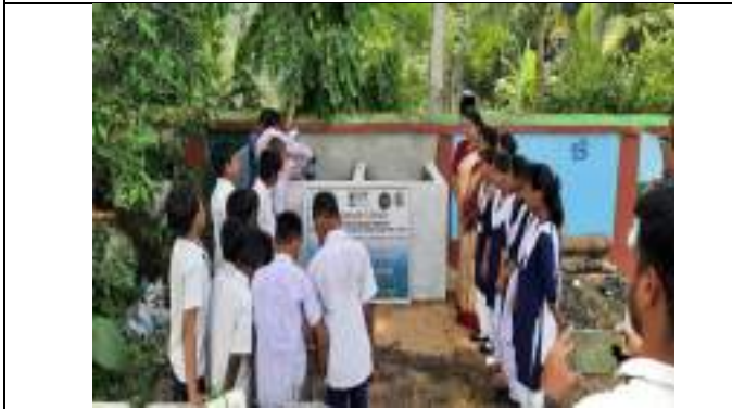
BAPUJI NODAL HIGH SCHOOL