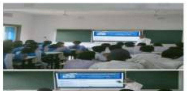
GOVT. HIGH SCHOOL, KALUNGA