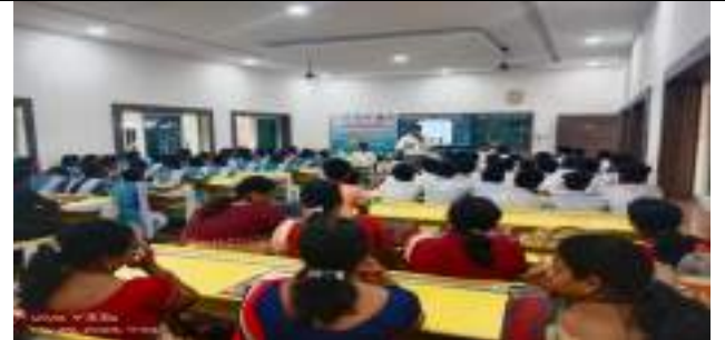
NAC.GOV'T. COE HIGH SCHOOL, SEC-6, ROURKELA