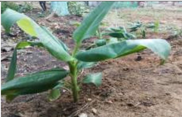
PATITAPABAN GOVT. HIGH SCHOOL, GUDUM, KHORDHA