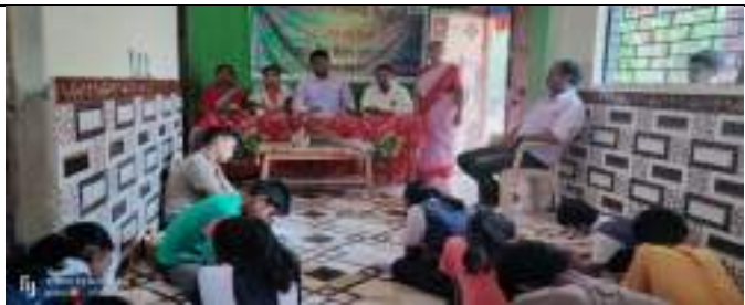
SARASWATISISHU VIDYAMANDIR, DASARATHAPUR