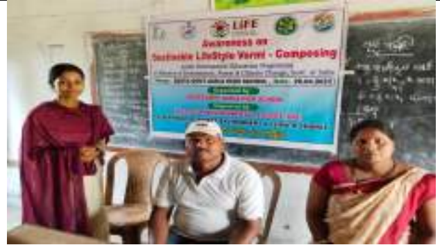
BASTA GIRLS' HIGH SCHOOL, BASTA