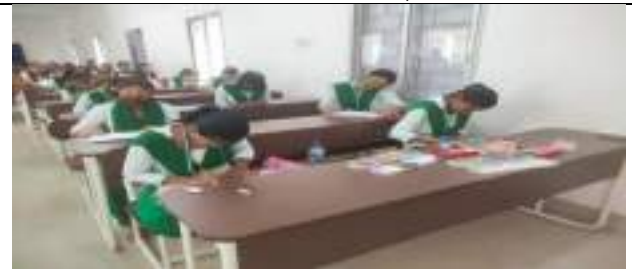
GOVT. HIGH SCHOOL BIRINGATOLI