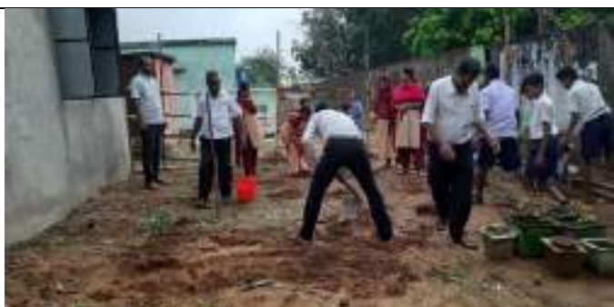
G.P HIGH SCHOOL, RATAPAT