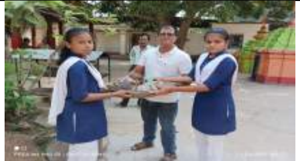
RAJKABI RADHAMOHAN BIDYAPITHA