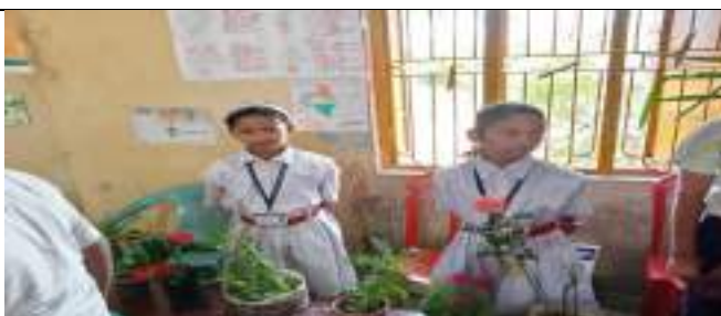
REBADEBI SOVANIYA SIKHYASHRAM, SOVANIYA NAGAR, ABHINAB BIDANASI