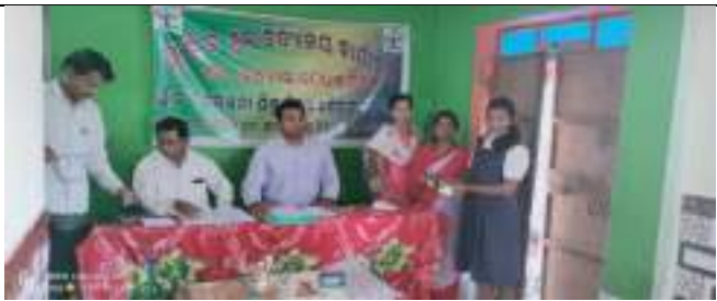
SARASWATISISHU VIDYAMANDIR, DASARATHAPUR