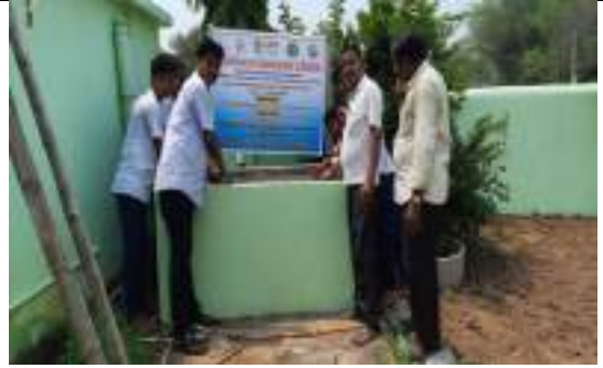
MADHABANANDA SIKSHYA NIKETAN MAHULIA