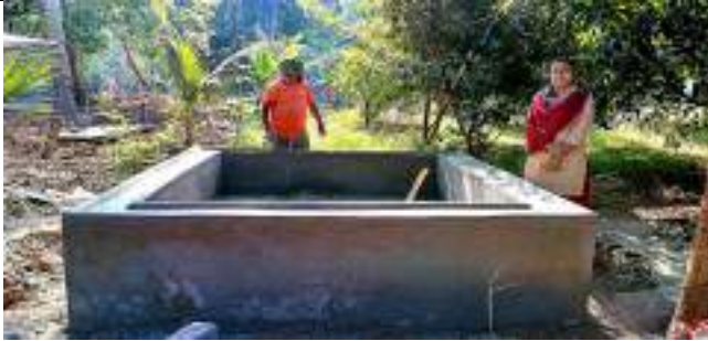
ANCHALIKA GOVT. HIGH SCHOOL SAUN