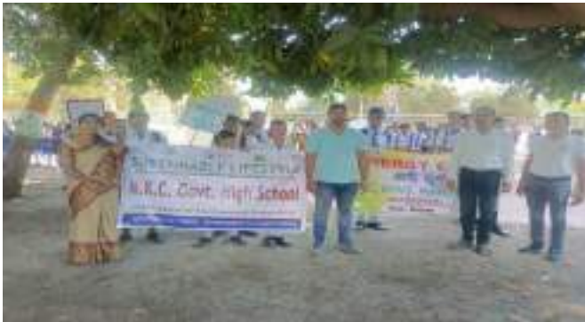
M.K.C GOVT HIGH SCHOOL, BARIPADA