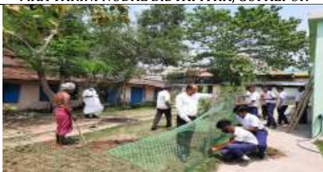
NUABAZAR HIGH SCHOOL, NAYABAZAR, CUTTACK