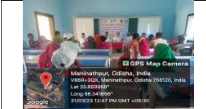
SDJ HIGH SCHOOL