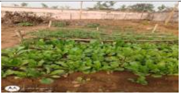
GOVT. UGHS SV VIDYAMANDIR