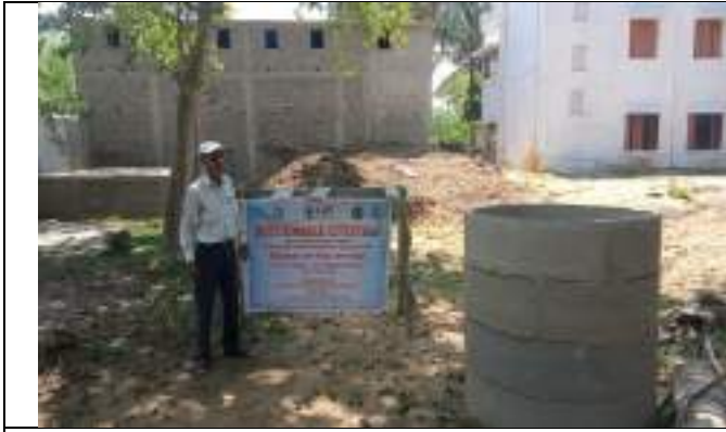
SAHASPUR UCHHA BIDYAPITHA