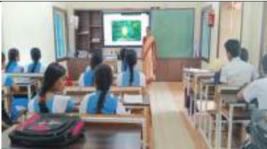
GOVT. HIGH SCHOOL, BARGAON