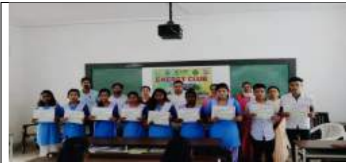
GOVT HIGH SCHOOL, RANGAMATIA