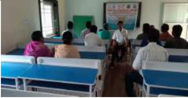
MADHABANANDA SIKSHYA NIKETAN MAHULIA