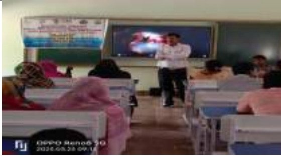
RAGHUNATH NODAL ACADEMY, SARASWATIPUR