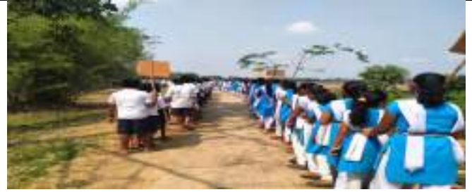
S.B. HIGH SCHOOL