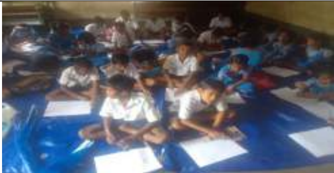
SHYAMSUNDAR GOVT HIGH SCHOOL, ISWARPUR