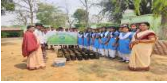
MANAMUNDA GOVT HIGH SCHOOL