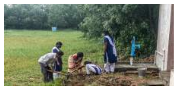
GOVT. UGHS, KUSUMI