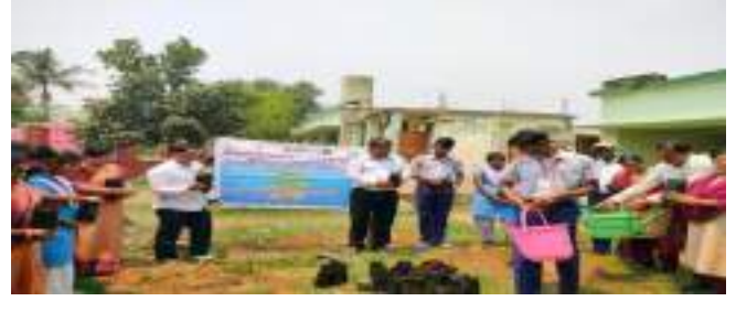
GODISAHI GOVT. HIGH SCHOOL