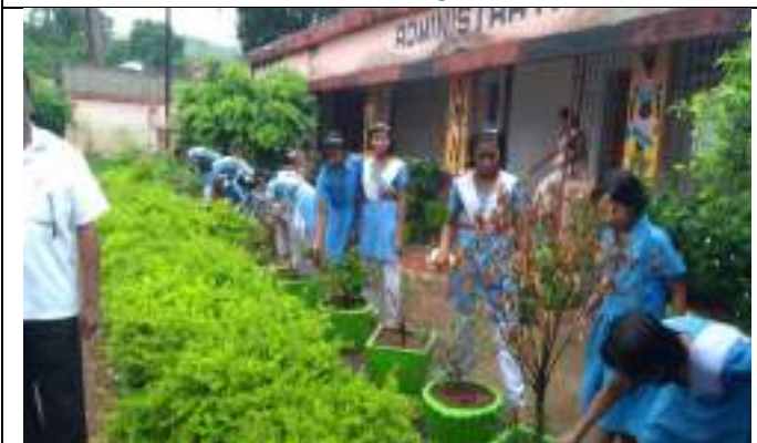
GOVT HIGH SCHOOL, UNIT-2, BBSR