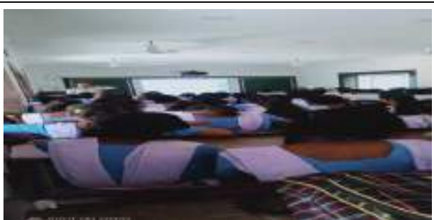
GOVT. GIRLS HIGH SCHOOL, BONAIGARH