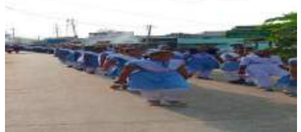
GOVT. GIRL. HIGH. SCHOOL .RAIRANGPUR