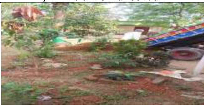
SHREE SINGHANATH DEV BIDYAPITHA