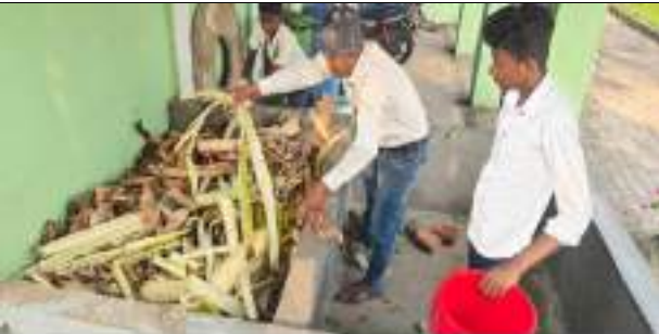
PARKHI REGIONAL HIGH SCHOOL