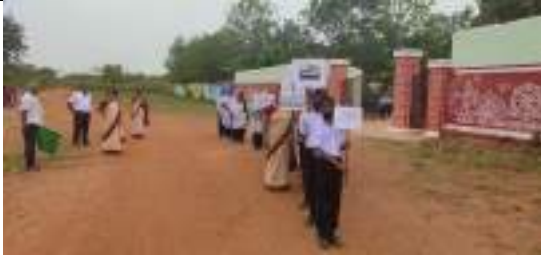
GOVT. HIGHSCHOOL, JARDA