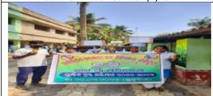
SASHI BHUSANA GOVT HIGH SCHOOL