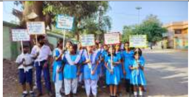
KUARMUNDA HIGH SCHOOL