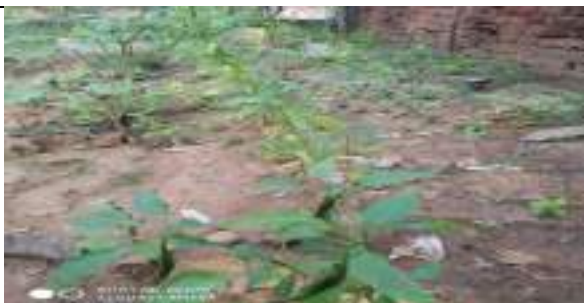
GOVT. UGHS, KUSUMI