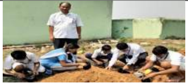
KANTAMAL GOVT HIGH SCHOOL KANTAMAL