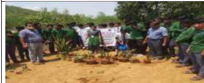
BISWANAHAKANI HIGH SCHOOL, CUTTACK