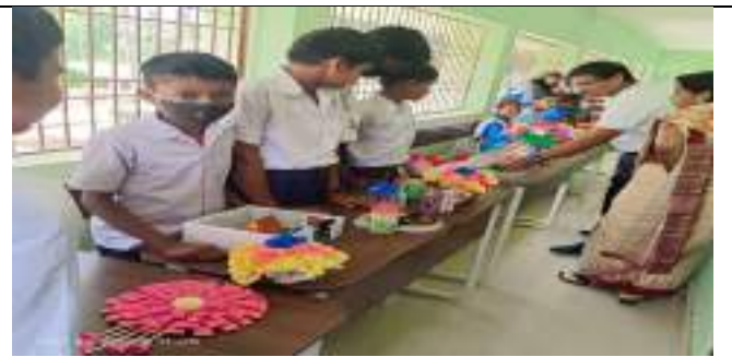
RAMBAG GOVT HIGH SCHOOL, DASARATHAPUR