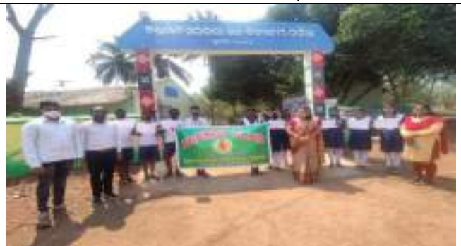
CHINTAMANI GOVT HIGH SCHOOL.