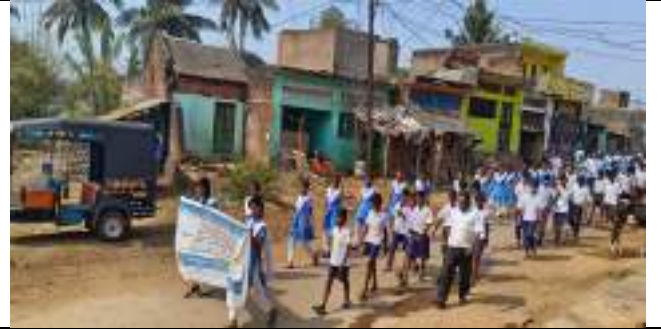
MKD HIGH SCHOOL, GAJALBADI