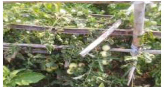
DANDAKARANYA ADARSHA VIDYALAYA