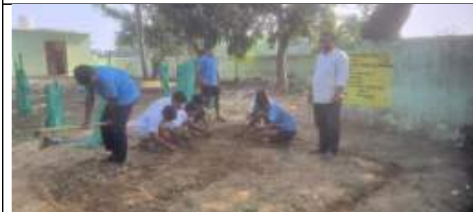
KHANANAGAR NODAL HIGH SCHOOL, CUTTACK