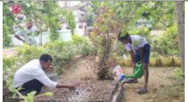
RADHAKRUSHNA UCHHA BIDYAPITHA SUNDHIPADAR