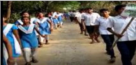
SIMILIPAL NODAL HIGH SCHOOL