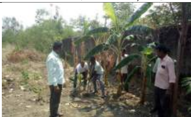
CHATURBHUJ HIGH SCHOOL, SAMPUR