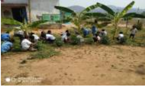
RATA KHANDI GUPS