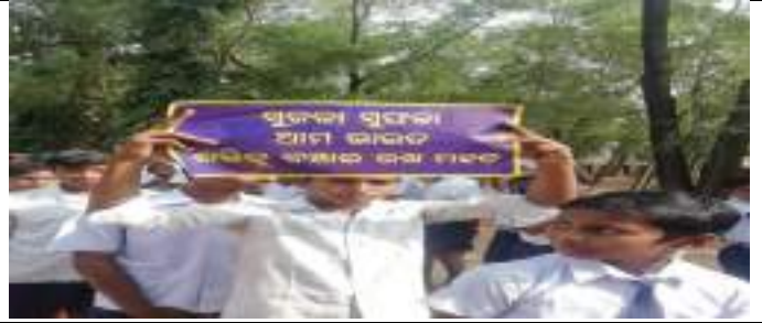
LALBAHADUR NODAL HIGH SCHOOL