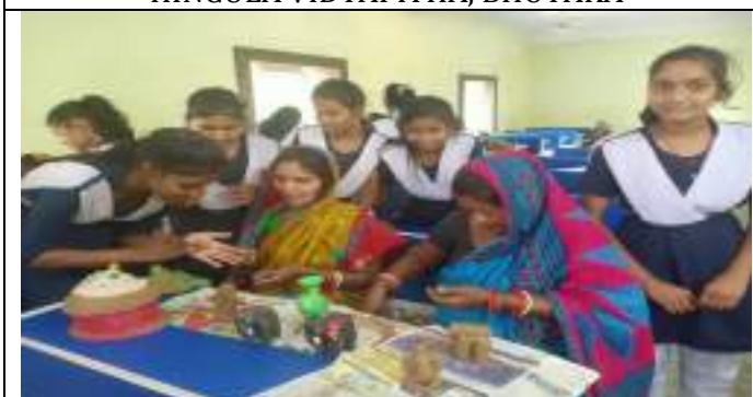
GOVT GIRL HIGH SCHOOL JAJPUR