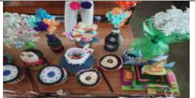
ALLAPUR HIGH SCHOOL