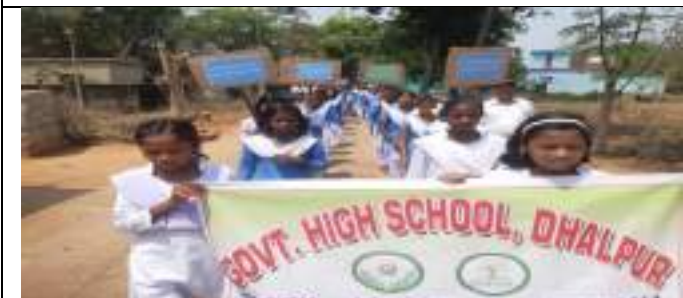
GOVT HIGH SCHOOL DHALPUR