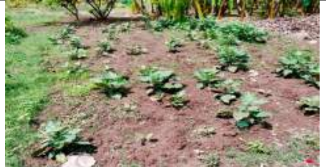
SRI AUROBINDO INTEGRAL EDUCATION CENTRE KHATIGUDA