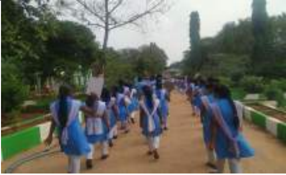
ARYAPALLI HIGH SCHOOL