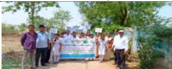
C. S. A. GIRLS HIGH SCHOOL, B. D. PUR