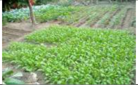
PANCHAYAT HIGH SCHOOL, ADHIKARIGUDA