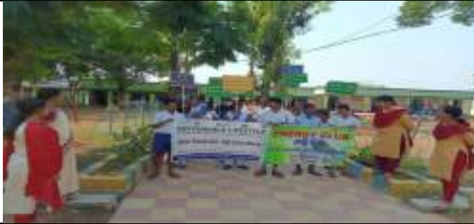
ISWAR CHANDRA GOVT HIGH SCHOOL