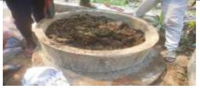
VENKATESWAR SCHOOL, CHANDBALI