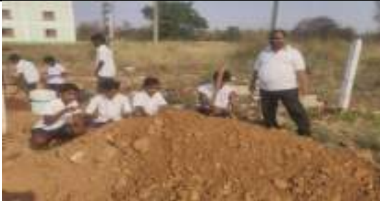
JANATA GOVT HIGH SCHOOL AMBAGAON