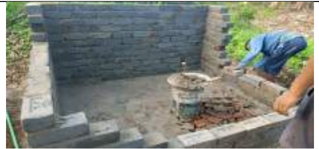
KIRTTI CHANDRA GOVT HIGH SCHOOL, NARAYANPUR