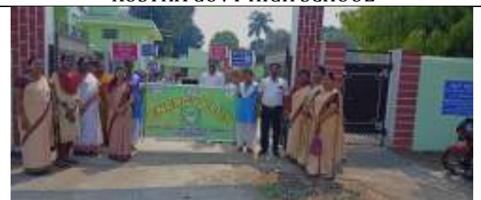
GOVT GIRL HIGH SCHOOL, KARANJIA