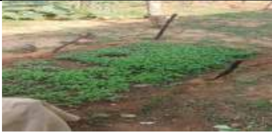
GOVT. UGHS BADAKUMULI