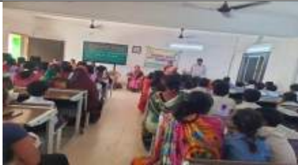
GOVT.GIRLS HS, LEPHRIPARA