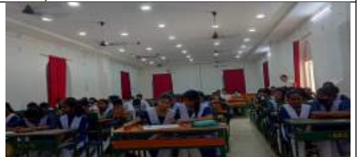
GOVT HIGH SCHOOL, JHARADIHI