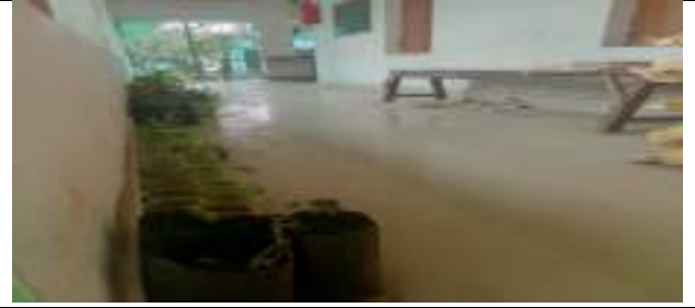
SUBUDHESWAR MILITA BIDYAPITHA, BANRA