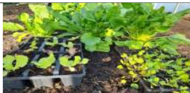
GOVT NODAL HIGH SCHOOL, C.S.PUR