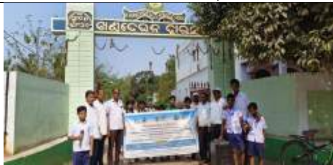
KHANDADEULI HIGH SCHOOL, KHANDADEULI.