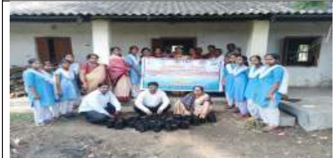
GOVT. GIRLS' HIGH SCHOOL, PALLISAHI, MAHANGA, CUTTACK