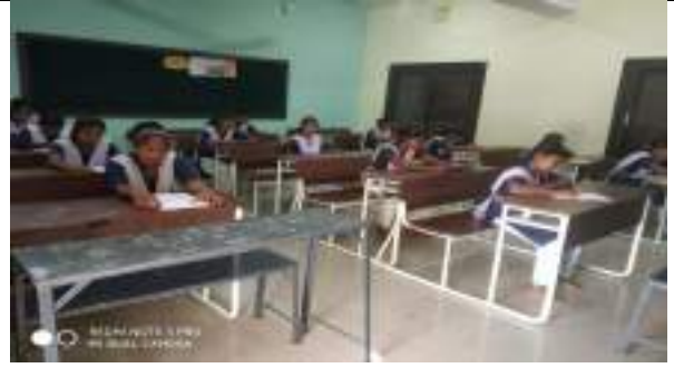
GOVT.GIRL HIGH SCHOOL, BETANOTI