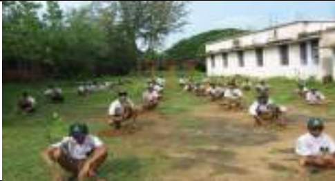
GOVT. U.G.H.S, JAGATI