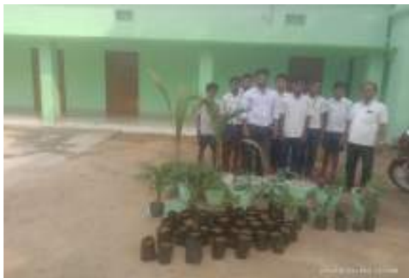
GOVT. HIGH SCHOOL, NURTANG