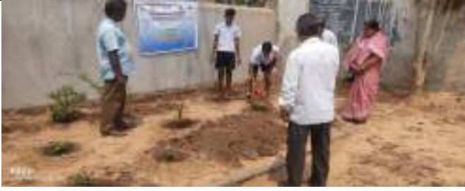
MAHULIABIDYAPITHA. BADAMBA BLOCK