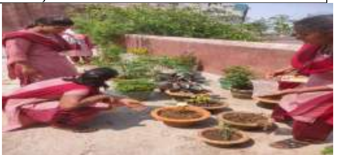
LAKSHESWAR WOMEN'S HIGHER SECONDARY SCHOOL