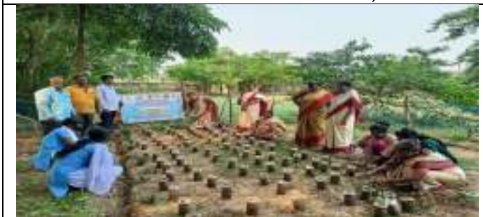
JAYADEV GIRLS HIGH SCHOOL