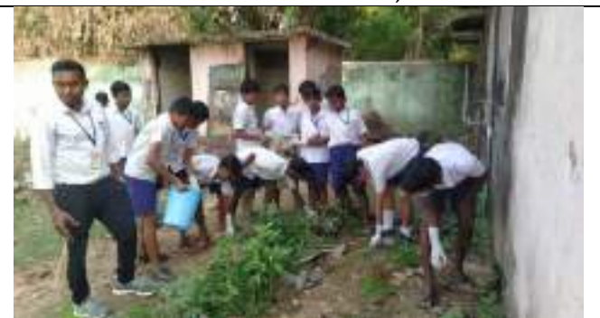
ONSLow GOVT. HIGH SCHOOL