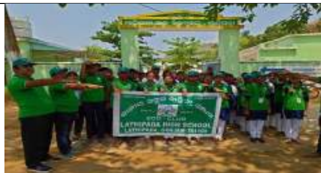
LATHIPADA HIGH SCHOOL, GANJAM