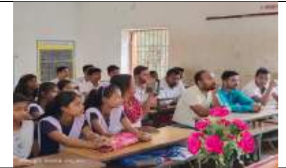
N.P GOVT. HIGH SCHOOL, NANDOR