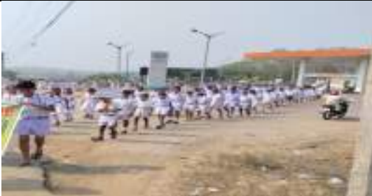
GOGUA HIGH SCHOOL, BARGOGUA