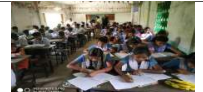
BANEIKALAGOVTHIGH SCHOOL, BANEIKALA