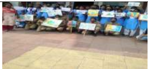
PADMANAVPUR NODAL HIGH SCHOOL, DIGAPAHANDI