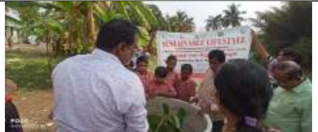
KRUPASINDHU GOVT HIGH SCHOOL ADALPANK