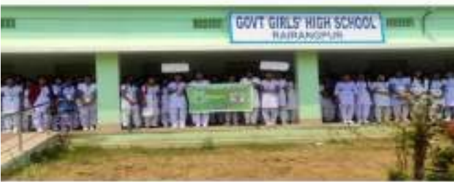
GOVT. GIRL. HIGH. SCHOOL .RAIRANGPUR