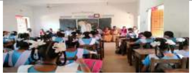
GARJAN BAHAL HIGHSCHOOL