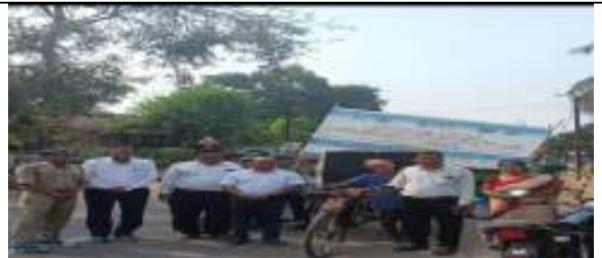
BHUTA SARSINGI HIGH SCHOOL