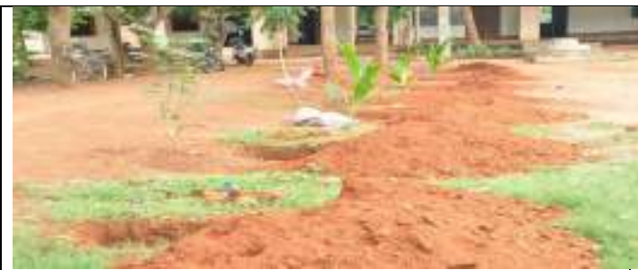
GOVT. HIGH SCHOOL, CHHATRAPADA