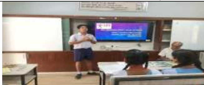
BRUNDABANGOVTH HIGH SCHOOL, HINJILICUT