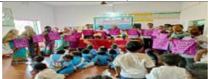
MAABUDHIJAGULAI U.P(ME) SCHOOL, RASUNA