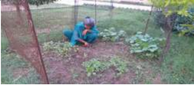
BALUNKESWAR NODAL BIDYAPITHA, DEULI