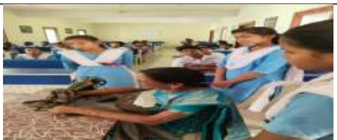
ISHANESWAR HIGH SCHOOL, RAJENDRAPUR, JAJPUR