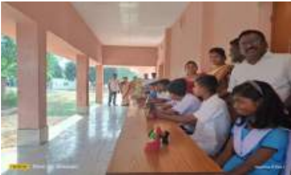
DANDAPANI SAMANTARAY HIGH SCHOOL