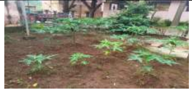
NODAL GOVT.PS HS, TARAGAM