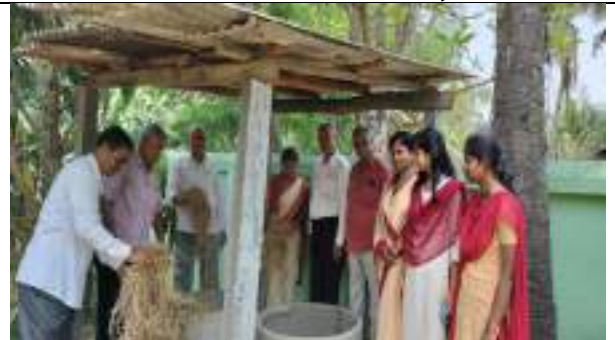
M.B. HIGH SCHOOL, GOPALPUR