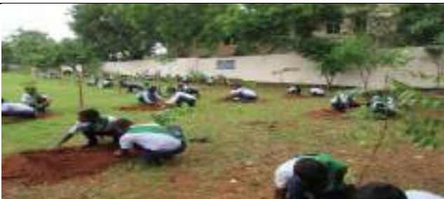
CAPITAL HIGH SCHOOL, UNIT-II, BHUBANESWAR