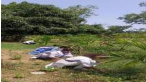
KABI SAMRAT BIDYAPITHA, KULLADA