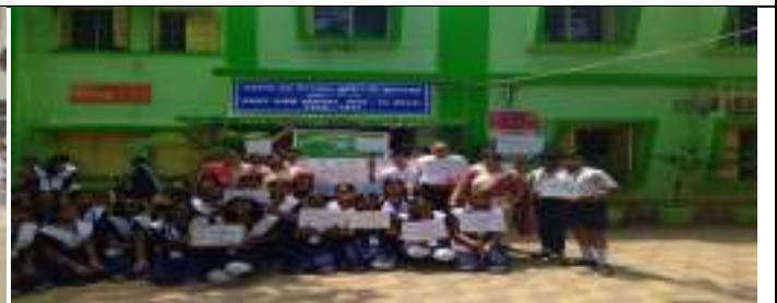
GOVT HIGH SCHOOL, UNIT-6, BHUBANESWAR