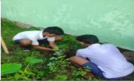
GOVT. UPS ANCHALA