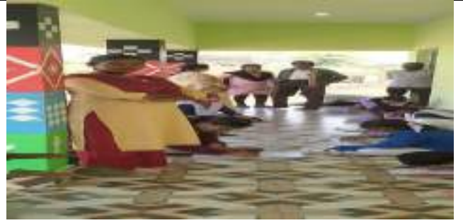
GOPABANDHU GOVT HIGH SCHOOL