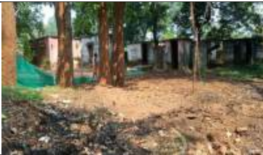
GOVT. ME SCHOOL, DABUGAM