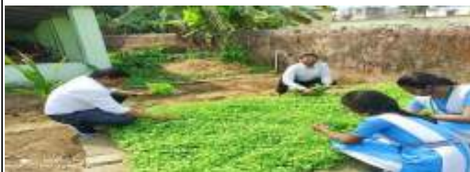
BANAMBARGOVT HIGH SCHOOL, BHIMPUR