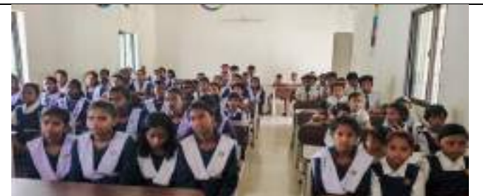
BHAGABATCHANDRAPUR GOVT HIGH SCHOOL, ORACHANDABILLA