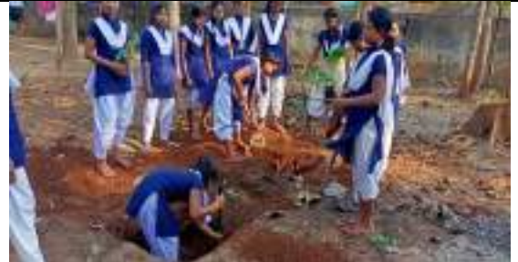
R.D.R GIRLS HS PALASGAON. JHARIGAM