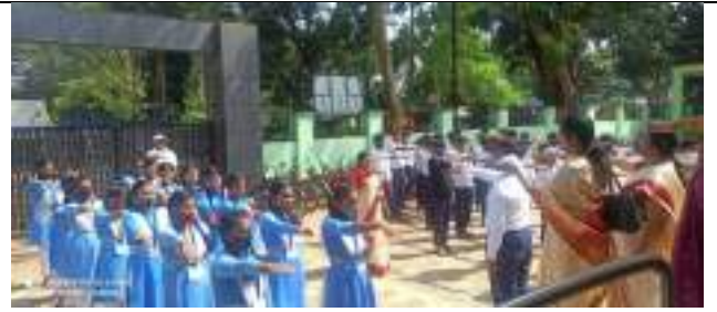
PANCHAYAT HIGH SCHOOL, EKMA