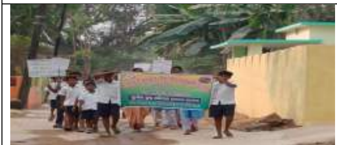
BINAPANI GOVT HIGH SCHOOL, NILAMANIDEIPUR