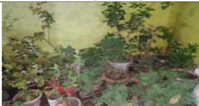
NILAKANTHAGOV.T.HIGH SCHOOL, NANPUT