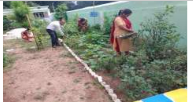
GOVT. U.G HIGH SCHOOL, MAJHIDHANUA