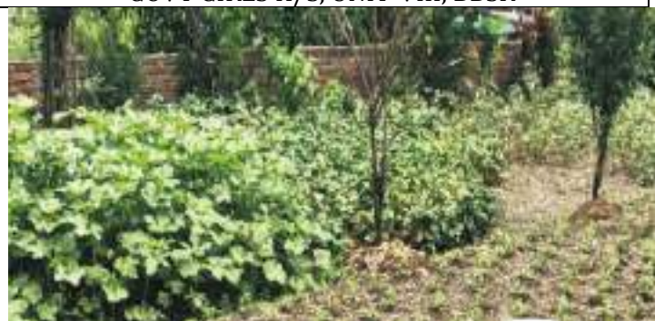
BALARAMDEV BIDYAPITHA, TANGI