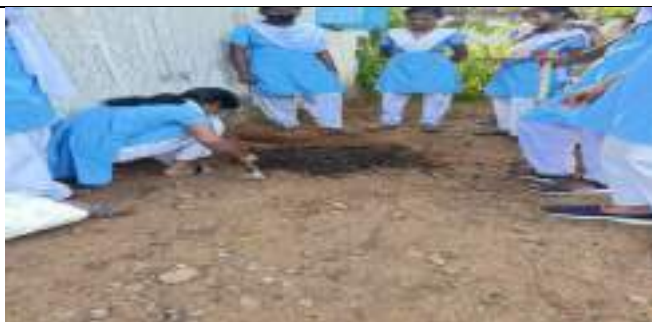
GOVT. GIRLS HIGH SCHOOL, ATHGARH, CUTTACK