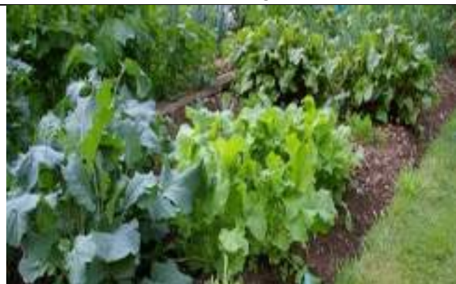
GOVT HIGH SCHOOL, UNIT-2, BBSR