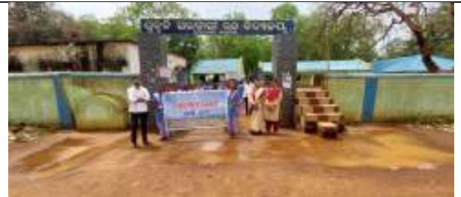
SUKRULI GOVT HIGH SCHOOL