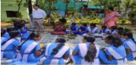
SPA GIRLS HIGHSCHHOL, BANOKOI