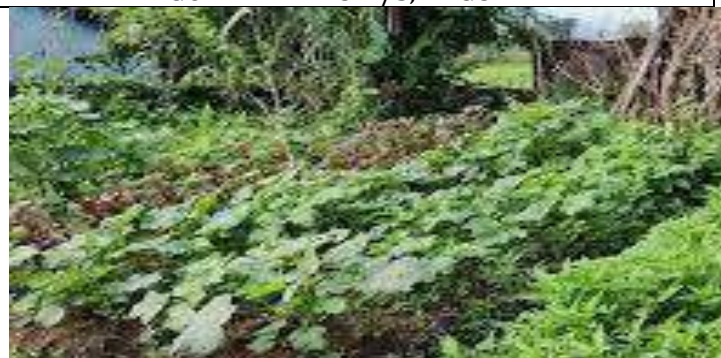
GOVT GIRLS H/S, UNIT-VIII, BBSR