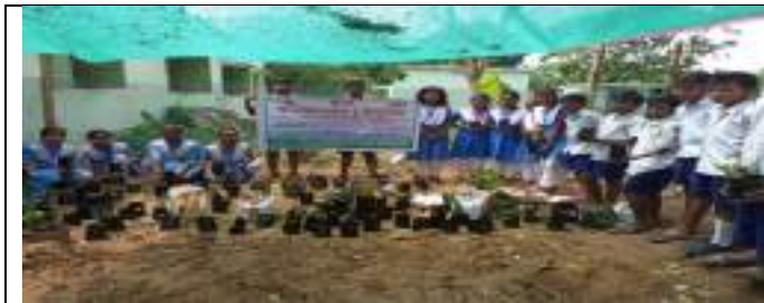
CRR GOVT HIGH SCHOOL, CUTTACK 6