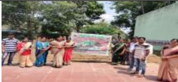
GOVT. GIRLS HIGH SCHOOL UMERKOTE