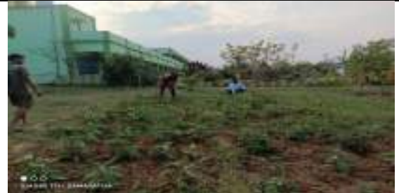
GOVT UGHS BHANDARIGUDA