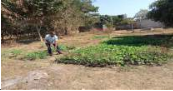
GOVT. UPPER PRIMARY SCHOOL, DENGAGUDA