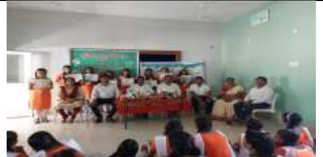
ARYA. KANYA. GURUKUL, TANARADA