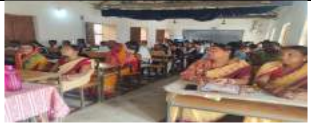
GOVT. U.G.H.S, JAGATI