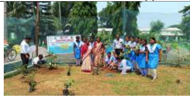
JHADESWARPUR GOVT. HIGH SCHOOL