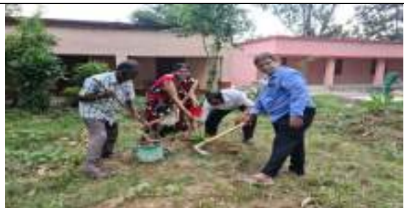
GOVT. (SSD) GIRLS HIGH SCHOOL, DABUGAM