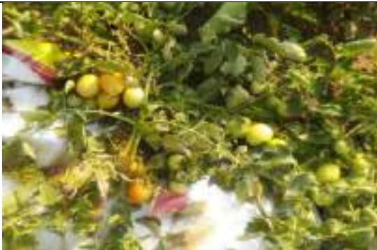
DANDAKARANYA ADARSHA VIDYALAYA