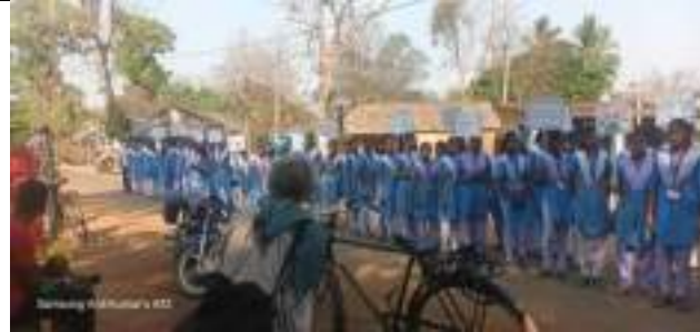
GOVT. HIGH SCHOOL, BALISANKARA