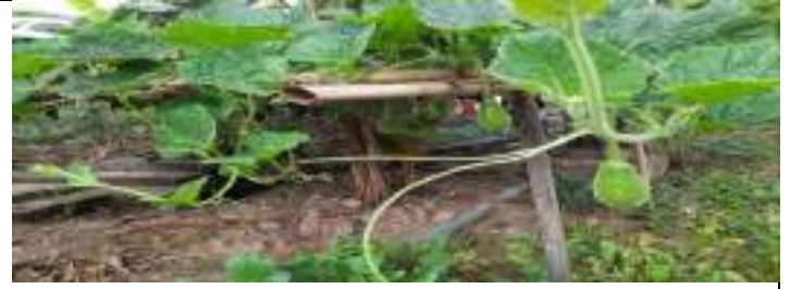
LABANGIRI GOVT. HIGH SCHOOL, JAMUKOLI