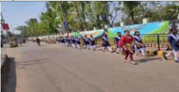
GOVT HIGH SCHOOL, JHARADIHI