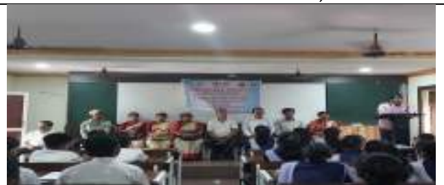
MURALIDHAR HIGH SCHOOL, DHUSURI