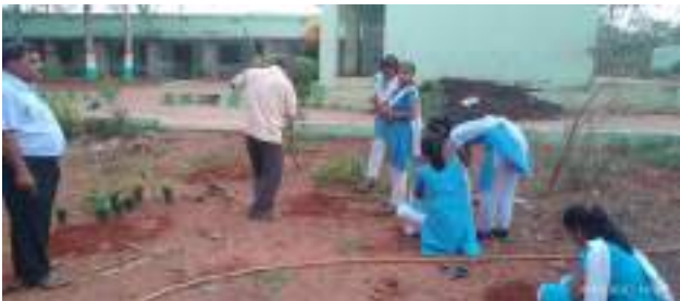
LALBAHADUR GOVT HIGH SCHOOL, PHULNAKHARA