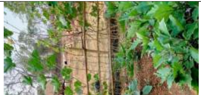
S.M.ALIGOVT.HIGH SCHOOL, JADUPUR, DUMUDUMA