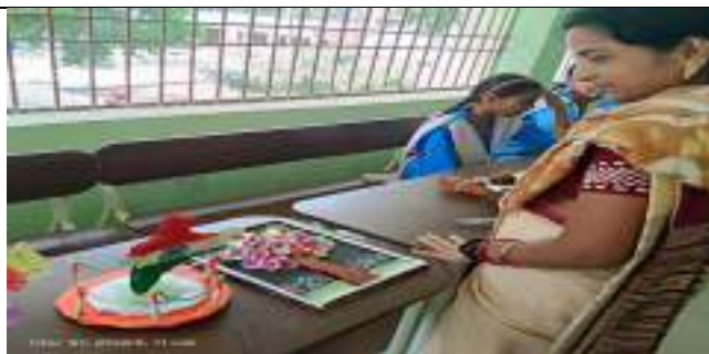
SAHID GIRLS HIGH SCHOOL, KALAMATIA