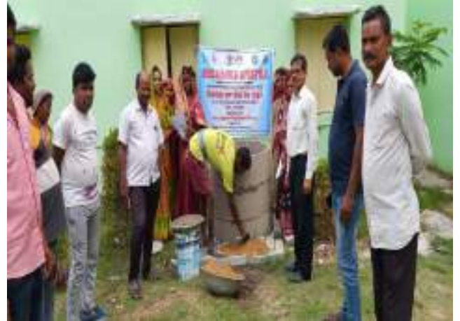
GOVT. UG HIGH SCHOOL, MAHURA