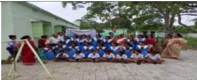
CRR GOVT HIGH SCHOOL, CUTTACK 6