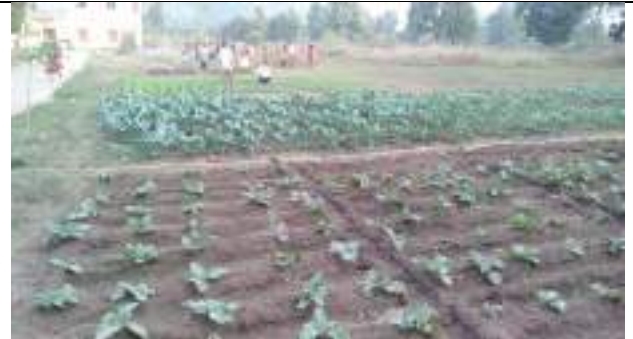
GOVT SSD GIRLS HIGH SCHOOL DALABEDA