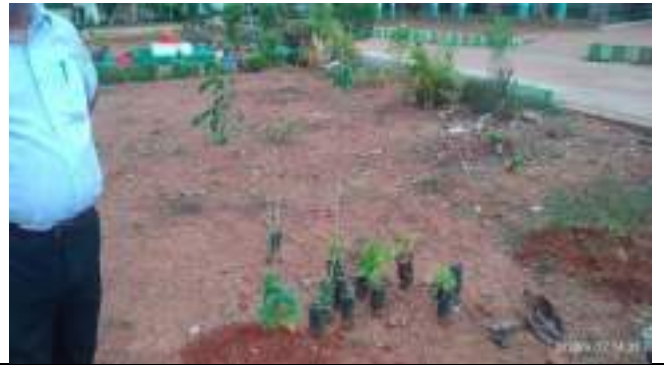
SAKUNTALA DEVI GOVT. HIGH SCHOOL