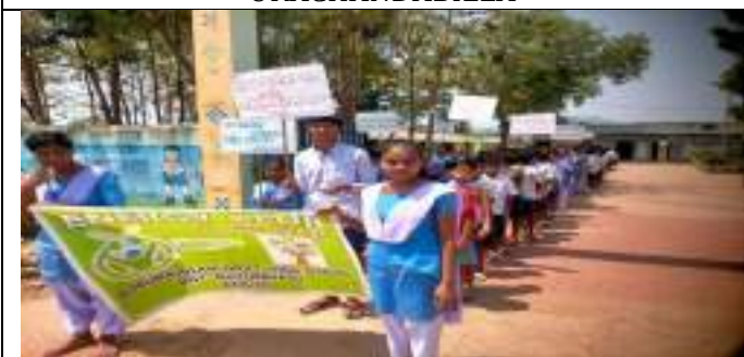
GORUMAHISANI GOVT.HIGH SCHOOL