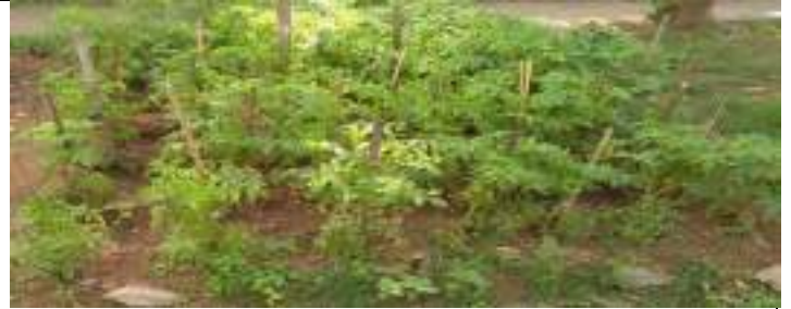
MAHARANA BIRABARA GOVT H/S, CHANDAKA