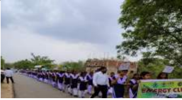
TIRINGI GOVT HIGH SCHOOL