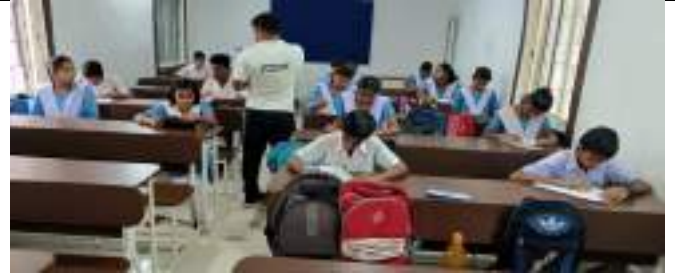
GOVT HIGH SCHOOL, DHANGHERA