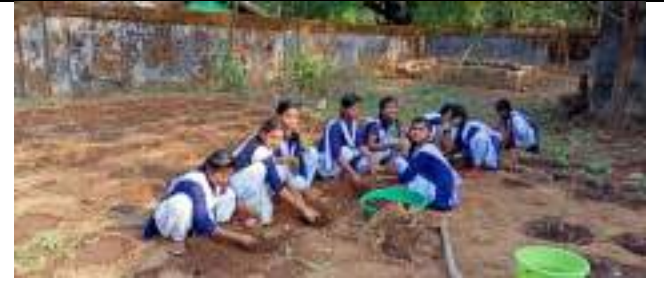
R.D.R GIRLS HS PALASGAON. JHARIGAM