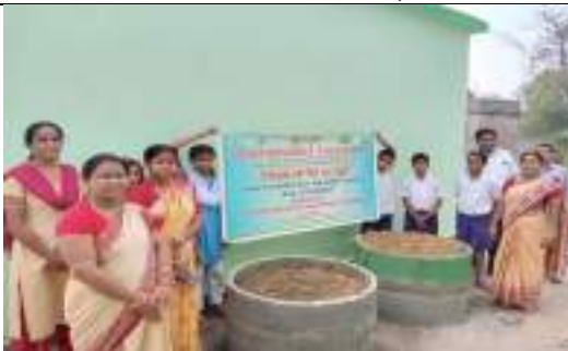
PURUSOTTAM GOVERNMENT HIGH SCHOOL SARAMARA