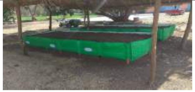
RN ACADEMY, SARASWATIPUR