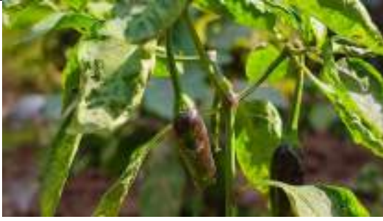
PANCHAYAT HIGH SCHOOL, ADHIKARIGUDA