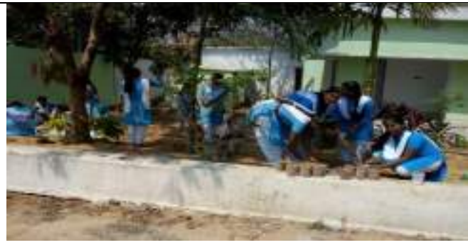
SACHALA DEVI GIRL'S HIGH SCHOOL, BRAHMAPURA