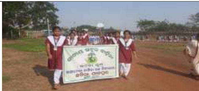
SASHIDEVI GIRLS HIGH SCHOOL, CHHATIA , JAJPUR .