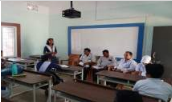
RAJAPUR HIGH SCHOOL