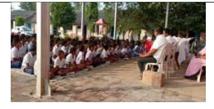
KOSTHA GOVT HIGH SCHOOL