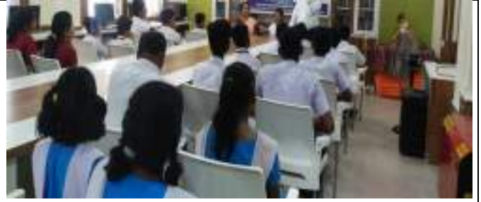
HATIOTA NODAL HIGH SCHOOL