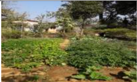
GOVT. UGHS, BORIGAM