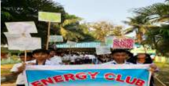
LALBAHADUR NODAL HIGH SCHOOL