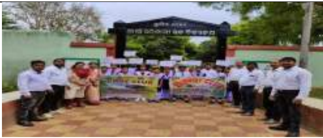
SHIRSA GOVT HIGH SCHOOL