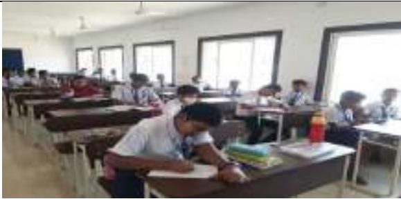
GOVT HIGH SCHOOL, BADAMTALIA