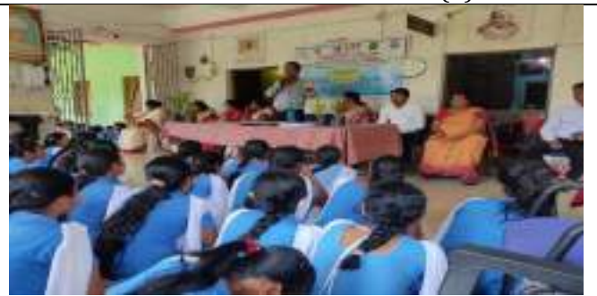
JHADESWARPUR GOVT. HIGH SCHOOL