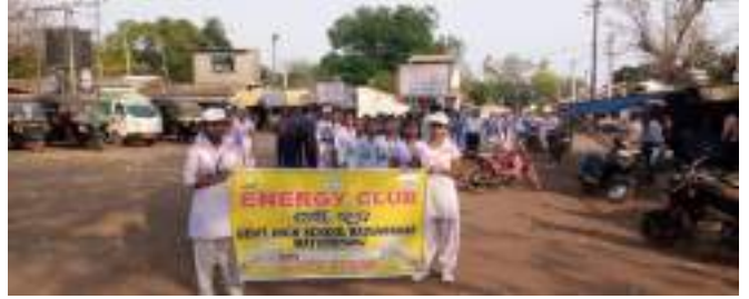
GOVT HIGH SCHOOL BADAMPAHAR