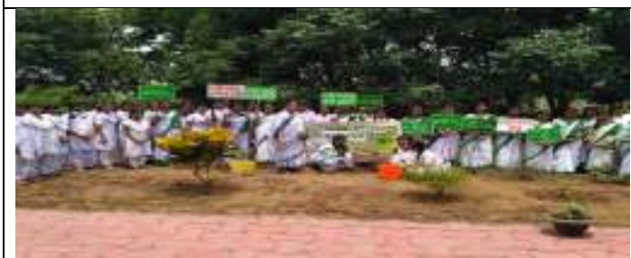
REBADEBI SOVANIYA SIKHYASHRAM, SOVANIYA NAGAR, ABHINAB BIDANASI