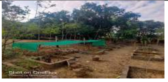
GOVT. GIRLS' HIGH SCHOOL, PALLISAHI, MAHANGA, CUTTACK