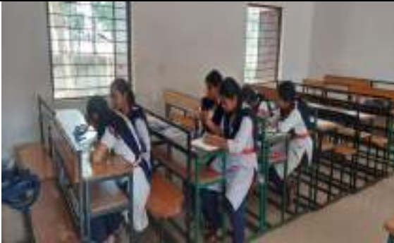
JAWAHAR NODAL H/S