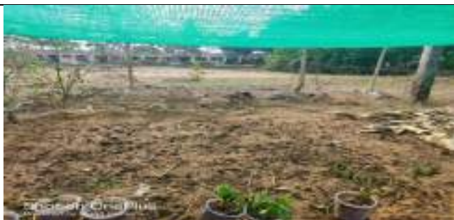
RAVENSHAW COLLEGIATE SCHOOL, CUTTACK