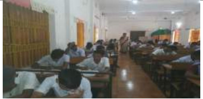
GOVT HIGH SCHOOL BADASAH