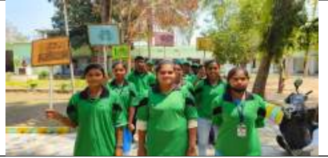
TURUBUDI HIGH SCHOOL, TURUBUDI