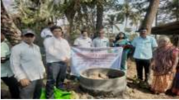
UPENDRANATH BIDYAPITHA SAHADA