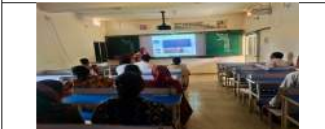
BISHNUPRIYA GOVT. HIGH SCHOOL, KENDUKHUNTA