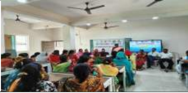
MUNICIPAL GANDHI GOVT HIGH SCHOOL RAJGANGPUR