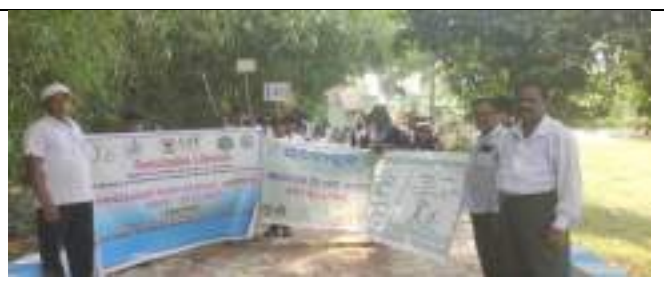
PANCHAYAT HIGH SCHOOL, RAMPUR