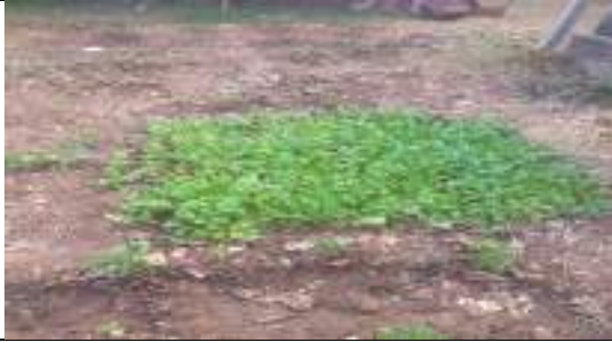
GOVT.HIGH SCHOOL KUNDEI