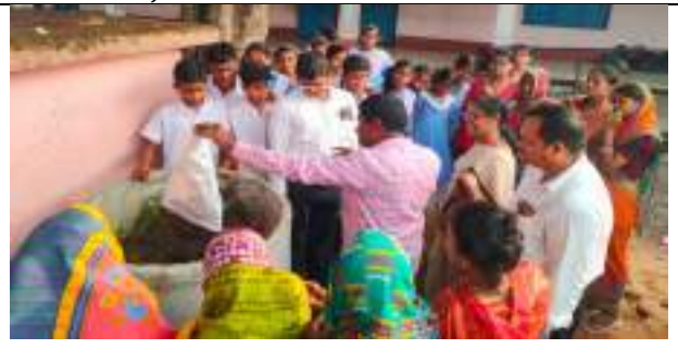
BRAHMAPUR NODAL HIGH SCHOOL, ICHHAPUR