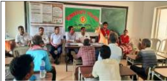
BAHALDA HIGH SCHOOL, BAHALDA