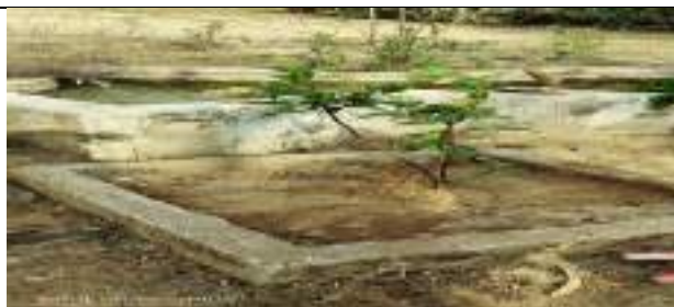
BARENDRA KRUSHNA BIDYAPITHA, BANKI