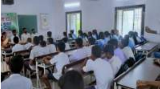
GOVT. JANATA HIGH SCHOOL, BANKI