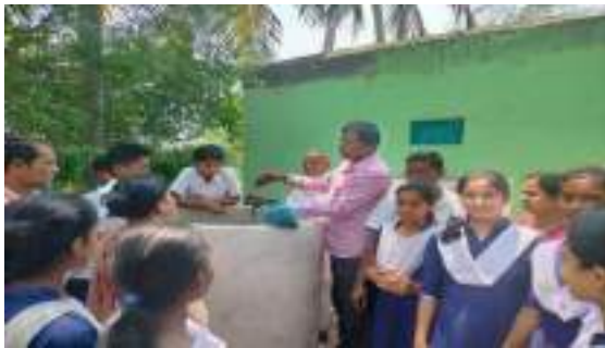
DC HIGH SCHOOL ORASAH