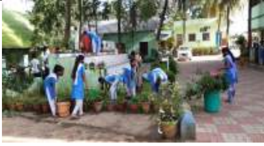
RCD NODAL GOVT HIGH SCHOOL NABARANGPUR