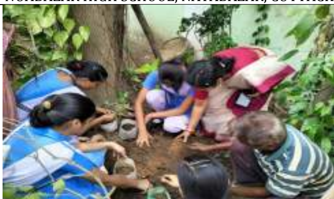
GOVT. GIRLS HIGH SCHOOL, KAZIBAZAR, CUTTACK