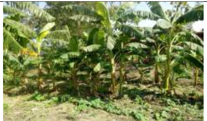
BANADURGA HIGH SCHOOL, DEOBANDHA