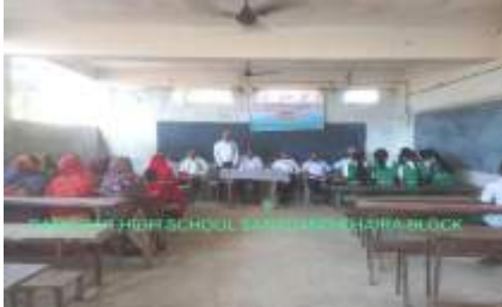
DAMODAR HIGH SCHOOL SARADANG