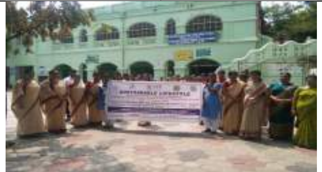
V.V GIRI GOVT. SEC. TRG. SCHOOL