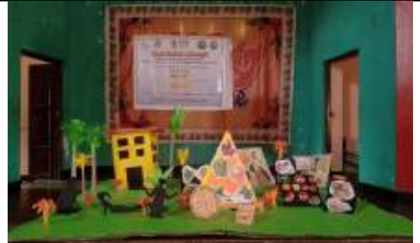
NIRMALA GIRLS' HIGH SCHOOL, KAINSARA