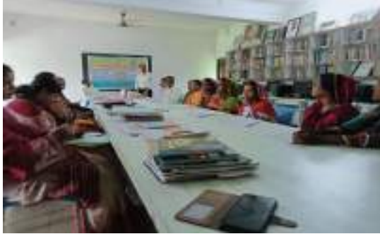
CHACHAJI HIGH SCHOOL