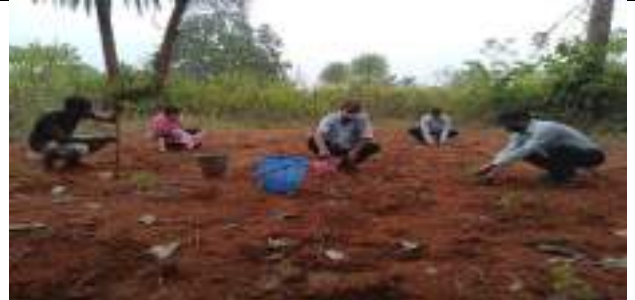
NODAL GOVT. UGHS, JHADABANDHAGUDA