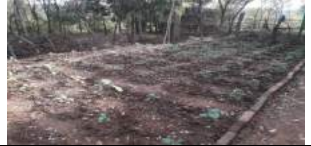
GOVT. LALBAHADUR HIGH SCHOOL, PAPADAHANDI