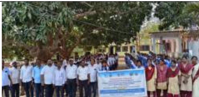
KHANDADEULI HIGH SCHOOL, KHANDADEULI.