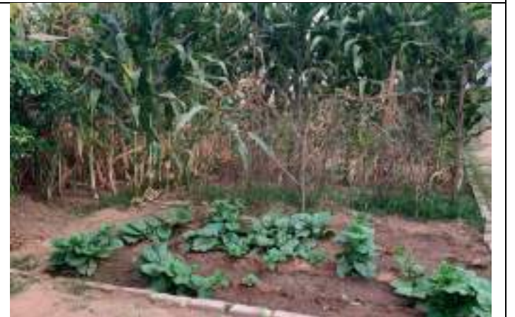
PATITAPABAN GOVT. HIGH SCHOOL, GUDUM, KHORDHA