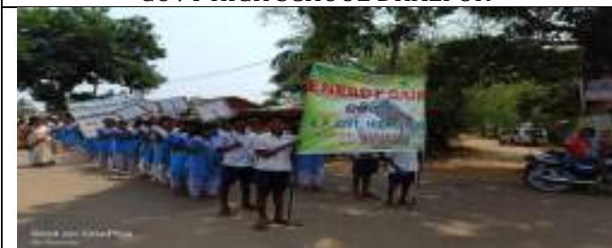
L.M.P. GOVT. HIGH SCHOOL