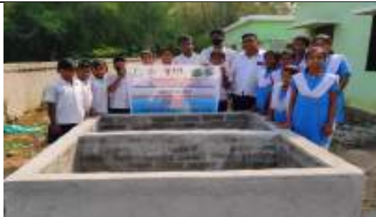
BAMKURA NODAL HIGH SCHOOL, DHUSURI