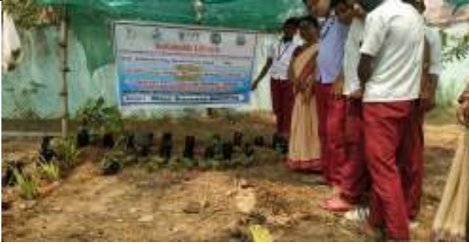
SIDDHESWARA VIDYA MANDIRA NARAJ CUTTACK