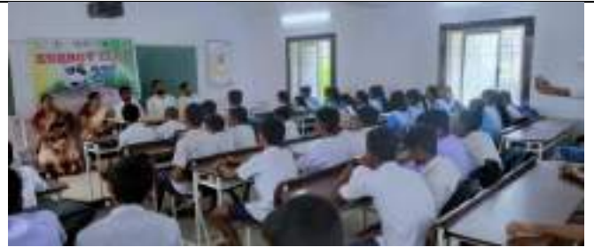
HRUDANANDA GOVT HIGH SCHOOL, TAMBAKHURI