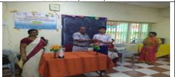
GOVT HIGH SCHOOL, UNIT-6, BHUBANESWAR