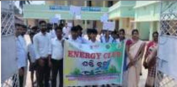
HRUDANANDA GOVT HIGH SCHOOL, TAMBAKHURI