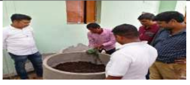
SARALA HIGH SCHOOL SAINTA CHANDBALI