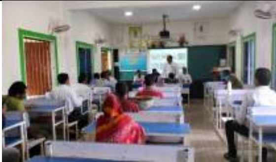
K.B HIGH SCHOOL TAPANDIA