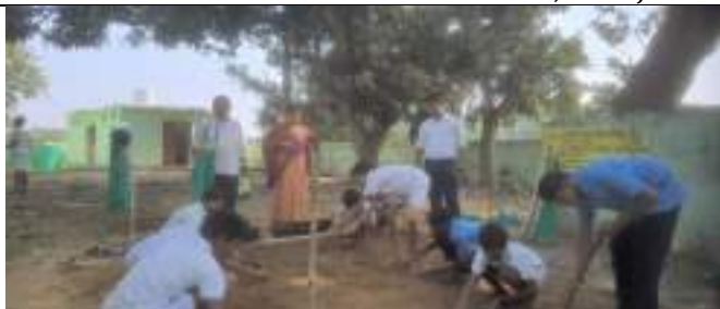
SANKHATARAS GOVT. HIGH SCHOOL.