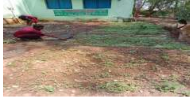
SAHID LAXMAN NAYAK HIGH SCHOOL DHODRA