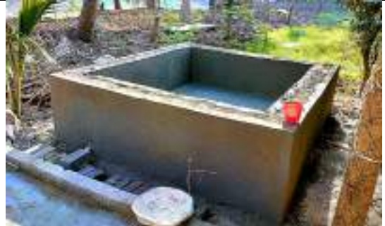
ANCHALIKA GOVT. HIGH SCHOOL SAUN