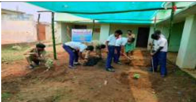
B.N BIDYAPITHA, ATHGARH