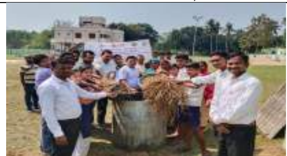
PANCHAYAT GOVT.NODAL HIGH SCHOOL, GUAGADIA