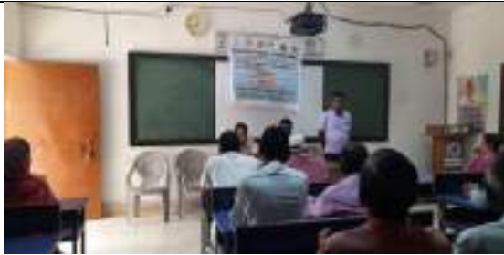
A.P. HIGH SCHOOL, ANJI