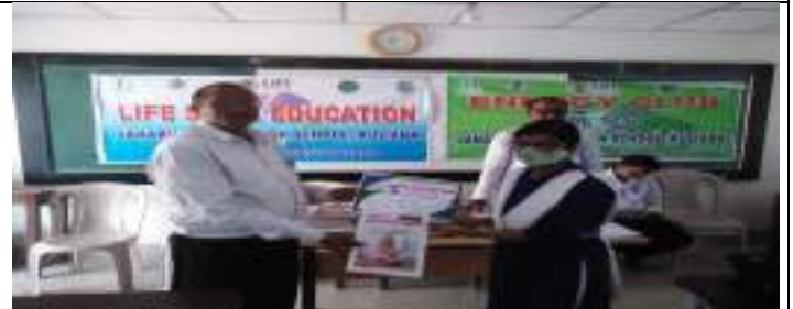
JANAKILAL GOVT HIGH SCHOOL KULIANA