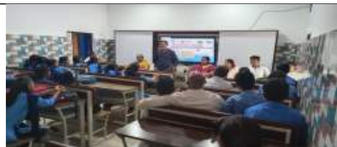
BALAKRUSHNAGOV'T HIGH SCHOOL, JIGNIPUR