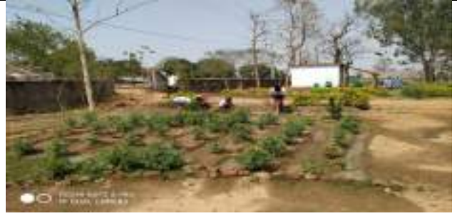
RATA KHANDI GUPS