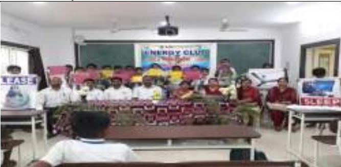
UDALA HIGH SCHOOL