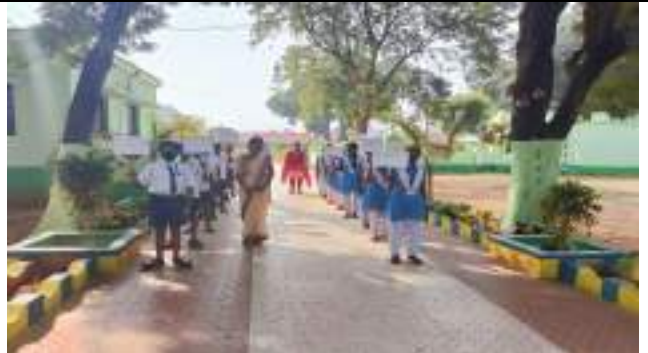
GOVT. HIGH SCHOOL REC CAMPUS RKL-8