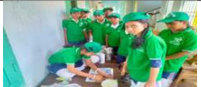
UPENDRA BHANJA HIGH SCHOOL