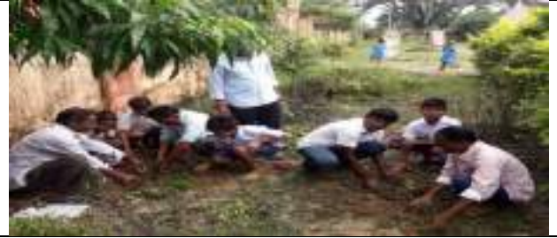
DAMA MUNDA H.S