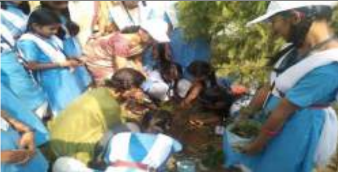
V.V GIRI GOVT. SEC. TRG. SCHOOL