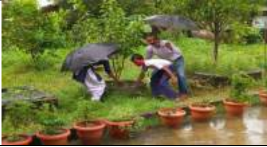
MARJAKUD U.P.S (UGME SCHOOL)