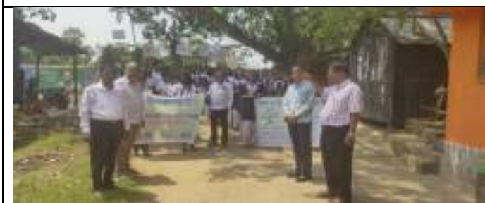
PANCHAYAT HIGH SCHOOL, RAMPUR