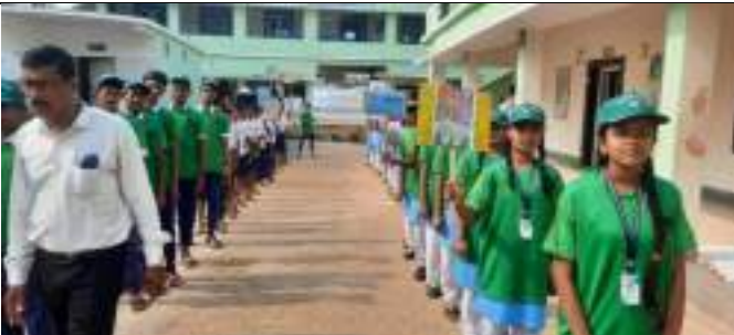
BHUTA SARSINGI HIGH SCHOOL