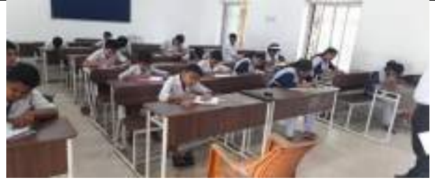
GOVT. HIGH SCHOOL, KINJIRMA