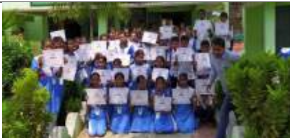
JAJPUR ZILLA SCHOOL, JAJPUR