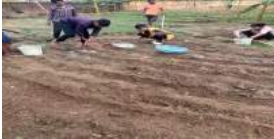
PATEN HIGH SCHOOL PATKHALIA