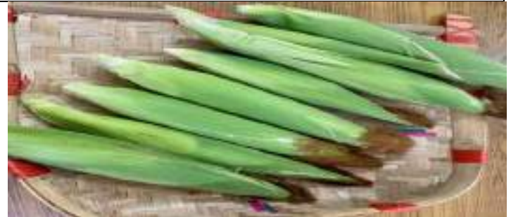
GOVT GIRLS HIGH SCHOOL UNIT-IX BBSR