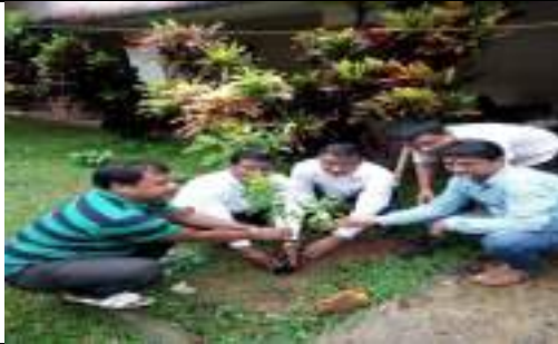
BIUTUPALI J.B.H.S MAULSINGA