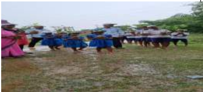
LINGARAJ HIGH SCHOOL, DANGARPADA