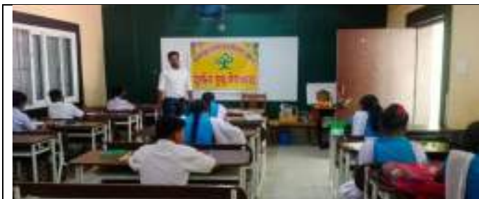
RAMA LAXMANA GOVT. HIGH SCHOOL KHANDARA