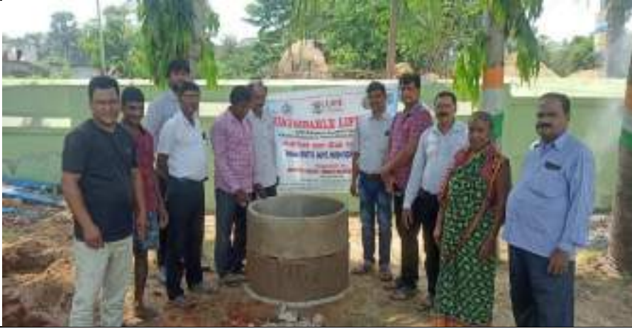
MOTTO GOVT HIGH SCHOOL