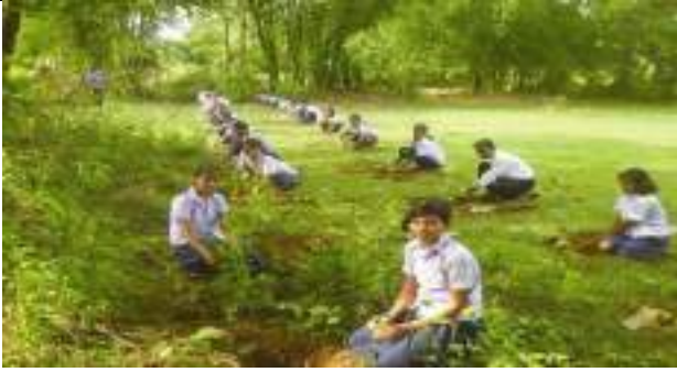
GOVT. BOYS HIGH SCHOOL, UNIT-IX