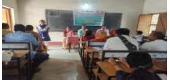
RAMACHANDRA GOVT HIGH SCHOOL, DAMODARPUR