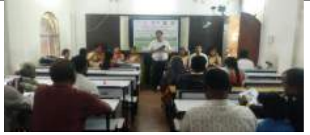
GOVT.U.G.HIGH SCHOOL SVVM. UMERKOTE