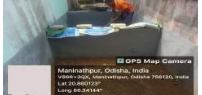
N.K.P GOVT HIGH SCHOOL - MANINATHPUR