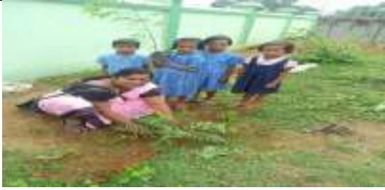
KAMAL PUR GUPS