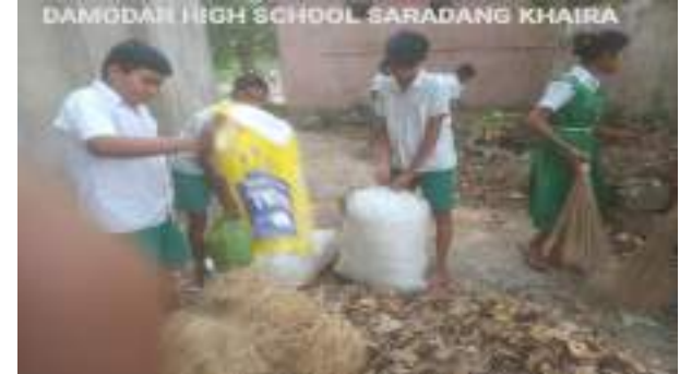
DAMODAR HIGH SCHOOL SARADANG