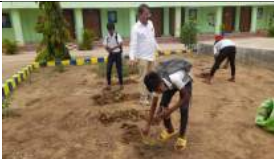
GOVT. NODAL HS, JAMRUNDA