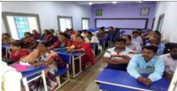
PEOPLE'S HIGH SCHOOL, BAGUDA