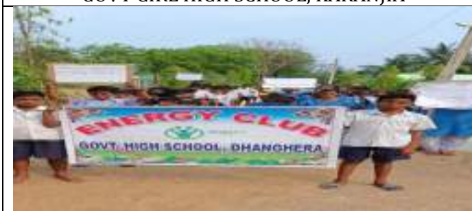
GOVT HIGH SCHOOL, DHANGHERA