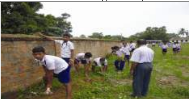
GOVT. HIGH SCHOOL, PAIKATIGIRIA