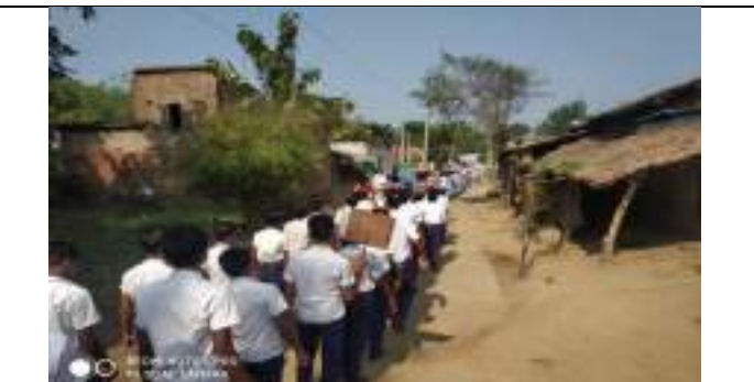
BANEIKALA GOVT HIGH SCHOOL