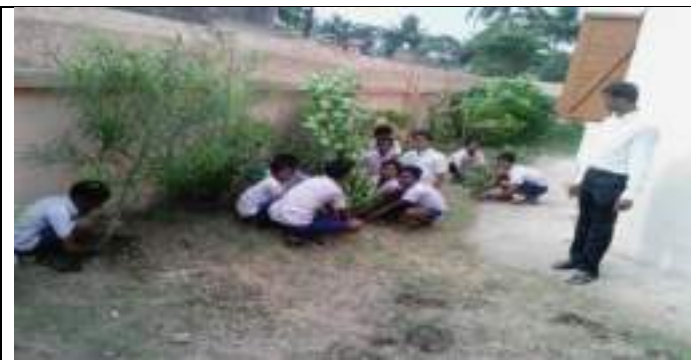
MAHARATHA GOVT. HIGH SCHOOL, NAHARAKANTA