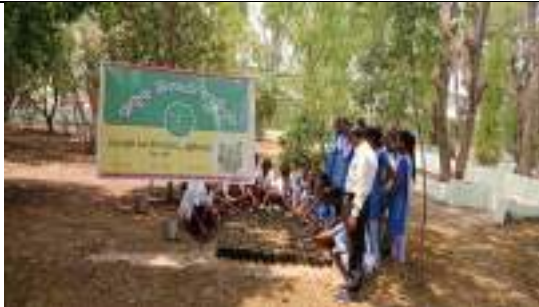
RADHAKRUSHNA UCHHA BIDYAPITHA SUNDHIPADAR