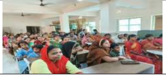
MUNICIPAL GANDHI GOVT HIGH SCHOOL RAJGANGPUR