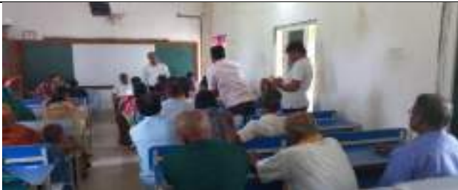
DAMODAR GOVT. HS, JAMUJHADI