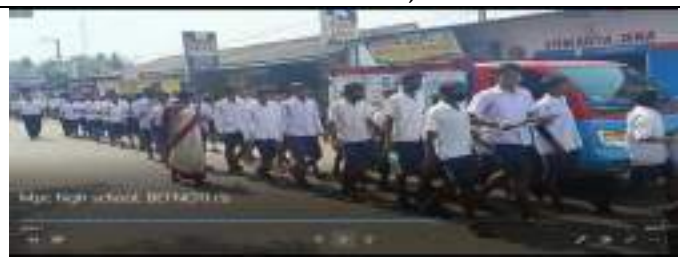
M.P.C. HIGH SCHOOL, BETNOTI