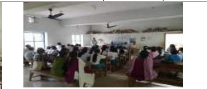
SATSANGA GOV'T. HIGH SCHOOL