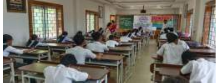
MAHATAB GOVT HIGH SCHOOL, MANGALPUR