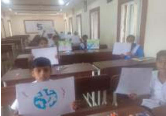
NATIONAL HIGH SCHOOL, DURA