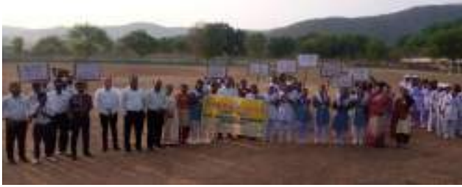
GOVT HIGH SCHOOL BADAMPAHAR