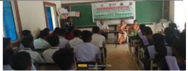
JASHIPUR GOVT HIGH SCHOOL