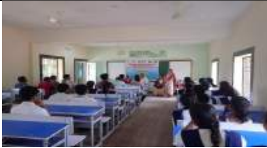
KC HIGH SCHOOL, SRIRAMPUR ROAD