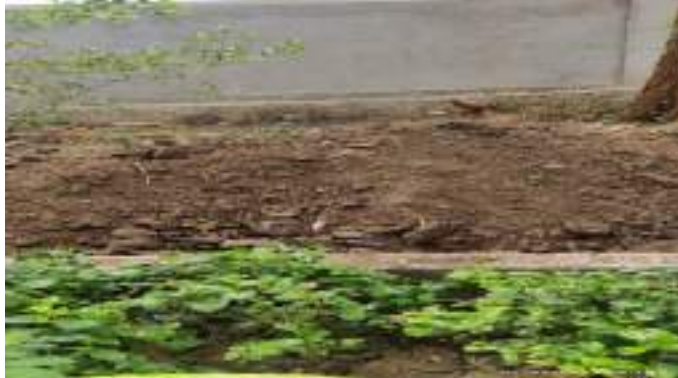
KAMAL PUR GUPS