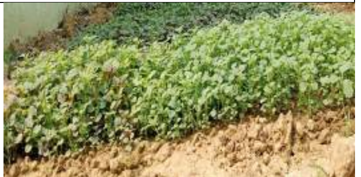
SATYABHAMAPUR NODAL HIGH SCHOOL