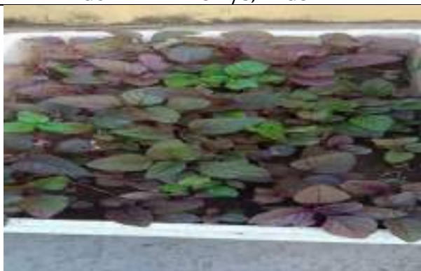
GOVT GIRLS H/S, UNIT-VIII, BBSR