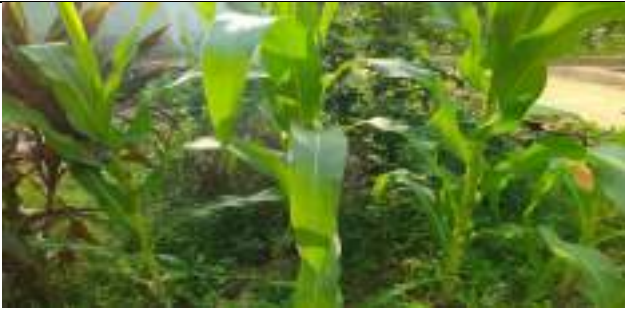
GOVT GIRLS HIGH SCHOOL UNIT-IX BBSR