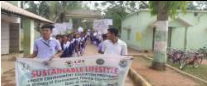
JASHIPUR GOVT HIGH SCHOOL