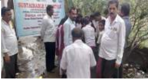
G P HIGH SCHOOL, NALGUNDA