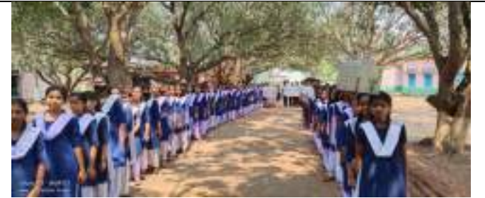
JAWAHAR GOVT. HIGH SCHOOL