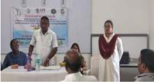
JANARDAN UCHA NODAL BIDYAPITHA