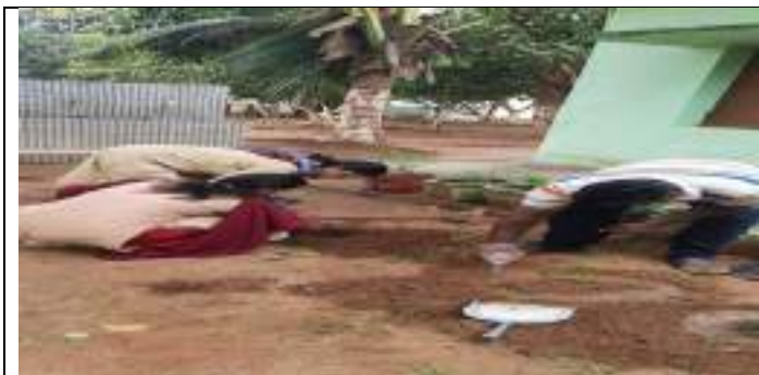
URMILA UP (ME) SCHOOL, BALIAPADA