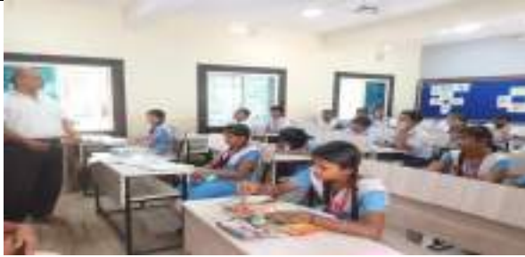
S.J.BIDYA PEETHA, KANSA