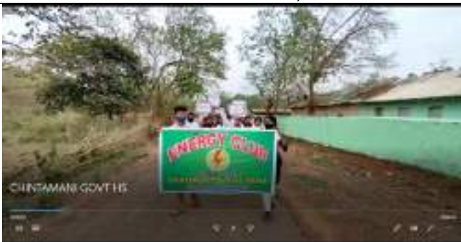
CHINTAMANI GOVT HIGH SCHOOL.