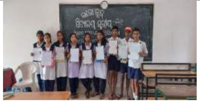
JUJHAPADA HIGH SCHOOL, RACHHIPUR