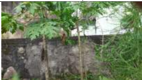
GOVT. UGUP CHIKILI