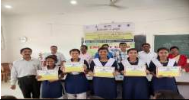
M.P.K. GOVT GIRL HIGH SCHOOL