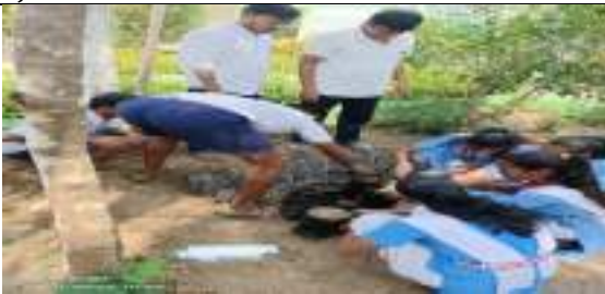
JANATA GOVT HIGH SCHOOL BILASPUR