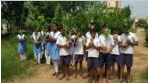
GOVT.HIGH SCHOOL PURUNAKATAK