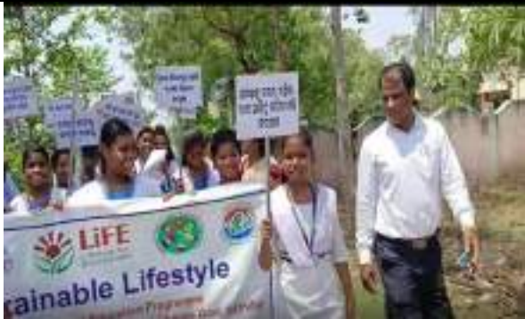
GHATIPARI HIGH SCHOOL, BALLIPADA