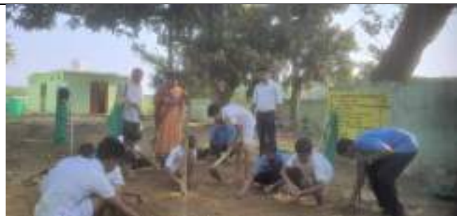
KHANANAGAR NODAL HIGH SCHOOL, CUTTACK