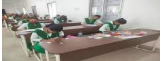
GOVT GIRLS HIGH SCHOOL, KAPTIPADA