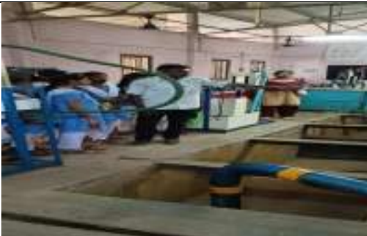
CHHATENPALI GP HIGH SCHOOL