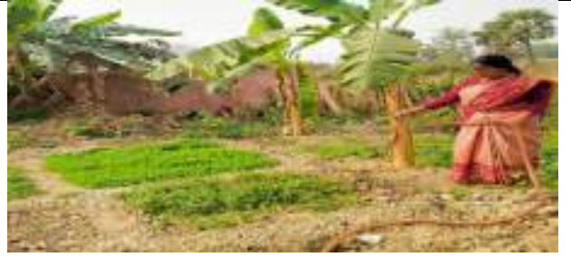
GOVT. UP SCHOOL, KANGUMAJHIGUDA