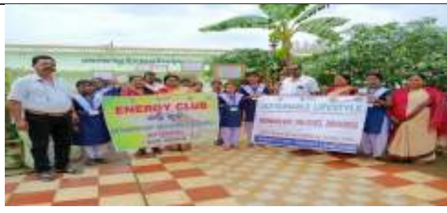
BIRESWARPUR GOVT. HIGH SCHOOL