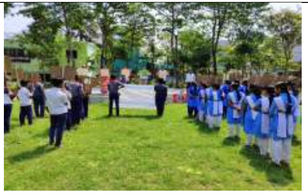
SARAT CHANDRA PANDA SMARAKI UTCHHA BIDYALAYA