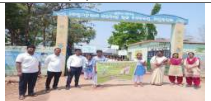
GORUMAHISANI GOVT.HIGH SCHOOL