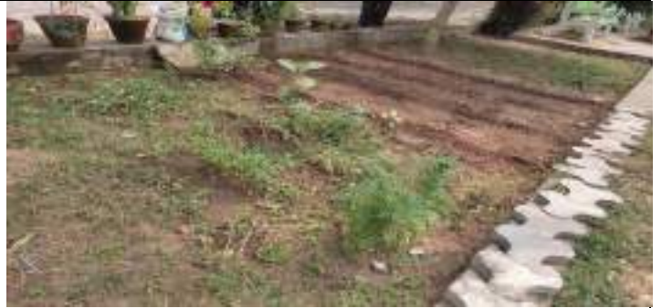
NANDANKANAN GOVT HIGH SCHOOL