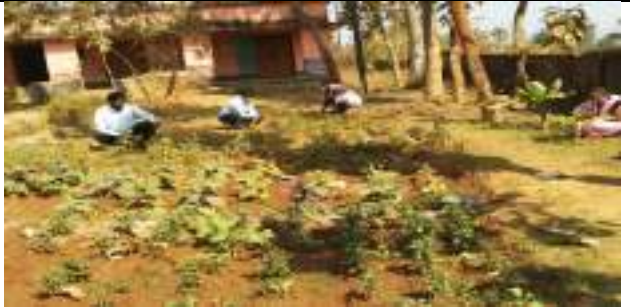
NODAL GOVT. HIGH SCHOOL, NANDAHANDI