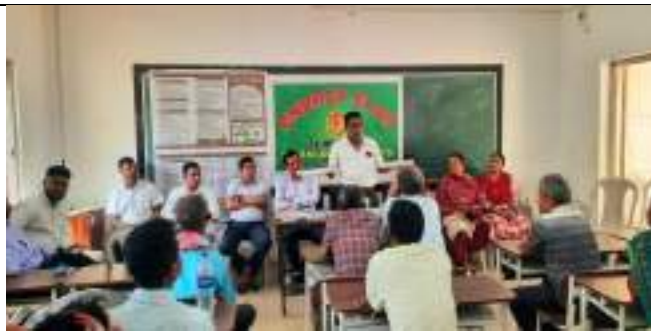
BAHALDA HIGH SCHOOL, BAHALDA