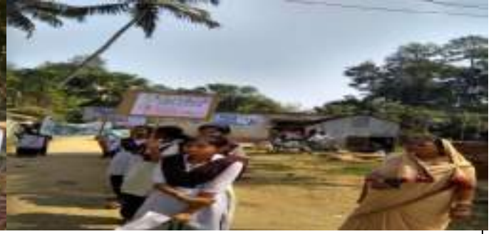
MANGALPUR GOVT. GIRLS HIGH SCHOOL