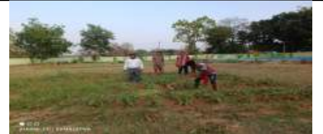
GOVT UGHS BHANDARIGUDA