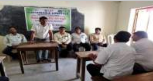
GOVERNMENT GIRLS HIGH SCHOOL, BASUDEVPUR