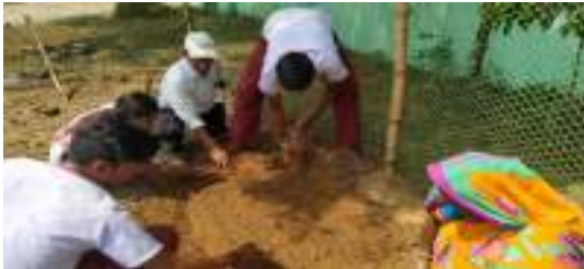
NIALI HIGH SCHOOL, CUTTACK