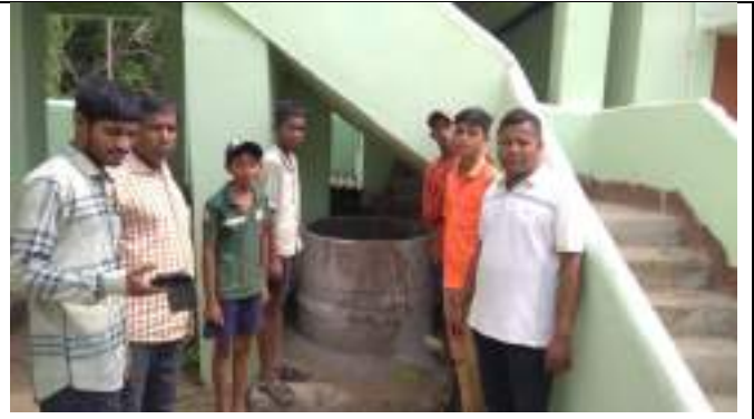
PANCHUTIKIRI NODAL GP HIGH SCHOOL