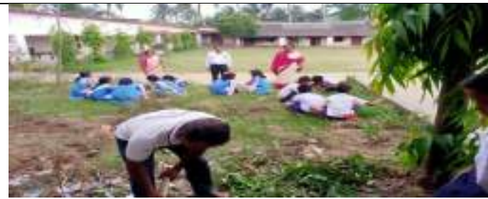
G.S VIDYAPITHA, SIDDHESWARPUR