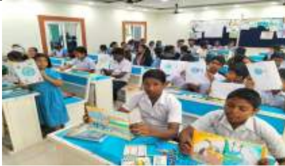
B.S HIGH SCHOOL, SUNDARGARH