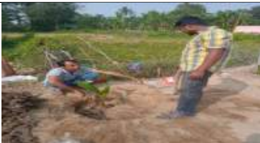
ST. XAVIER P.S