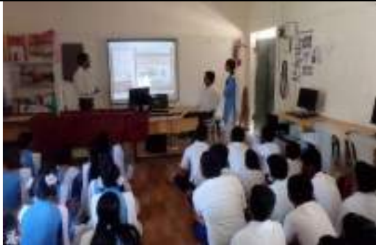
GOVT. HIGH SCHOOL REC CAMPUS RKL-8