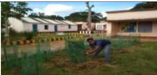
BUTUPALI U.P.S (BUTUPALI UGME)