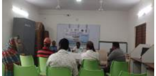
JANARDAN UCHA NODAL BIDYAPITHA