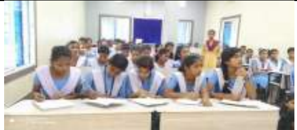
KUMJHARIA GOVT. UG HIGHSCHOOL