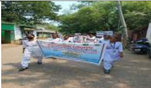
GOVT. GIRLS HIGH SCHOOL, BONAIGARH