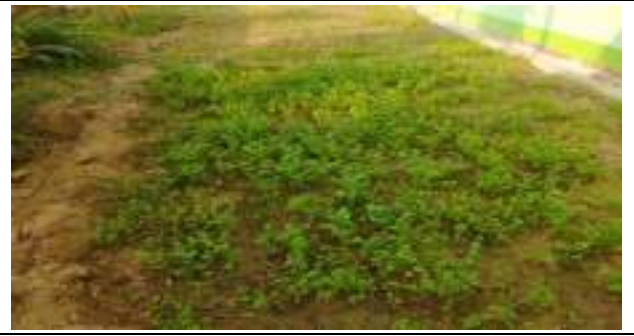
GOVT. UPS ANCHALA