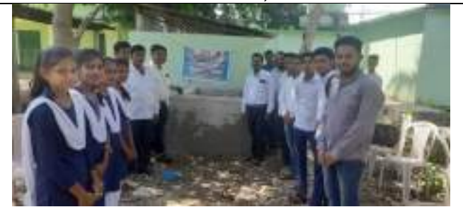
ATAL BEHARI GOVT.NODAL HIGH SCHOOL