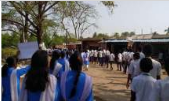
SRI RAGHUNATH HIGH SCHOOL, JORODO