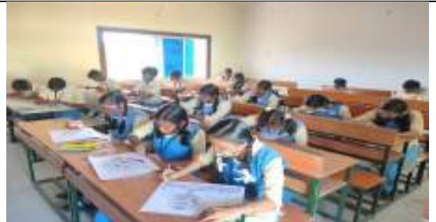
BALAJI BIDYAPITHA, KONISI