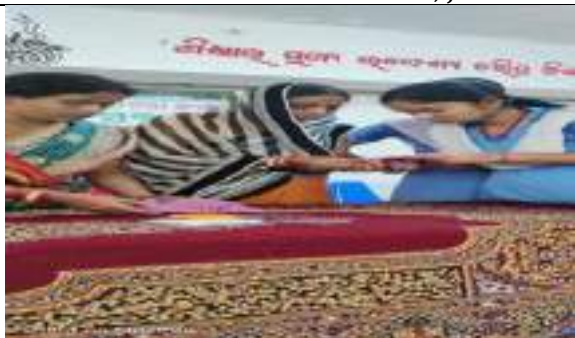
SRIJHADESWAR HIGH SCHOOL