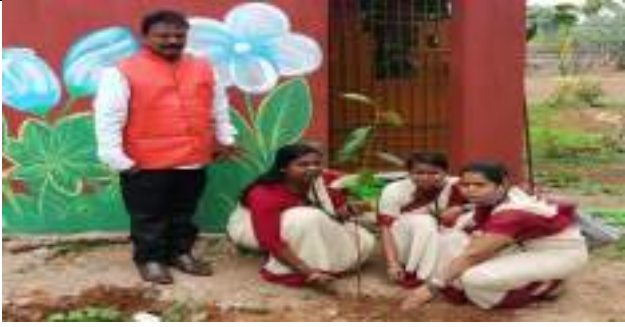
GOVT HIGH SCHOOL ,V.S.S. NAGAR