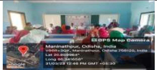
N.K.P GOVT HIGHER SECONDARY SCHOOL, MANINATHPUR