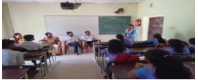
MANIDA GOVT. HIGH SCHOOL