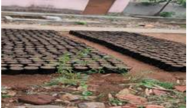
KAMAL PUR GUPS