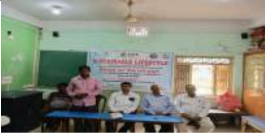
VENKATESWAR SCHOOL, CHANDBALI