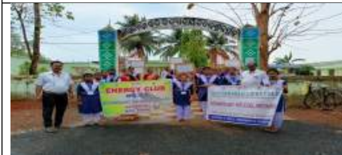
BIRESWARPUR GOVT. HIGH SCHOOL