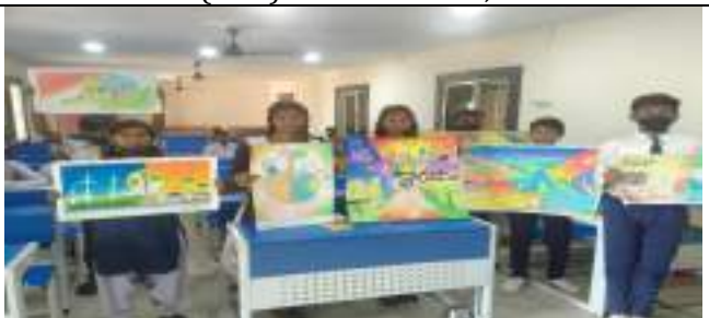
NEW ORISSA HIGH SCHOOL, GAIBIRA