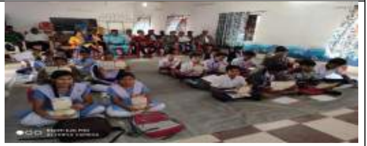
GOVT HIGH SCHOOL, BADAMTALIA