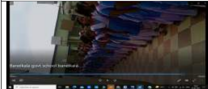
BANEIKALAGOVTHIGH SCHOOL, BANEIKALA