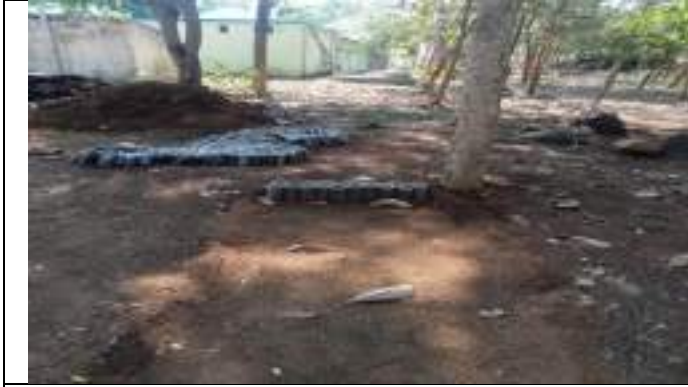
MATHURA GPHS, KELAKATA