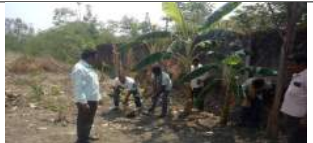
BANADURGA HIGH SCHOOL, DEOBANDHA