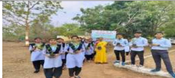
RAMACHANDRA KALPANA H.S. SCHOOL, PRAKRUTI VIHAR