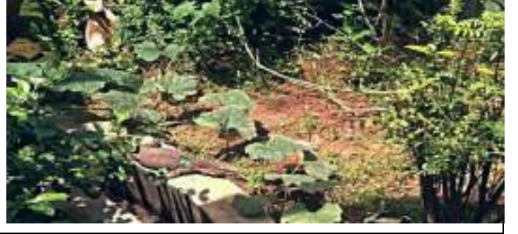
SRI BUDDHANATH GOVT HIGH SCHOOL, BALLIPATANA.