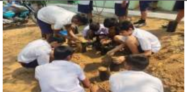
RADHAKRUSHNA UCHHA BIDYAPITHA SUNDHIPADAR