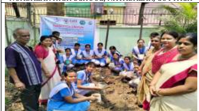
GOVT. GIRLS HIGH SCHOOL, KAZIBAZAR, CUTTACK