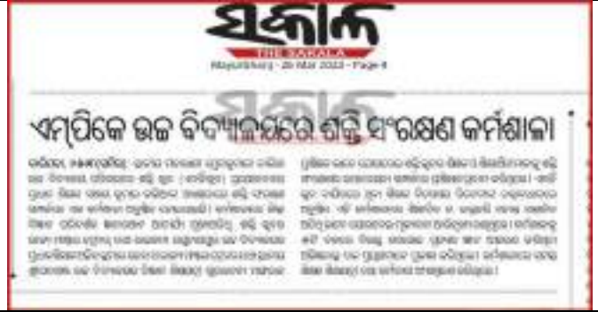
M.P.K. GOVT GIRL HIGH SCHOOL