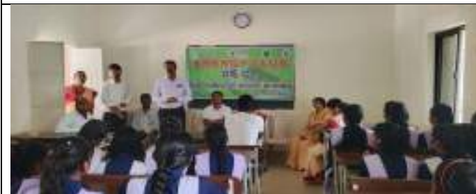
BHAGABATCHANDRAPUR GOVT HIGH SCHOOL, ORACHANDABILLA