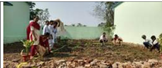
GOVT .HIGH SCHOOL, KUSHAMATI, CHHANAGHARA