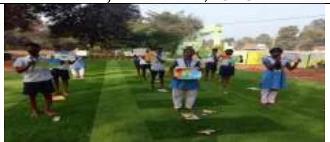
PADMANAVPUR NODAL HIGH SCHOOL, DIGAPAHANDI