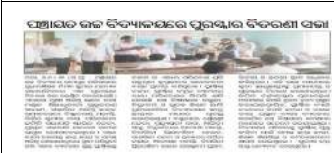
PANCHAYAT HIGH SCHOOL, RAMPUR