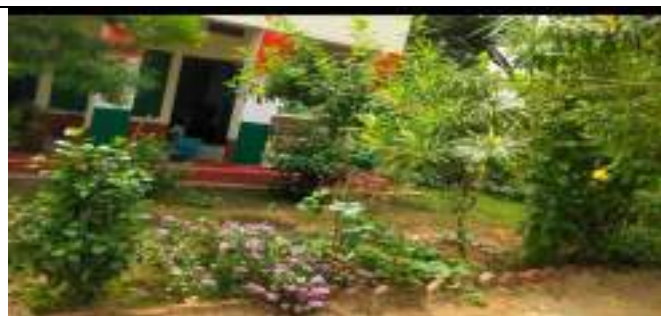
GOVT. HIGH SCHOOL, CHHATRAPADA