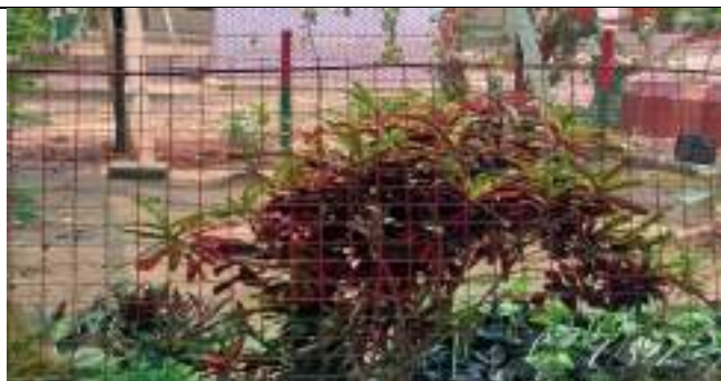
URMILA UP (ME) SCHOOL, BALIAPADA