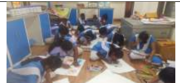
SONAPARBAT GOVT. HIGHSCHOOL