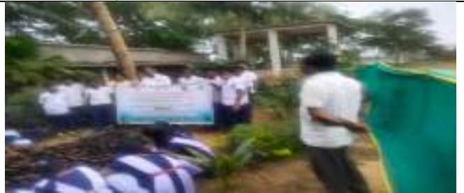
PANCHAYAT HIGH SCHOOLKANTAPARI, N.KOILI