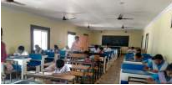
GOVT. NB BIDYAPITHA, KANKORADA