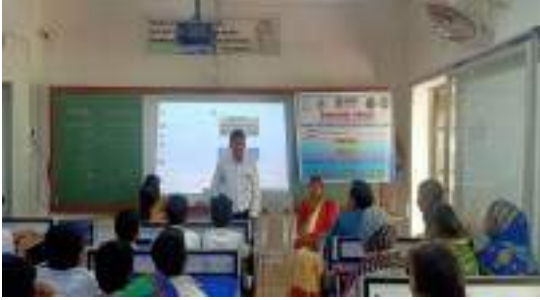
DINABANDHU GOVT. HIGH SCHOOL, BERHAMPUR