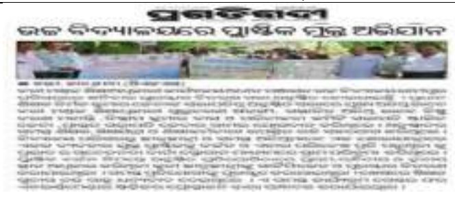
PANCHAYAT HIGH SCHOOL, RAMPUR