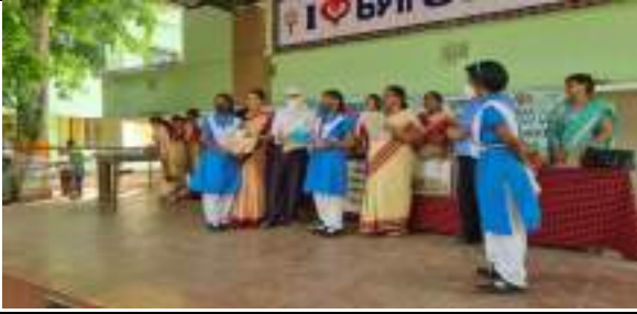
SM HIGH SCHOOL, KHALLIKOTE