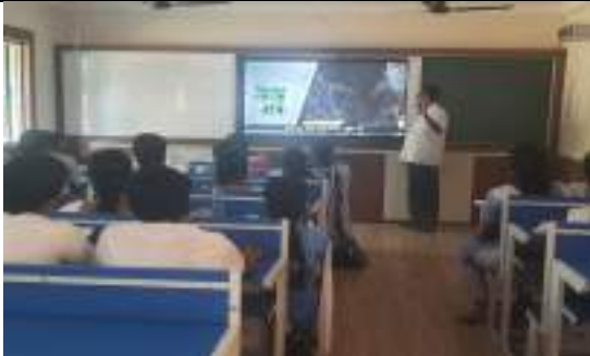
GOVT. HIGH SCHOOL, UDIT NAGAR