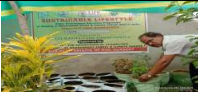
GOVT UGHS BADAKAMBILO (1)