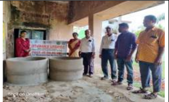
AKHANDALAMANI NODAL HIGH SCHOOL