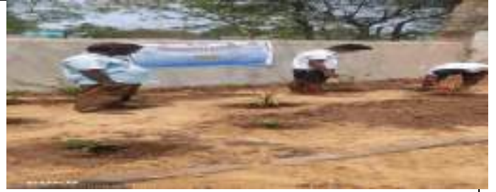
MAHULIABIDYAPITHA. BADAMBA BLOCK