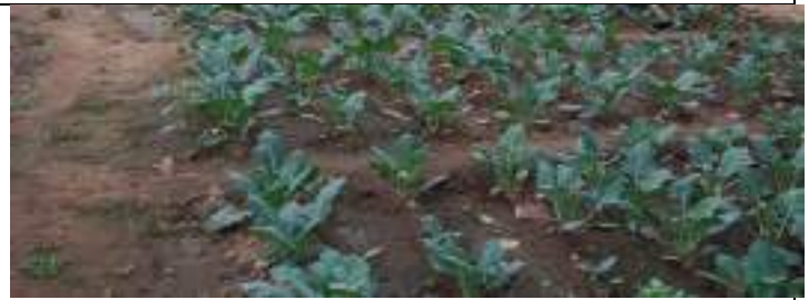
CAPITAL GIRLS H/S ,UNIT-II, BBSR