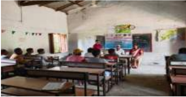
BASTA GIRLS' HIGH SCHOOL, BASTA