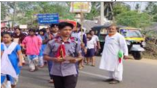
B.N. GOVT HIGH SCHOOL, JAMUKESWAR