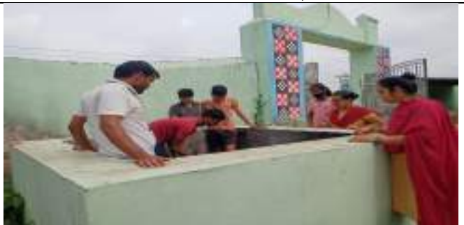
PURUSOTTAM GOVERNMENT HIGH SCHOOL SARAMARA