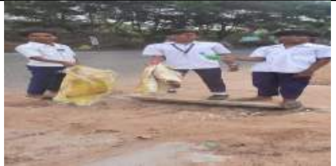
MADAN MOHAN NODAL HIGH SCHOOL, GIRISOLA