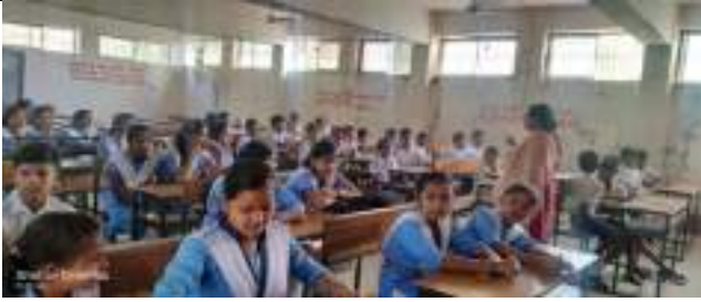
S.B. HIGH SCHOOL