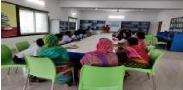
SASANBAD UP GRADED HIGH SCHOOL, MANGALPUR