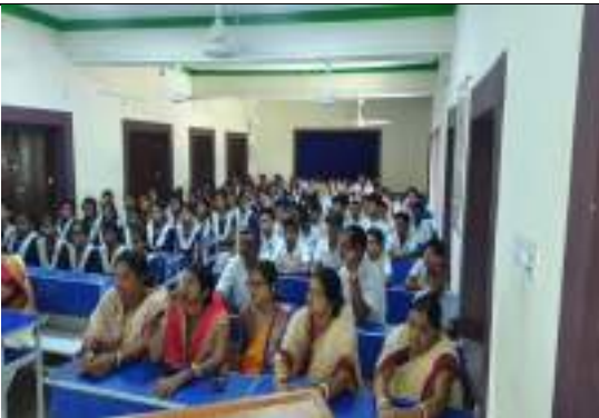
G.N. HIGH SCHOOL, IRDA