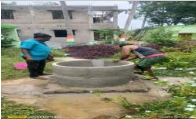
BN Govt High School, Jaypur