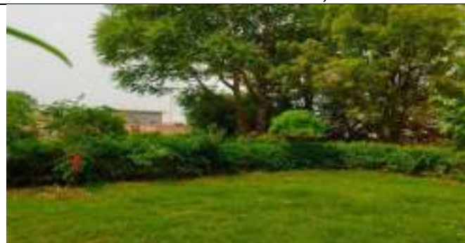
GOVT.HIGH SCHOOL, KAIPADAR, KHORDHA