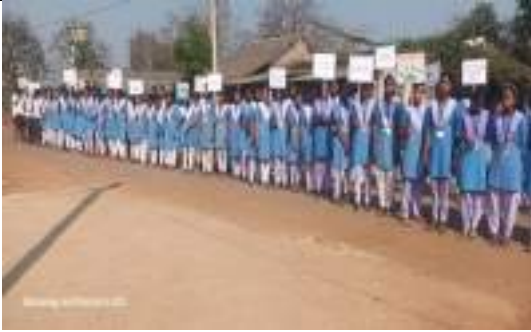
GOVT. HIGH SCHOOL, BALISANKARA