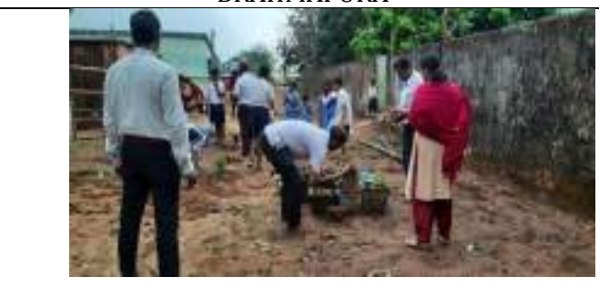
G.P HIGH SCHOOL, RATAPAT