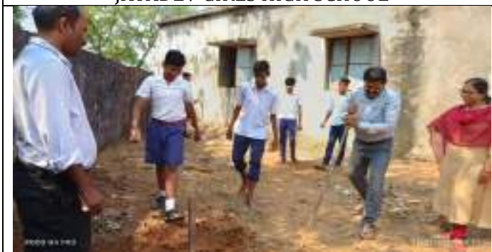
SHREE SINGHANATH DEV BIDYAPITHA