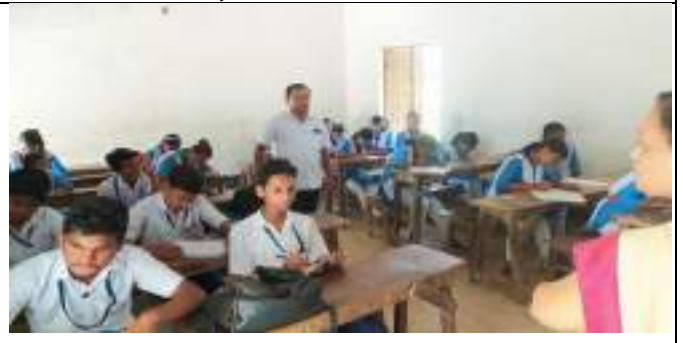
SRI RAGHUNATH HIGH SCHOOL, JORODO