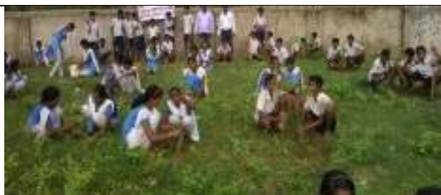
GOPABANDHU H/S, BEGUNIA