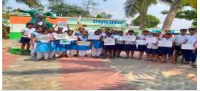
GOVT. NB BIDYAPITHA, KANKORADA