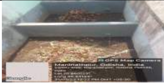
N.K.P GOVT HIGHER SECONDARY SCHOOL, MANINATHPUR