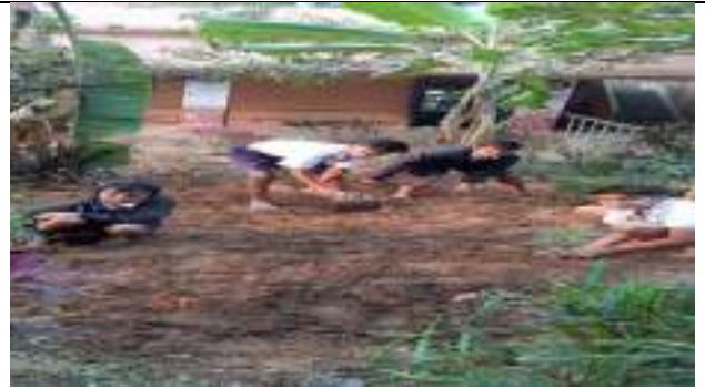
DIVYA HRIDAY GIRLS HS, TENTULIKHUNTI