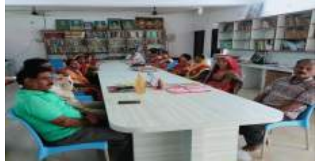
CHACHAJI HIGH SCHOOL