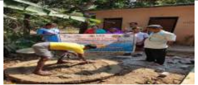
SIDHESWAR UP SCHOOL, UCCHADIHA