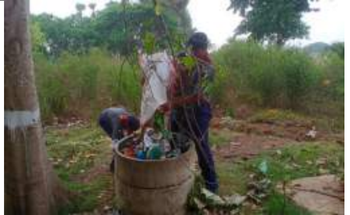
SIR AURONINDO PURNANGA SIKSHYA KENDRA