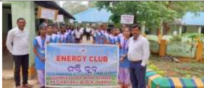
SUKRULI GOVT HIGH SCHOOL