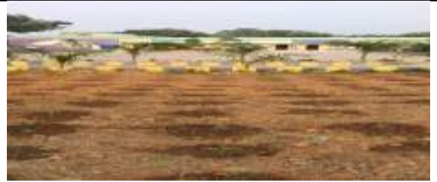
GOVT. UGHS BADAKUMULI