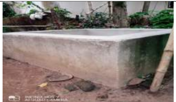
DAHAMUNDA GOVT HIGH SCHOOL