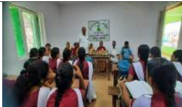
SASHIDEVI GIRLS HIGH SCHOOL ,CHHATIA, JAJPUR.