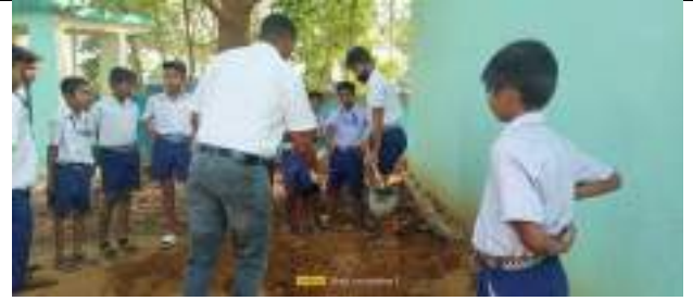
J D HIGH SCHOOL, BOUDH