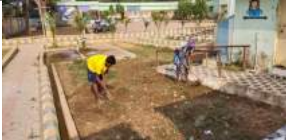
NODAL GOVT. BAPUJI HIGH SCHOOL, TENTULIKHUNTI