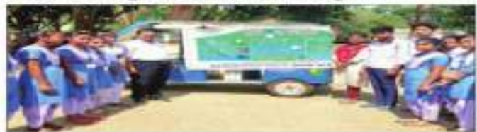
BANGRIPOSI GOVT HIGH SCHOOL

କୋଟିକିଲୋଟି ଶକ୍ତି ସଂରକ୍ଷଣ (ଫିକ୍ସ-କର୍ବ) କୋଟିକିଲୋଟି ସଂରକ୍ଷଣର ଯୋଗ ଦେଖାଇବା ପାଇଁ ବିଦ୍ୟାଳୟ ପରିସରରେ ଶକ୍ତି ସଂରକ୍ଷଣ ସଚେତନତା ଅଭିଯାନ ରଥ ପରିଭ୍ରମଣ କାର୍ଯ୍ୟକ୍ରମ ଆୟତ୍ତ ହୋଇଛି । ଏଥିରେ ଶକ୍ତି ସଂରକ୍ଷଣ ବିପତ୍ତି କରାଯାଇ ଯୋଗ୍ୟ ଶିକ୍ଷକ-ଶିକ୍ଷିତ୍ରୀଙ୍କ ସମେତ ପ୍ରାୟ ୫୦ ଛାତ୍ର-ଛାତ୍ରୀଙ୍କର ଉପସ୍ଥିତିରେ ଶକ୍ତି ସଂରକ୍ଷଣ ରଥ ପରିଭ୍ରମଣ କାର୍ଯ୍ୟକ୍ରମ ଆୟତ୍ତ ହୋଇଛି । ଏଥିରେ ଶିକ୍ଷକ-ଶିକ୍ଷିତ୍ରୀଙ୍କ ସମେତ ପ୍ରାୟ ୫୦ ଛାତ୍ର-ଛାତ୍ରୀଙ୍କର ଉପସ୍ଥିତିରେ ଶକ୍ତି ସଂରକ୍ଷଣ ରଥ ପରିଭ୍ରମଣ କାର୍ଯ୍ୟକ୍ରମ ଆୟତ୍ତ ହୋଇଛି ।