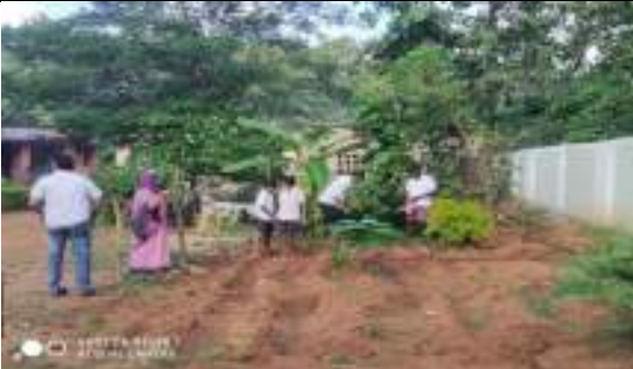
GOVT. UGHS TELANADIGAM, JHARIGAM