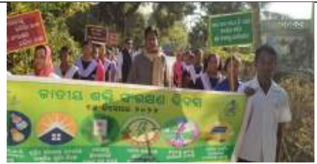
GOVT. HIGH SCHOOL, BISRA