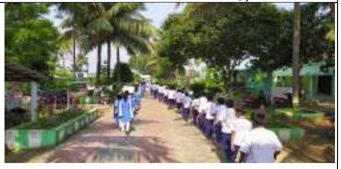
SRIJHADESWAR HIGH SCHOOL