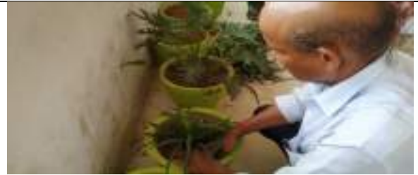
NIALI HIGH SCHOOL, CUTTACK