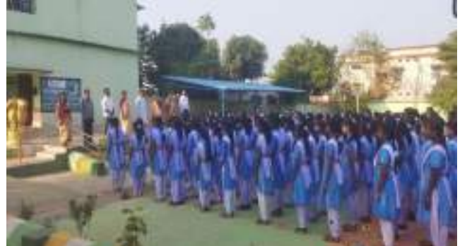
GOVT. HIGH SCHOOL, BANDHBAHAL