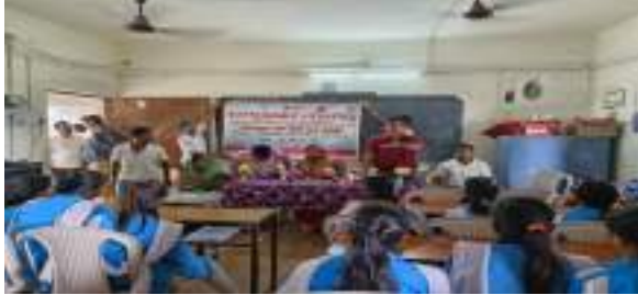
K.T HS, SANKHULA