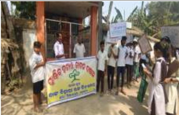
BANKA BIHARI HIGH SCHOOL