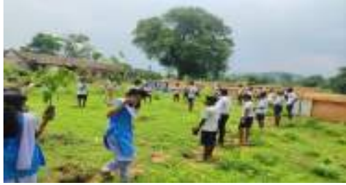
PANCHAYAT H.S CHARICHHAK