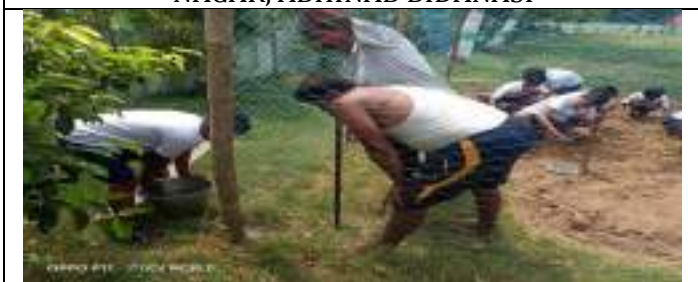
MAA TARINI NODAL BIDYAPITHA, GOPALPUR