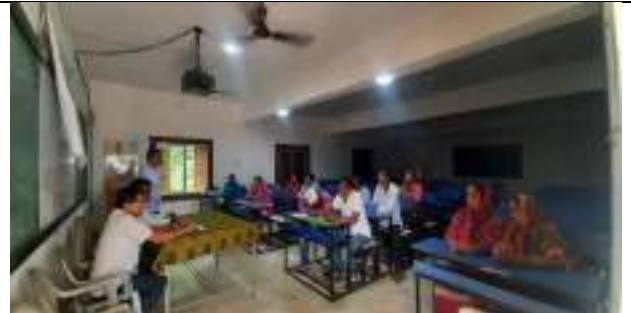
A.P. HIGH SCHOOL, ANJI