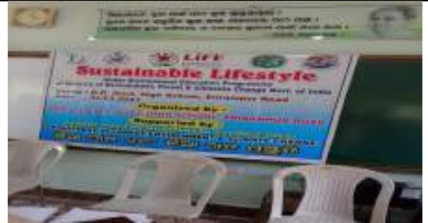
KC HIGH SCHOOL, SRIRAMPUR ROAD