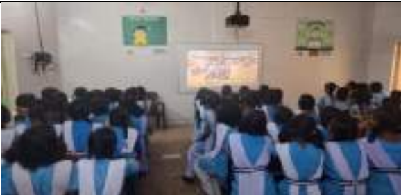
RARUAN NEW GOVT HIGH SCHOOL