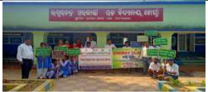
ISWAR CHANDRA GOVT HIGH SCHOOL