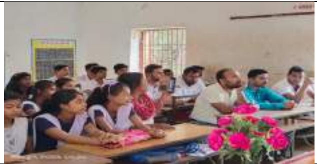
N.P GOVT. HIGH SCHOOL, NANDOR