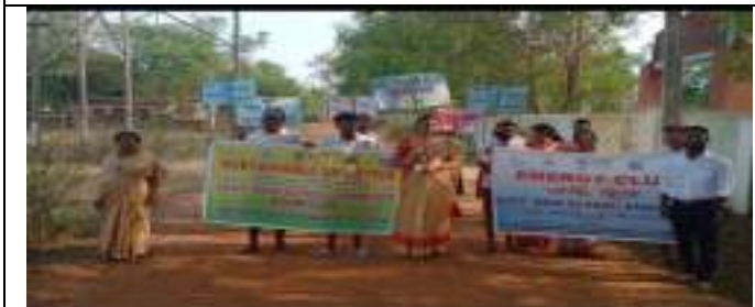
GOVT HIGH SCHOOL SANKERKO