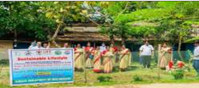
RAILWAY SETTLEMENT HIGH SCHOOL