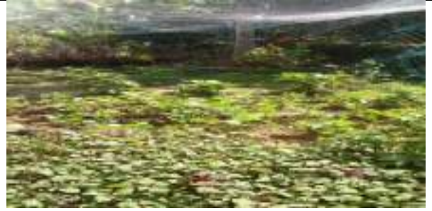
GOVT.UGHS, RAIPUR, UMERKOTE