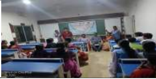
GOVT HIGH SCHOOL TILLO