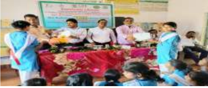
MAABUDHIJAGULAI U.P(ME) SCHOOL, RASUNA