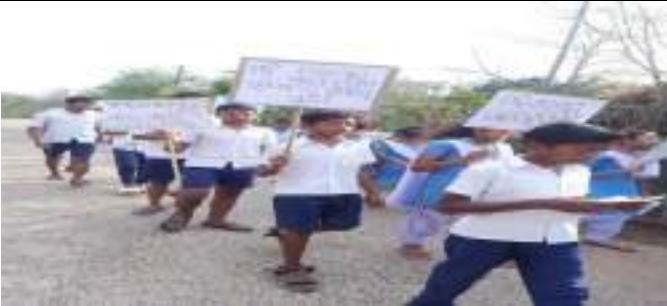
UTKALMANI GOVT HIGH. SCHOOL BAIGANABADIA