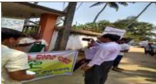
PADMANAV NODAL HIGH SCHOOL, GOLKUND