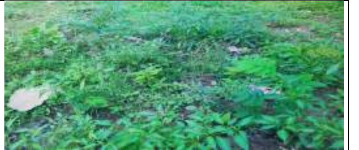
GOVT.H/S GURUJANGA, KHORDHA