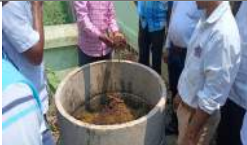
SARALA HIGH SCHOOL SAINTA CHANDBALI