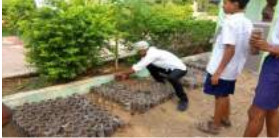
GOVT. NODAL HIGH SCHOOL, BAUNSUNI