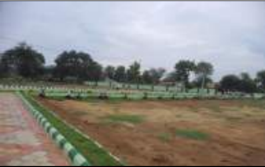
GOVT U.P SCHOOL, AMTHAPADA