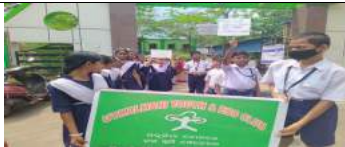
GOVT HIGH SCHOOL, UNIT-6, BHUBANESWAR