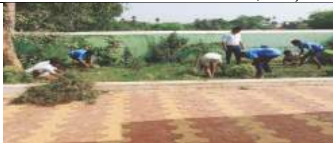
SANKHATARAS GOVT. HIGH SCHOOL.