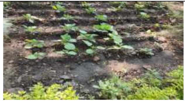
GOVT. HIGH SCHOOL, JAGANNATHPUR