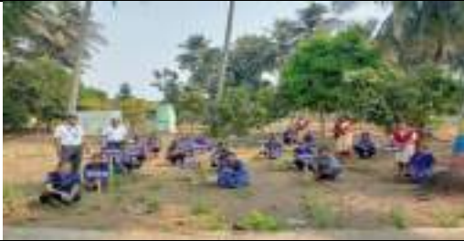
B.B.N. HIGH SCHOOL, SARASARA