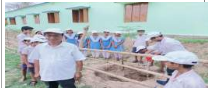
BARENDRA KRUSHNA BIDYAPITHA, BANKI