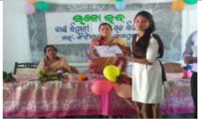
BANKA BIHARI HIGH SCHOOL