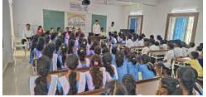
GOVT.HIGH SCHOOL, KANDSORE