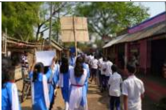
MADHUPURGARH GOVT HIGH SCHOOL