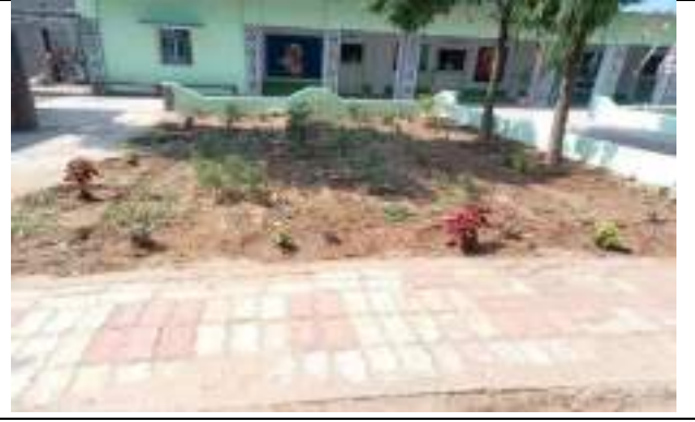
MATHURA GPHS, KELAKATA