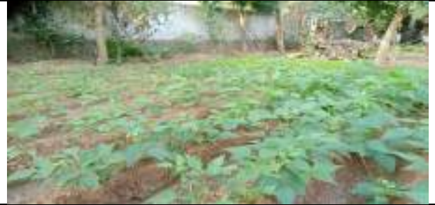
SANGRAMI MAHAMADABAJI HIGH SCHOOL, JHARIGAM