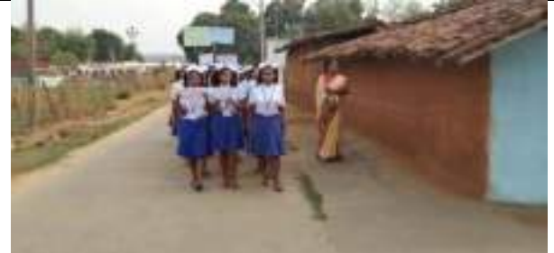
LANJIBERNA SHRAMIK GOVT HIGH SCHOOL