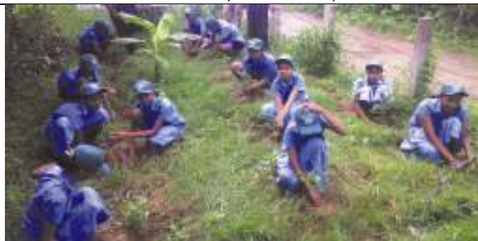
NILAKANTHAGOV.T.HIGH SCHOOL, NANPUT