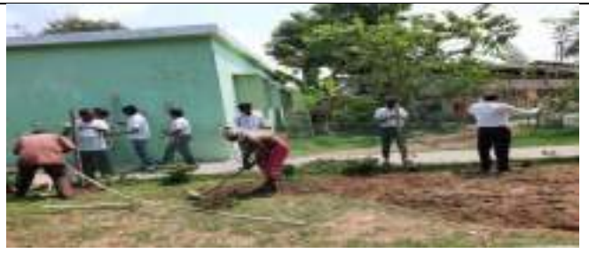
RAILWAY SETTLEMENT HIGH SCHOOL