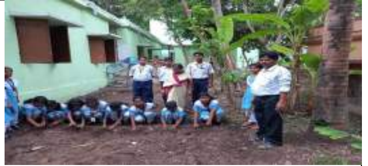
GOVT HIGH SCHOOL POWER HOUSE COLONY UNIT-8