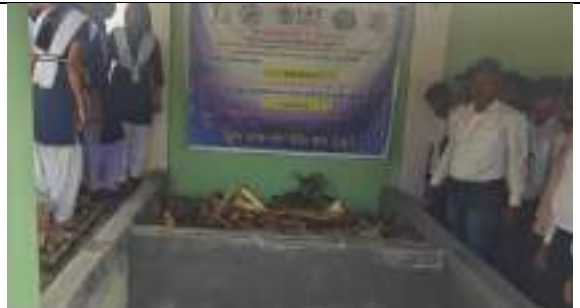
PARKHI REGIONAL HIGH SCHOOL