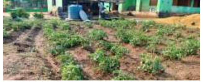
GOVT. U.G HIGH SCHOOL BANKULI