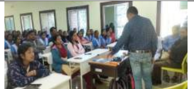
GOVT. HIGH SCHOOL, BARGAON