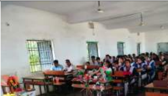
ALLAPUR HIGH SCHOOL