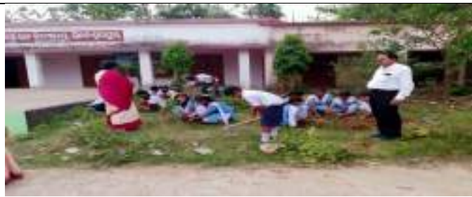
G.S VIDYAPITHA, SIDDHESWARPUR