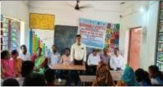
PANCHAYAT GOVT HIGH SCHOOL, BETADA