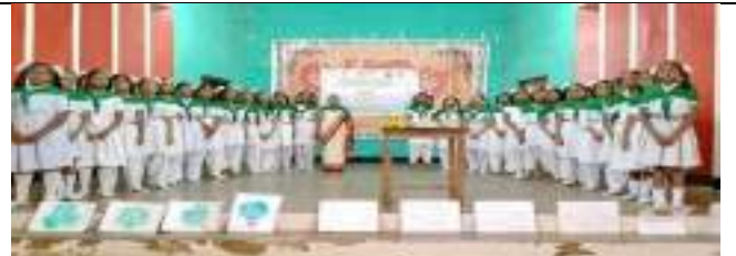
ST.MARRY GIRLS HIGHSCHOOL,SUNDARGARH