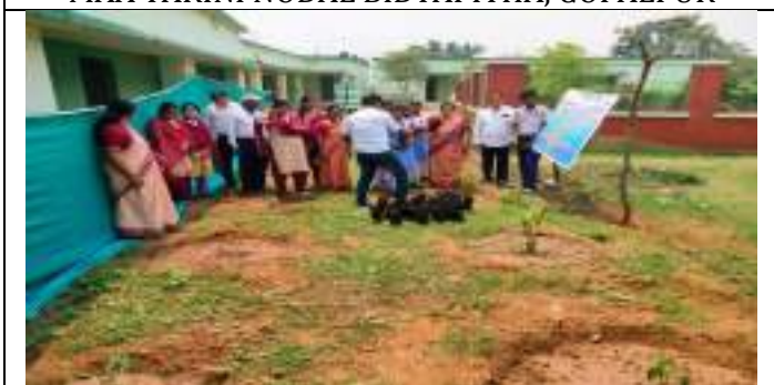
NUABAZAR HIGH SCHOOL, NAYABAZAR, CUTTACK