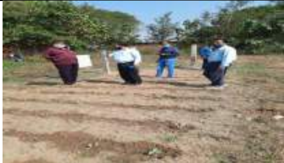
NODAL GOVT. HIGH SCHOOL, NANDAHANDI