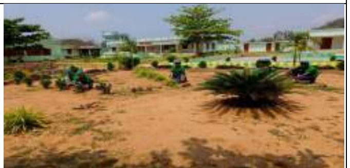
LATHIPADA HIGH SCHOOL, GANJAM