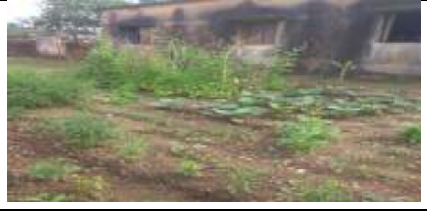
GOVT.HIGH SCHOOL KUNDEI