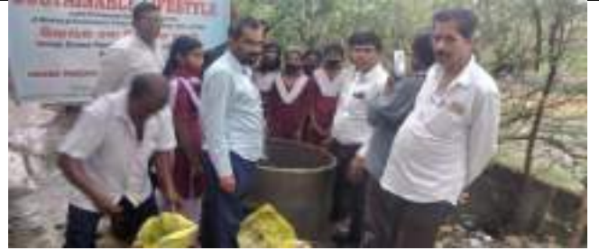
G P HIGH SCHOOL, NALGUNDA