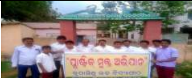
KRUPASINDHU HIGH SCHOOL