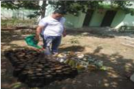
SC HIGH SCHOOL, BM PUR