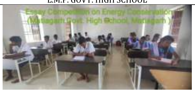
MATIAGARH GOVT. HIGH SCHOOL MATIAGARH