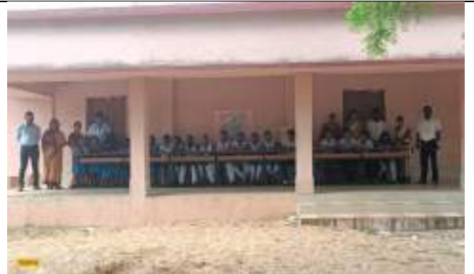
DANDAPANI SAMANTARAY HIGH SCHOOL