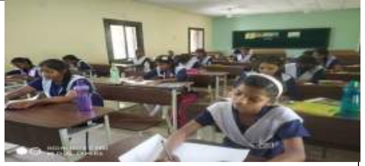
TIRINGI GOVT HIGH SCHOOL