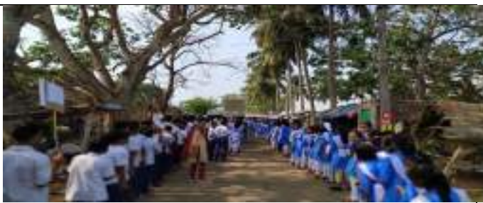
RAMA LAXMANA GOVT. HIGH SCHOOL KHANDARA