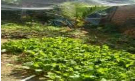
SRI AURIBINDO PURNANGO SHIKYAKENDRA