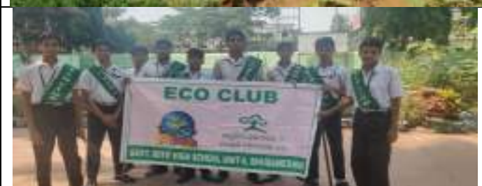
GOVT BOYS' HIGH SCHOOL UNIT-8 BBSR