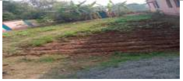
GOVT. UPPER PRIMARY SCHOOL, DENGAGUDA