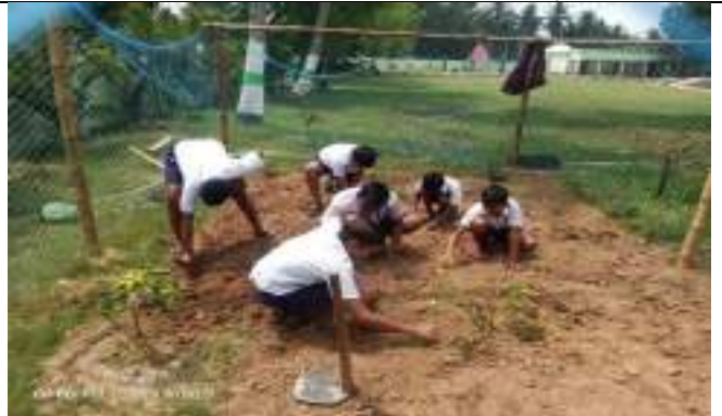
BAPUJI GOVT. HIGH SCHOOL PATPUR