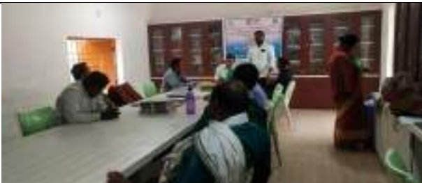
S.N. HIGH SCHOOL, KESHARIPUR