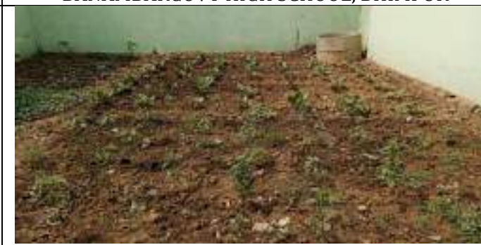
GOVT.HIGH SCHOOL, SAGARGUAN