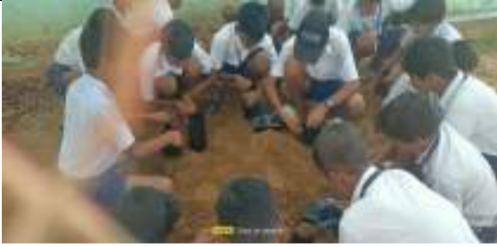
J D HIGH SCHOOL, BOUDH