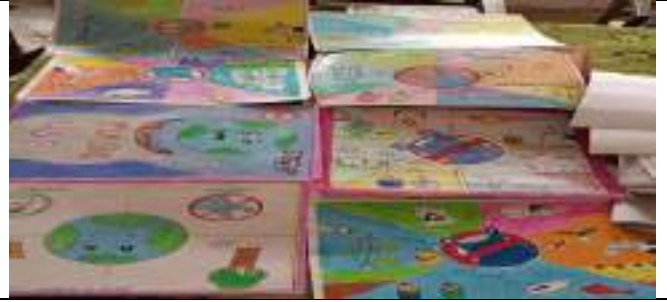
HARI HARA HIGH SCHOOL, ASKA