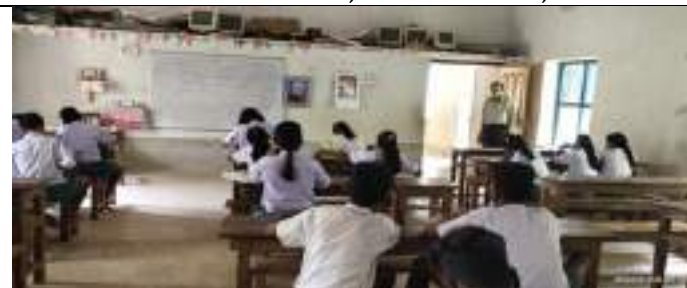
SATSANGA GOV'T. HIGH SCHOOL