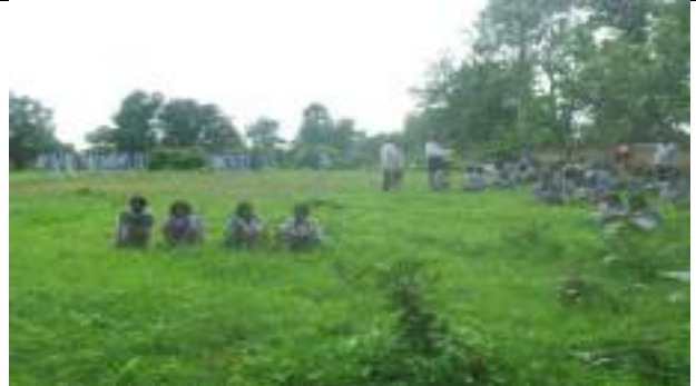
PATITAPABAN GOVT. HIGH SCHOOL GAMBHARIMUNDA