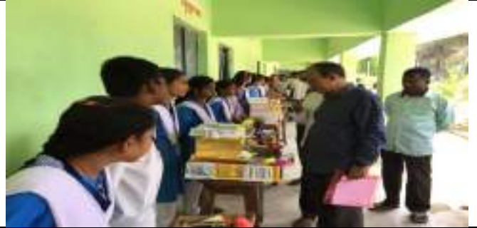
GANESWARPUR PROJECT UP SCHOOL