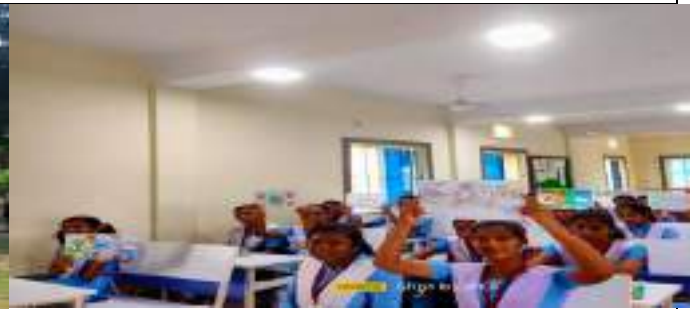
AHIYAS HIGH SCHOOL