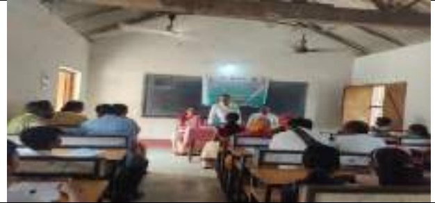
R.C. HIGH SCHOOL, DADARPUR