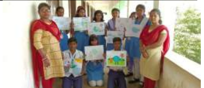
BUDHARAJGOVT HIGH SCHOOL, DANAGADI