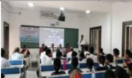
M.B. HIGH SCHOOL, GOPALPUR