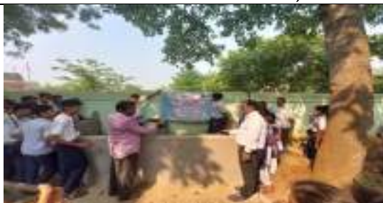
MURALIDHAR HIGH SCHOOL, DHUSURI