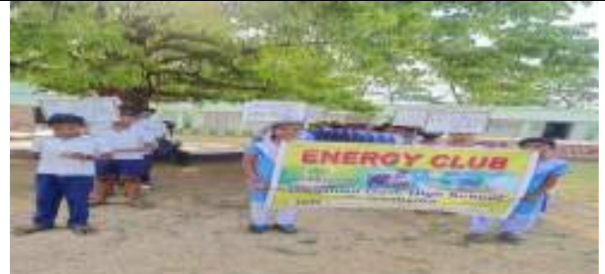
UTKALMANI GOVT HIGH. SCHOOL BAIGANABADIA