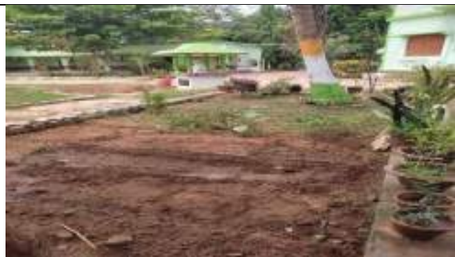
MAHARATHA GOVT. HIGH SCHOOL, NAHARAKANTA