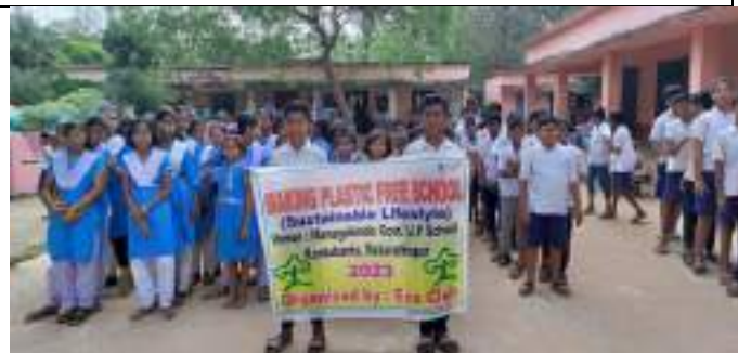
MANAGOBINDA GOVT. U.P. SCHOOL