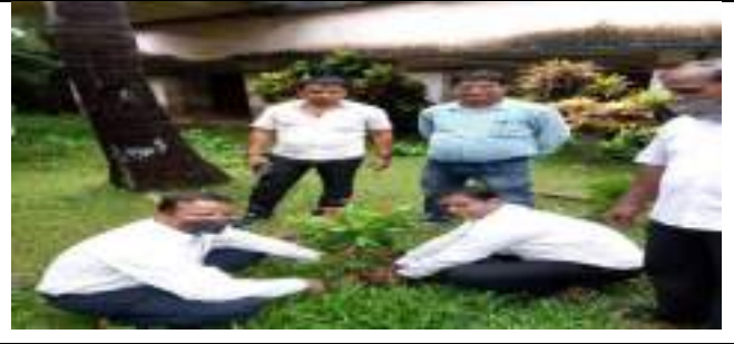
BIUTUPALI J.B.H.S MAULSINGA