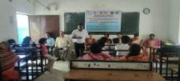
DAS MOHAPATRA BANCHHANIDHI GOVERNMENT HIGH SCHOOL, SRIJUNG