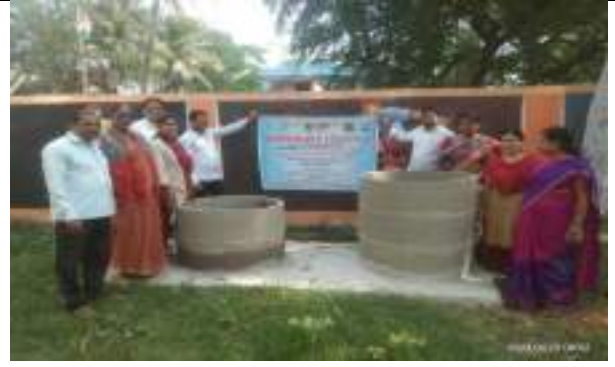
MATHADIHA NODAL HIGH SCHOOL