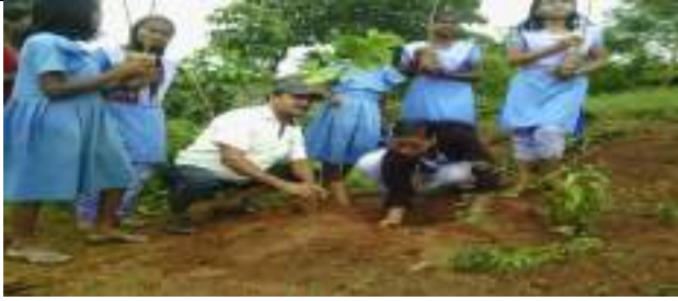
LABANGIRI GOVT. HIGH SCHOOL, JAMUKOLI