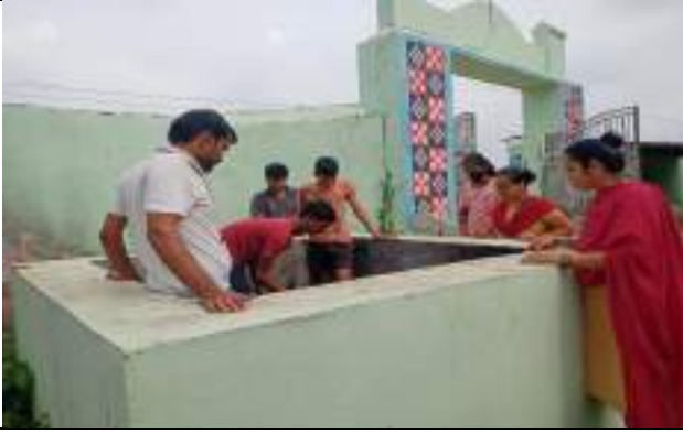
SN HIGH SCHOOL, PALASAHI