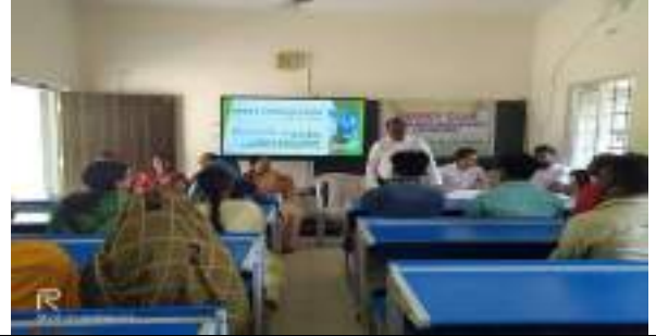
GOVT. HIGHSCHOOL, KARAMDIHI