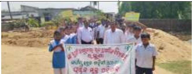
MAABUDHIJAGULAI U.P(ME) SCHOOL, RASUNA