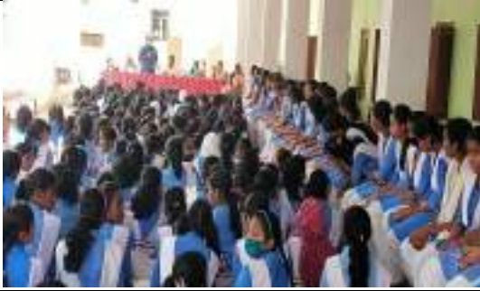
PANCHAYAT HIGH SCHOOL, KENVETA