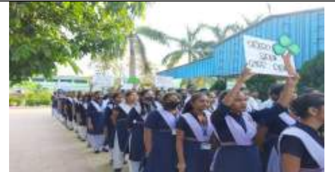
KCP PANCHAYAT HIGH SCHOOL, GIRINGKELA