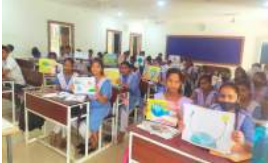
GOVT. (COE) HIGH SCHOOL, KUTRA