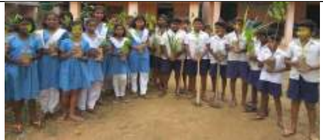
GOVT.HIGH SCHOOL PURUNAKATAK