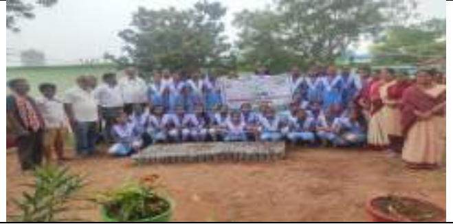
MGP H.S POLSAGORA