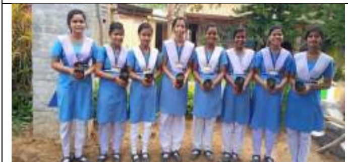
GOVT. GIRLS HIGH SCHOOL, ATHGARH, CUTTACK