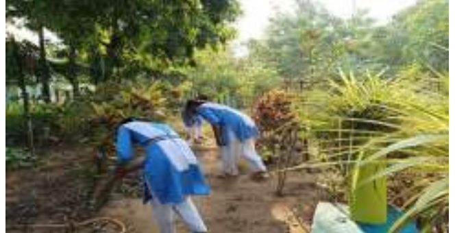
KABI SAMRAT BIDYAPITHA, KULLADA