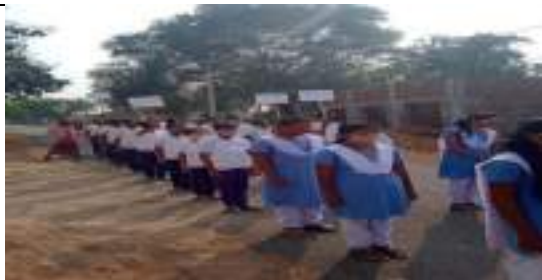
GOVT. HIGH SCHOOL, KALUNGA