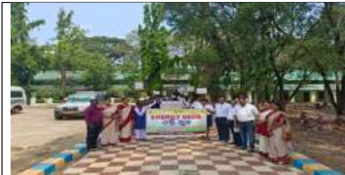
M.P.C HIGH SCHOOL, BETNOTI