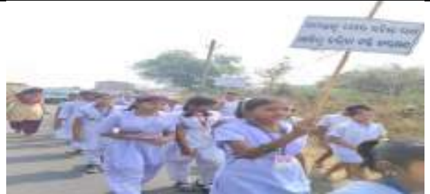
GOGUA HIGH SCHOOL, BARGOGUA