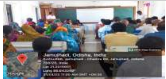
DAMODAR GOVT. HS, JAMUJHADI