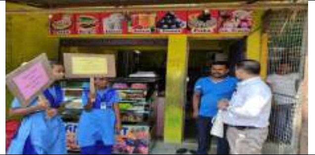
SPA GIRLS HIGHSCHHOL, BANOKOI