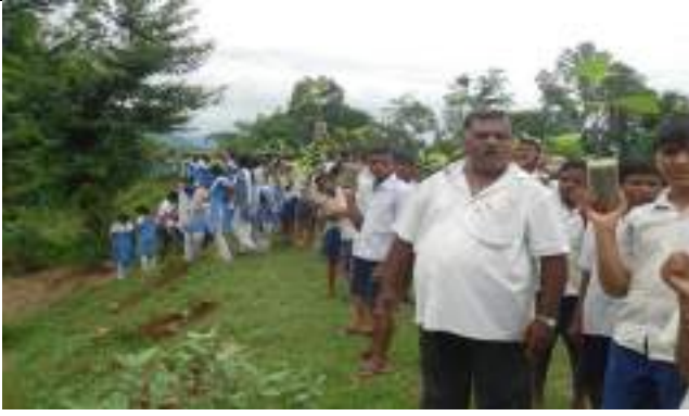
SAKUNTALA DEVI GOVT. HIGH SCHOOL