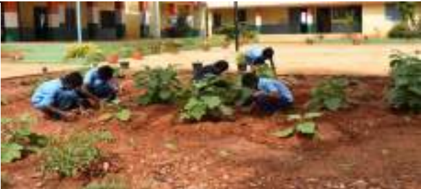
GOVT. HIGH SCHOOL IRC VILLAGE