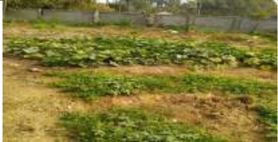
GOVT. UP SCHOOL, KANGUMAJHIGUDA