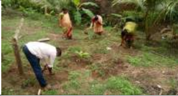
GOVT.UGHS, RAIPUR, UMERKOTE