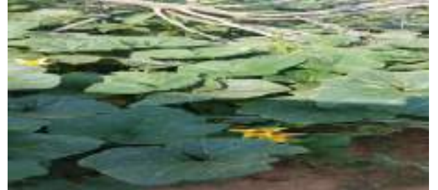
PATEN HIGH SCHOOL PATKHALIA