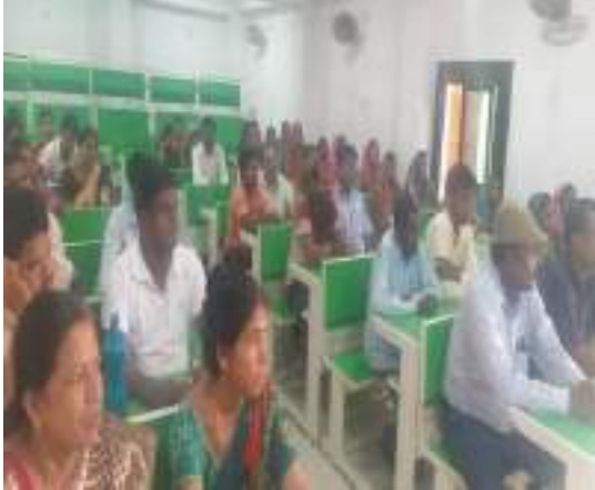
GOVT. UG HIGH SCHOOL, MAHURA