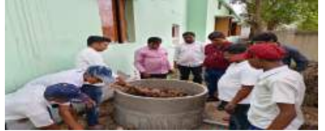
K.T HS, SANKHULA