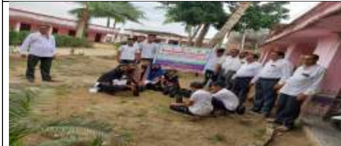
NAIGUAN DAUDPUR H.S, KOILI BLOCL