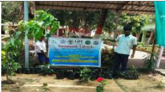
JHUNJHUNUWALA BIDYAPITHA, BARANGA