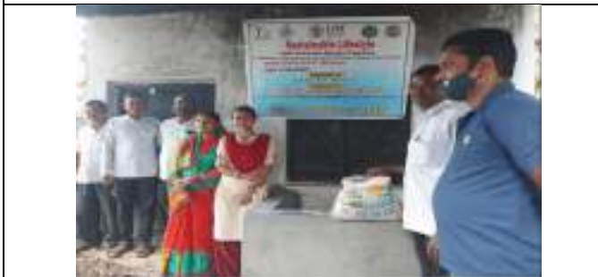
S.N HS BHIMPUR