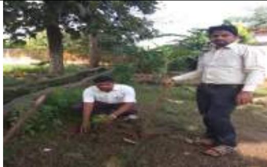
GOVT EX-BOARD UPS RAIGHAR