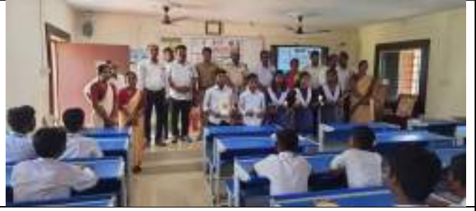
LAHUNIPARA HIGH SCHOOL