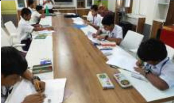
G.B HIGH SCHOOL, POLASARA