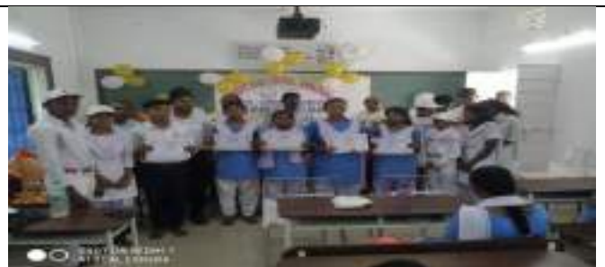
GOVT HIGH SCHOOL DHALPUR