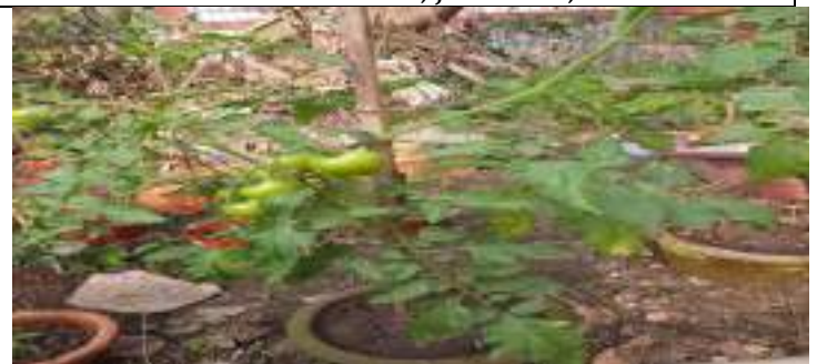
GOVT. HIGH SCHOOL, PAIKATIGIRIA