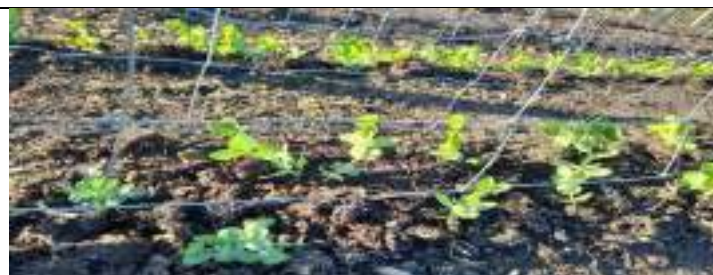
GOPABANDHU H/S, BEGUNIA