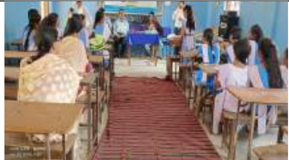
GOPINATH BIDHYA PEETHA, KHARANIPADA