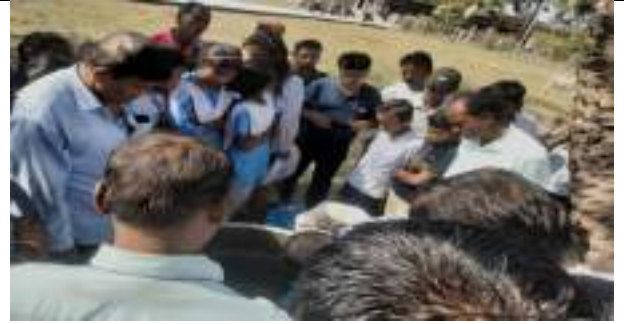
UPENDRANATH BIDYAPITHA SAHADA