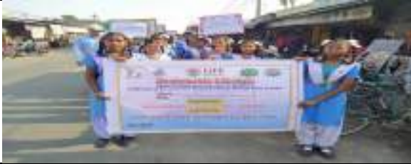
UPENDRA GOVT HS SUBDEGA