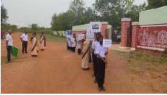
GOVT HIGH SCHOOL BADASAH