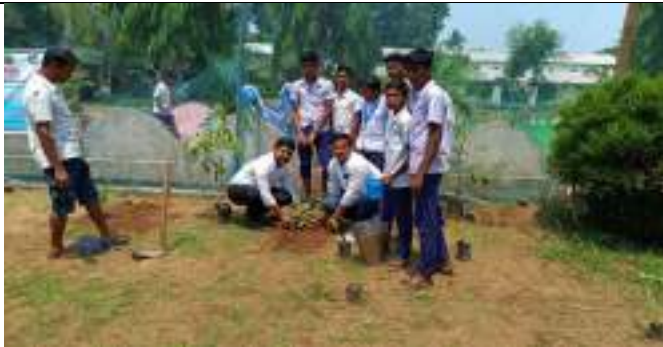
VIVEKANANDA VIDYAPITHA, BAHUGRAM