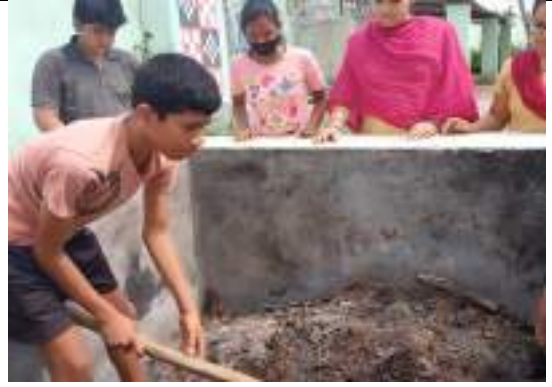
SN HIGH SCHOOL, PALASAHI