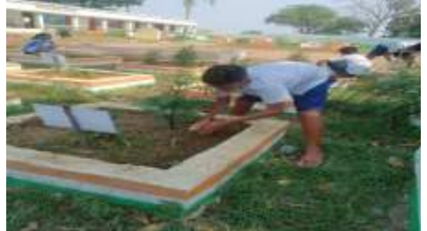
U.G GOVT. NODAL HS, TELIBANDHA