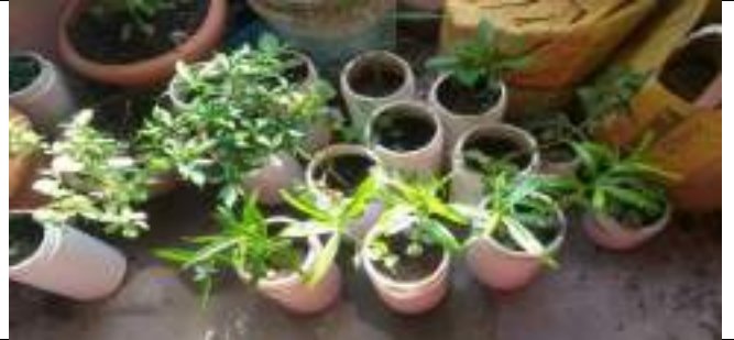
BALUNKESWAR NODAL BIDYAPITHA, DEULI