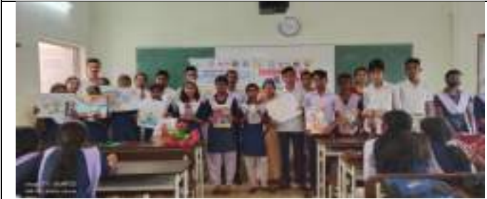
JAWAHAR GOVT. HIGH SCHOOL