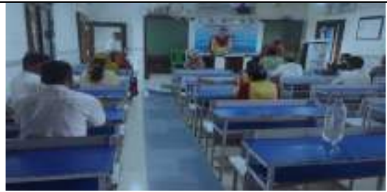
UNION GOVT. HS DUBLAGADIR