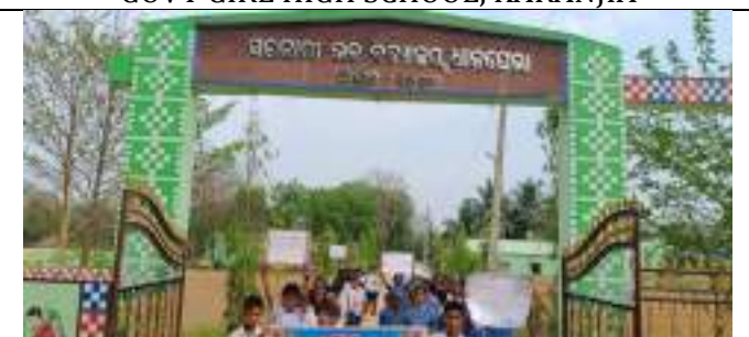
GOVT HIGH SCHOOL, DHANGHERA