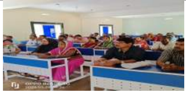
RAGHUNATH NODAL ACADEMY, SARASWATIPUR