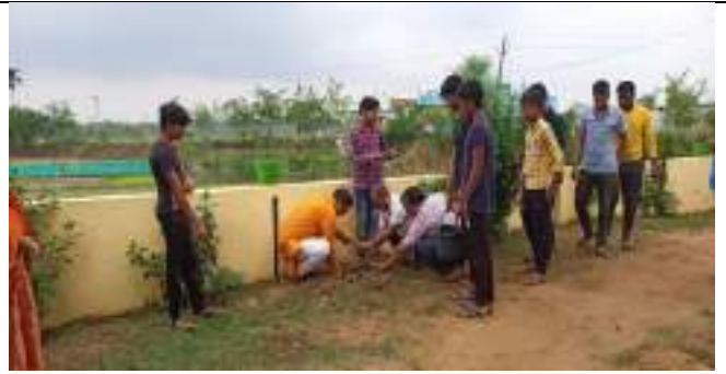
SC HIGH SCHOOL, BM PUR