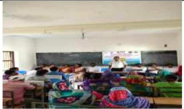
SIDDHESWAR HIGH SCHOOL, AMARDA ROAD