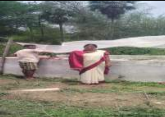
SIDDHESWAR HIGH SCHOOL, AMARDA ROAD