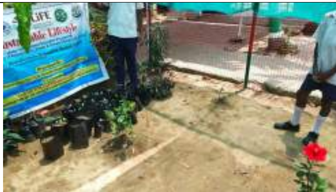
JHUNJHUNUWALA BIDYAPITHA BARANGA