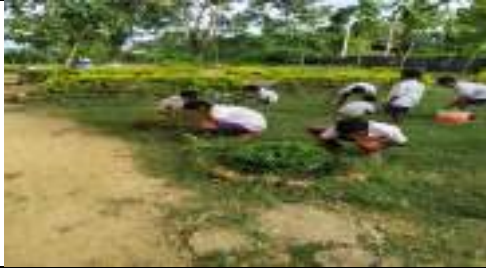
DAMA MUNDA H.S