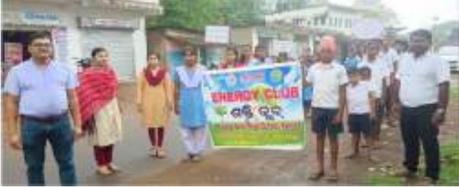
MANIDA GOVT. HIGH SCHOOL