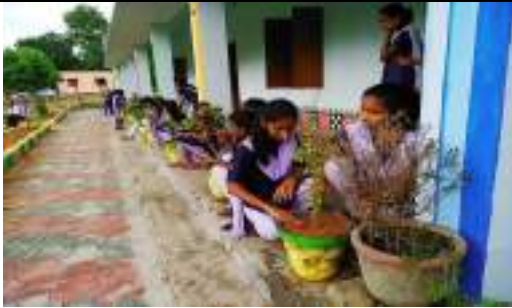
GAPABANDHU GOVT.HS HAREKRUSHNAPUR