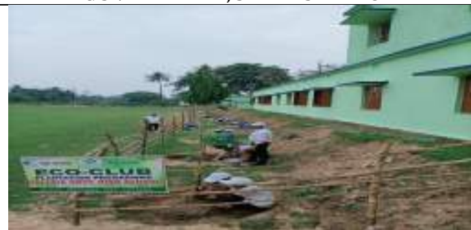
HALADIAGOV'T HIGH SCHOOL, MAHANGA