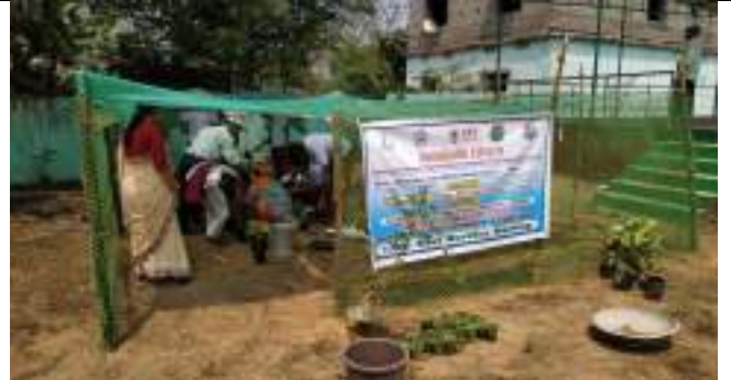
SIDDHESWARA VIDYA MANDIRA NARAJ CUTTACK