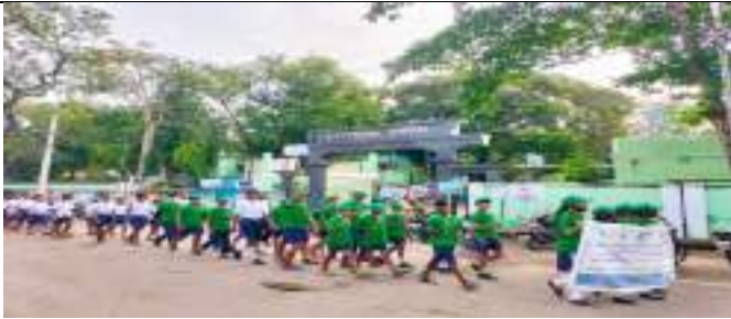
UPENDRA BHANJA HIGH SCHOOL