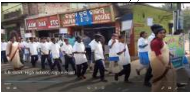
SASHI BHUSANA GOVT HIGH SCHOOL