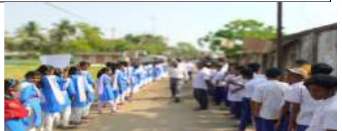
JAJPUR ZILLA SCHOOL, JAJPUR