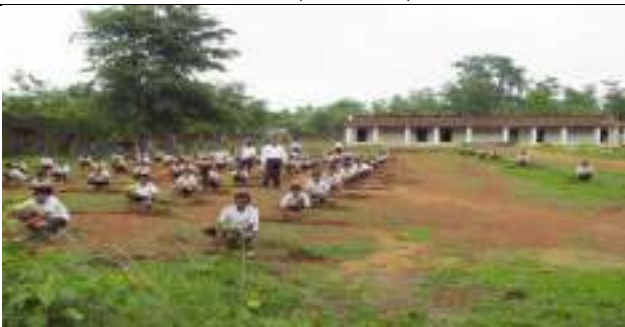
S.M.ALIGOVT.HIGH SCHOOL, JADUPUR, DUMUDUMA