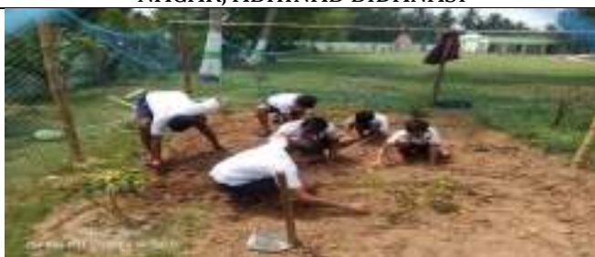
MAA TARINI NODAL BIDYAPITHA, GOPALPUR