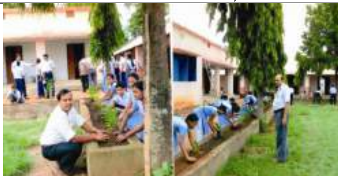
GOVT.HIGH SCHOOL, KAIPADAR, KHORDHA