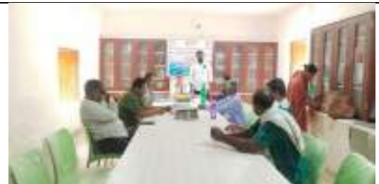
S.N. HIGH SCHOOL, KESHARIPUR