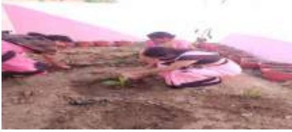
GOVT. SSD GIRLS HS JODINGA