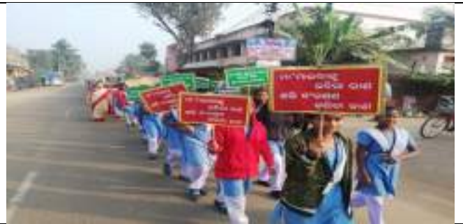
SIMILIPAL NODAL HIGH SCHOOL