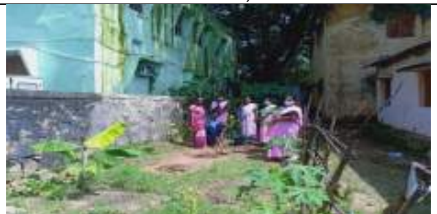
GOVT. UGUP CHIKILI