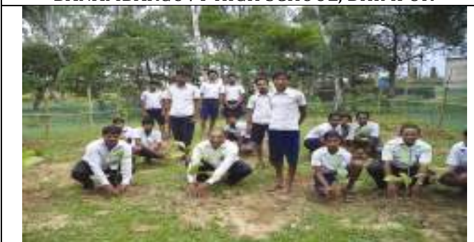
GOVT.HIGH SCHOOL, SAGARGUAN