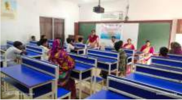
GOVT HIGH SCHOOL, MAHARAJPUR