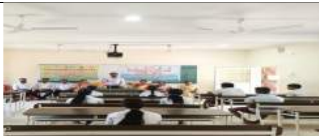
GOVT HIGH SCHOOL SANKERKO