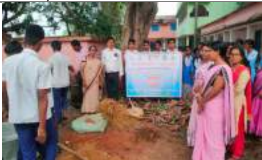
BRAHMAPUR NODAL HIGH SCHOOL, ICHHAPUR