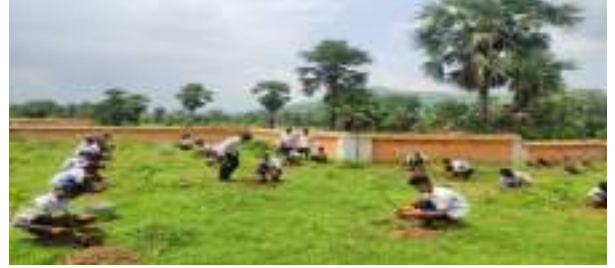
PANCHAYAT H.S CHARICHHAK