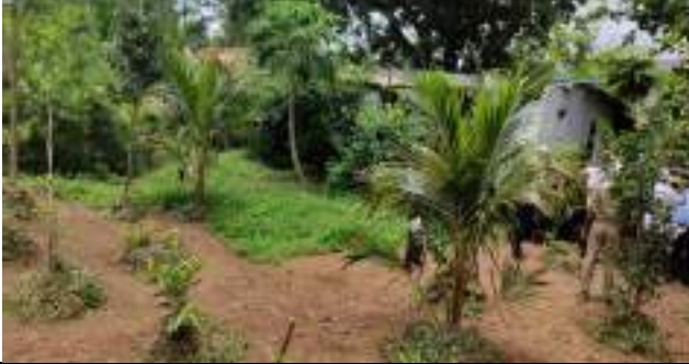
SRI BUDDHANATH GOVT HIGH SCHOOL, BALLIPATANA.