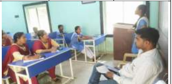
BALUKESWAR HIGH SCHOOL, OLAMBA