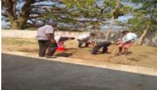
NODAL GOVT. UGHS, JHADABANDHAGUDA