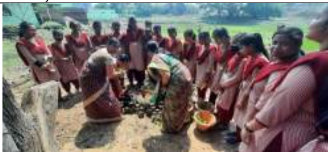
LAKSHESWAR WOMEN'S HIGHER SECONDARY SCHOOL