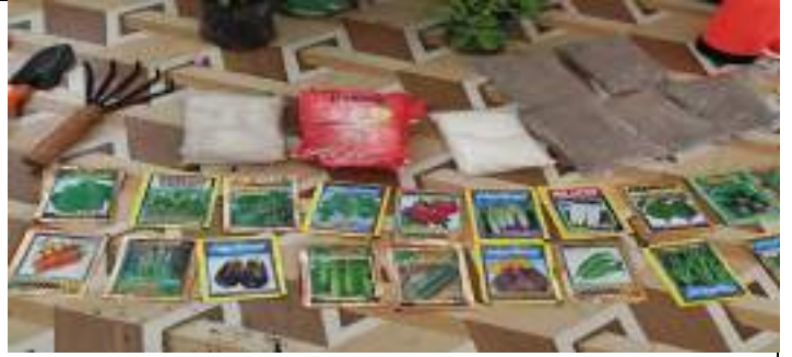
GOVT HIGH SCHOOL ,V.S.S. NAGAR