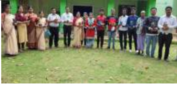
GOVT.U.G.HIGH SCHOOL SVVM. UMERKOTE