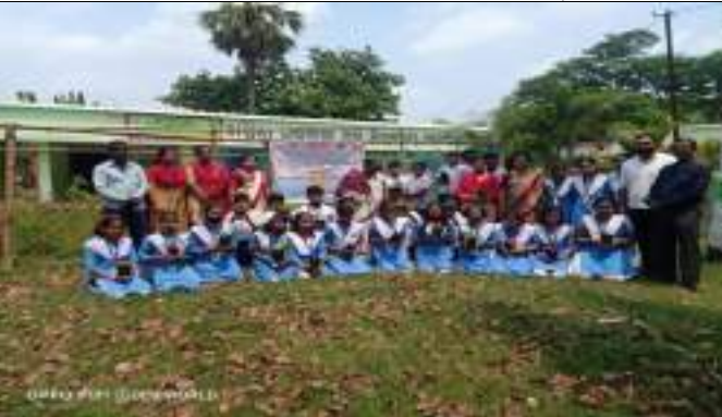
BAPUJI GOVT. HIGH SCHOOL PATPUR