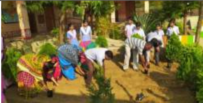
BANAMALIPUR UGME SCHOOL