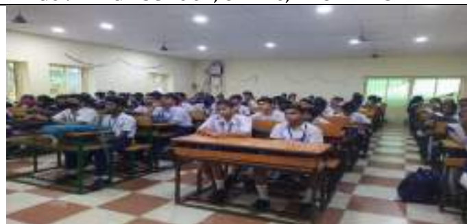
GOVT HIGH SCHOOL, UNIT-6, BHUBANESWAR