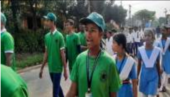
MADAN MOHAN NODAL HIGH SCHOOL, GIRISOLA