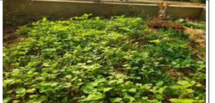
GOVT.GIRLS HIGH SCHOOL, UNIT-1, BBSR