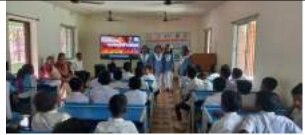
JAIRAM GOVT.HIGH SCHOOL,LEPHRIPARA