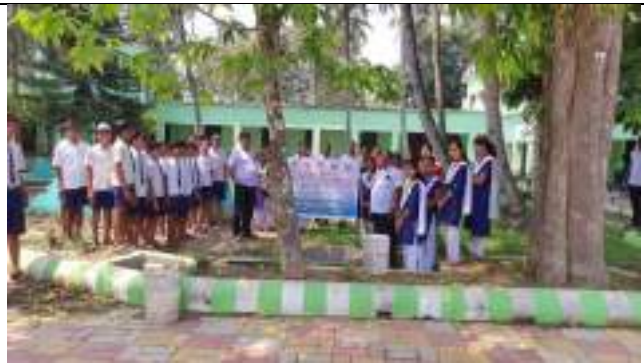
G.N. HIGH SCHOOL, IRDA