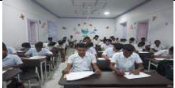
TPS GOVT. HIGHSCHOOL, BANDHAPALI