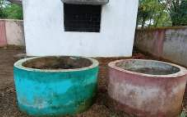
ISWARPUR HIGH SCHOOL