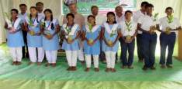
GOVT.H/S GURUJANGA, KHORDHA