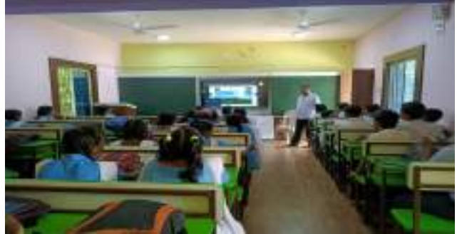
GOVT. (COE) HIGH SCHOOL, KUTRA