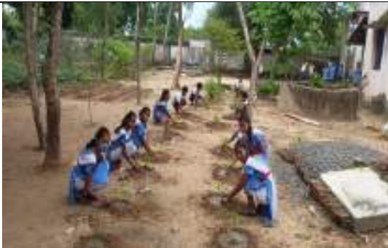
GOVT. HIGH SCHOOL, KOSAGUMUDA