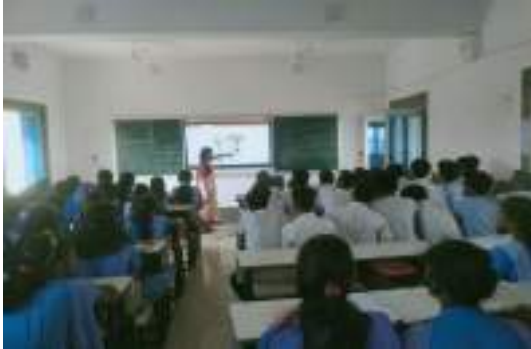
GOVT. HIGH SCHOOL, BANDHBAHAL