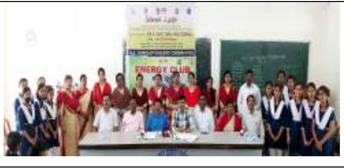
M.P.K. GOVT GIRL HIGH SCHOOL