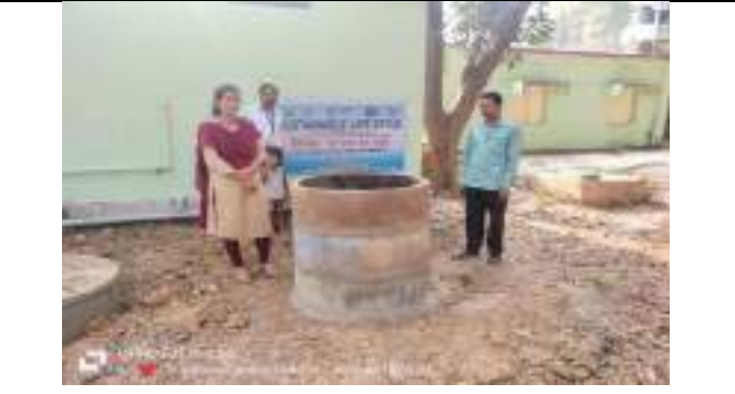
SDJ HIGH SCHOOL