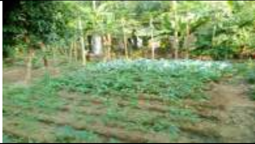
SANGRAMI MAHAMADABAJI HIGH SCHOOL, JHARIGAM